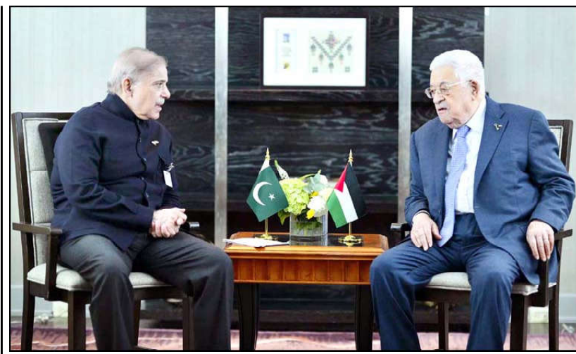
NEW YORK: Prime Minister Muhammad Shehbaz Sharif meeting with the President of the State of Palestine Mahmoud Abbas on the sidelines of the 79th session of the United Nations General Assembly.

proved the pact for the future. We must give life to our commitments otherwise, the future will be bleak and dangerous," he stressed. As regards the Kashmir issue, he emphasized that the Council could no longer ignore the fostering Jammu and Kashmir dispute. "It poses a great threat to international peace and security. The council must call for a halt to the massive violations of the fundamental rights of Kashmiri people and implement its own resolutions that demand a plebiscite for self-determination in Kashmir valley," the prime minister added.