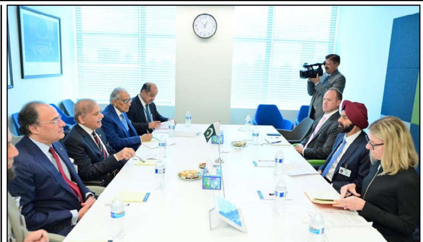
Prime Minister Muhammad Shehbaz Sharif meets Mr. Ajaypal Singh Banga, President of the World Bank on the sidelines of the UNGA in New York. Finance Minister, Muhammad Aurangzeb was also present in the meeting.

Meanwhile five more ships, Phoenicianm, Ashico Victoria, Cape Andreas, Solar Roma and Papino scheduled to load/offload Rice, Container and steel coil are also arrived at outer anchorage port during last 24 hours. A total of ten ships were engaged at PQA berths during the last 24 hours, out of them five ships, Maersk Cape Town, SSL Brahmaputra, North Berwick, Bentley-I and Al-Deebal left the port on today morning, while two more ships, Scarable and Cape Andreas are expected to sail on today afternoon. Cargo volume of 97,522 tonnes, comprising 77,632 tonnes imports cargo and 19,890 tonnes export cargo carried in 1,866 Containers (845 TEUs Imports & 1,021 TEUs Export) was handled at the port during last 24 hours.