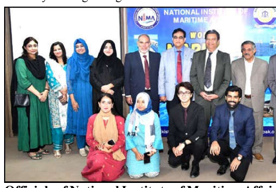
Officials of National Institute of Maritime Affairs in a group photo during Seminar on World Maritime Day 2024 at Bahria University Karachi.