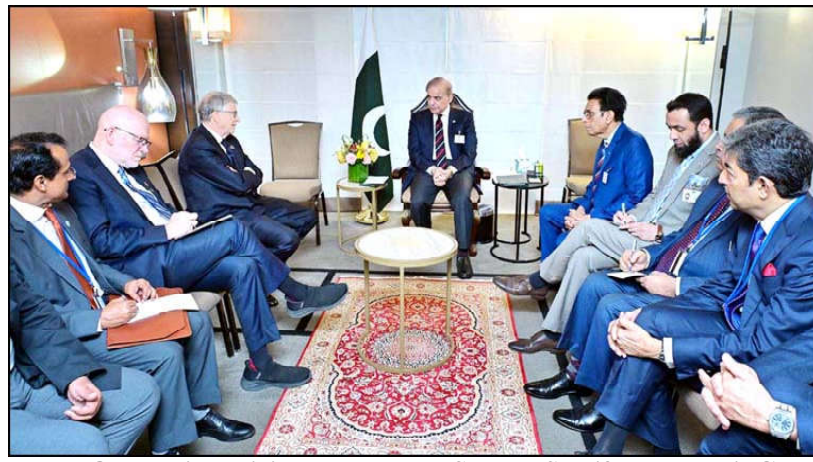
NEW YORK: Prime Minister Muhammad Shehbaz Sharif meets Mr. Bill Gates, founder and co-chair of the Bill & Melinda Gates Foundation (BMGF) on the sidelines of the 79th Session of the United Nations General Assembly.

on a comprehensive Health Dialogue with Afghanistan and requested support for the initiative. He also communicated his willingness to focus more on the pockets where the number of missed children or refusal of polio vaccines is higher especially where the morbidity of children is higher. He also shared with the prime minister on King Salman Humanitarian Aid and Relief Centre's support for polio and other health relief-related initiatives. He also shared with the Prime Minister BMGF's work on nutrition especially the micronutrients for pregnant women and how it can be increased by providing them additional vitamins in support of UNICEF.