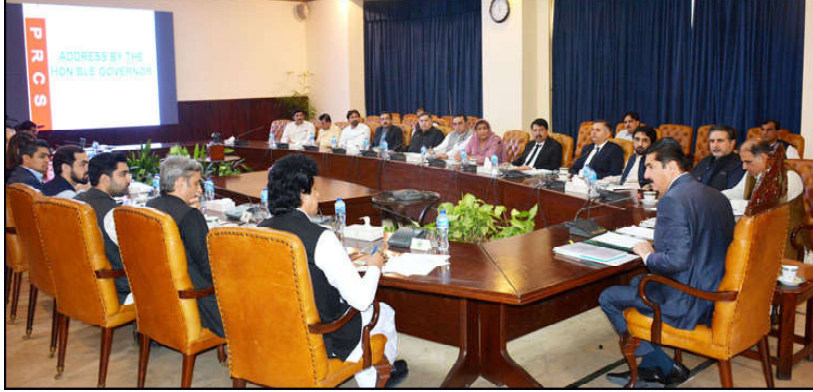
PESHAWAR: Khyber Pakhtunkhwa Governor Faisal Karim Kundi presides over the meeting of Pakistan Red Crescent Society Khyber Pakhtunkhwa Branch at Governor House.