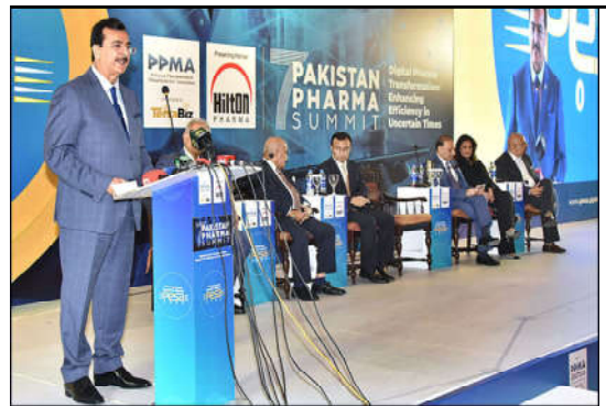
ISLAMABAD: Chairman Senate, Syed Yousuf Raza Gilani addressing as chief guest of 3rd Pesa Export Awards in Islamabad.

During the session, Minister Jam Kamal Khan asked council members to submit proposals for further review by the Executive Committee of Commerce, chaired by the Commerce Minister himself.