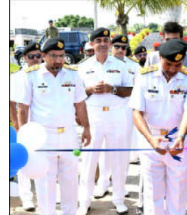
KARACHI: Commandant PNS BAHADUR inaugurating World Maritime Day Gala 2024 at Pakistan Maritime Museum.

The theme is closely linked with the UN 2030 Agenda for Sustainable De-