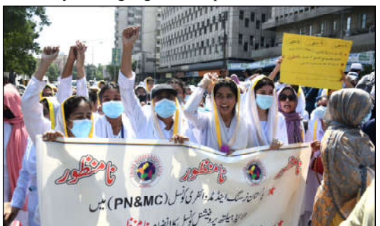
KARACHI: Nurses of Pakistan Nursing and Midwifery Council are protesting outside the press club for their demands.