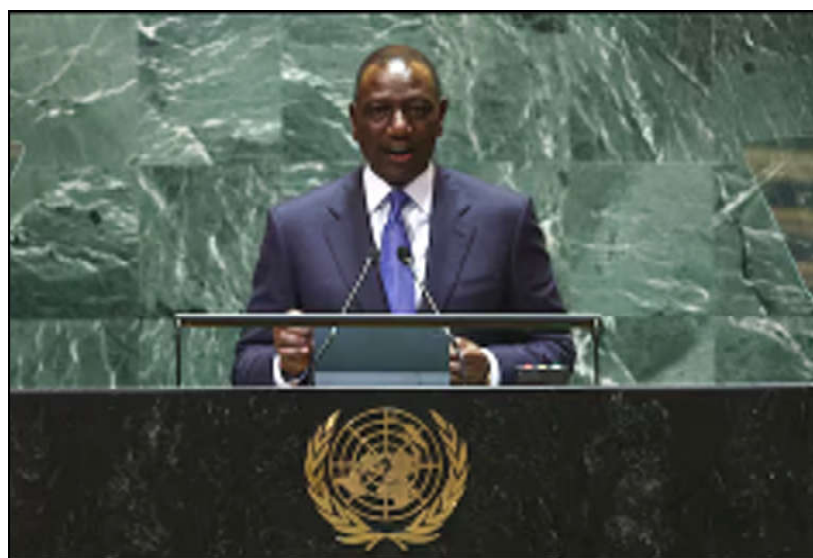
Kenya's President William Ruto addresses the 79th United Nations General Assembly at United Nations headquarters in New York, U.S.