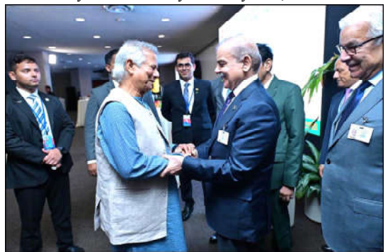
NEW YORK: Chief Advisor (Head of Government) of the Interim Government of Bangladesh Dr. Muhammad Yunus receives Prime Minister Muhammad Shehbaz Sharif at the reception to commemorate 50th Anniversary of Bangladesh's membership in the United Nations.

President Erdogan expressed his admiration for Prime Minister Shehbaz's economic policies, which had played a crucial role in stabilizing Pakistan's economy and commended his leadership and commitment to economic reforms. Furthermore, he also extended his heartfelt birthday wishes to the prime minister who celebrated his 73rd Birthday this week.