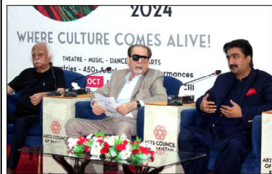
KARACHI: Sindh Minister for Culture, Tourism, Antiquities and Archives Syed Zulfikar Ali Shah along Arts Council of Pakistan President Muhammad Ahmad Shah addressing to media persons during press conference regarding World Culture Festival Karachi, held at Arts Council building in Karachi.