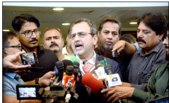
KARACHI: Federal Minister for Power Sardar Awaiz Ahmed Khan Leghari talks to media after attending "Power Reforms Roundtable" at IBA main campus.