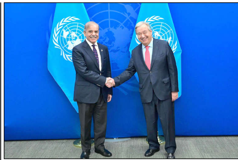
NEW YORK: Prime Minister Muhammad Shehbaz Sharif meets with Secretary General of the United Nations Antonio Guterres on the sidelines of 79th session of United Nations General Assembly.

ISLAMABAD (APP): The Ministry of Law and Justice on Wednesday clarified that no notification has been issued regarding the appointment of a new Chief Justice of Pakistan. The Ministry termed the notification as fake, which is viral on social media and claiming the appointment of Syed Mansoor Ali Shah as the new CJP.