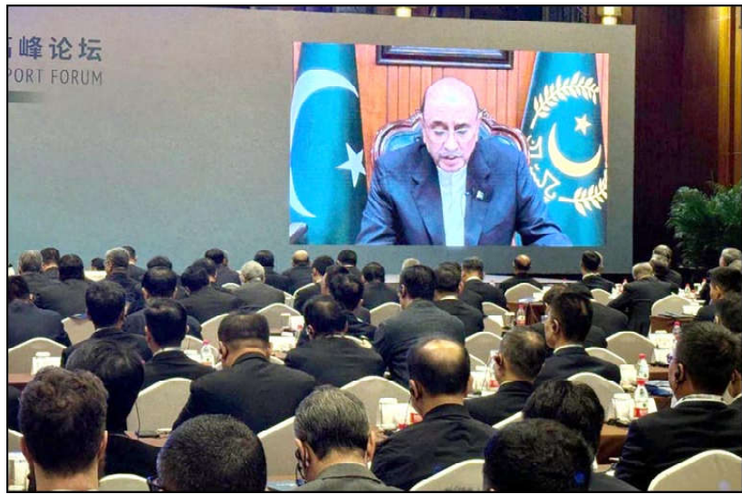
ISLAMABAD: President Asif Ali Zardari addressing the Global Sustainable Transport Forum-2024, through a video message, in Beijing, China.