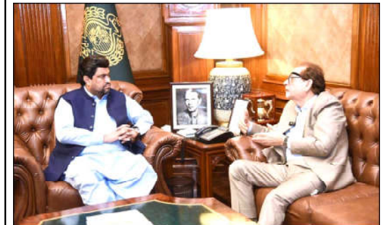
KARACHI: President Arts Council Pakistan, Ahmed Shah calls on Sindh Governor Kamran Khan Tessori at Governor House.

They assessed preparations for the upcoming 7th session of Pakistan-Turkiye High-Level Strategic Cooperation Council (HLSCC) to be held in Islamabad in the near future. The two leaders also discussed regional and global developments, especially the ongoing genocide and the dire humanitarian situation in Gaza. They called for an immediate humanitarian ceasefire in Gaza and end of hostilities. Prime Minister Shehbaz appreciated Turkiye's firm and consistent support for the oppressed people of the Indian Illegally Occupied Jammu and Kashmir (IOJK).