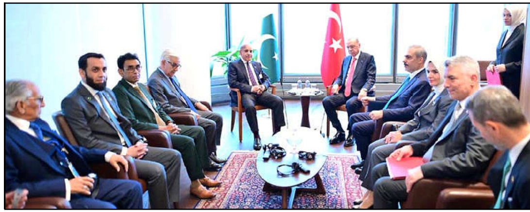
NEW YORK: Prime Minister Muhammad Shehbaz Sharif meet with Turkish President Recep Tayyip Erdogan on the sidelines of the 79th United Nations General Assembly Session.

They assessed preparations for the upcoming 7th session of Pakistan-Turkiye High-Level Strategic Cooperation Council (HLSCC) to be held in Islamabad in the near future. The two leaders also discussed regional and global developments, especially the ongoing genocide and the dire humanitarian situation in Gaza. They called for an immediate humanitarian ceasefire in Gaza and end of hostilities. Prime Minister Shehbaz appreciated Turkiye's firm and consistent support for the oppressed people of the Indian Illegally Occupied Jammu and Kashmir (IOJK).