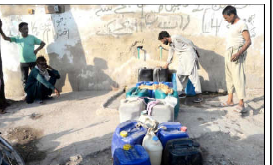
HYDERABAD: People busy in filling their cans