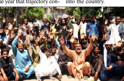
HYDERABAD: Residents of Shahdadpur are holding protest demonstration against high handedness

Muhammad Aurangzeb said, "More importantly policy rate is coming down. Few days back the government has rejected all bids aimed at conveying the message that with the grace of Allah Almighty, the government is under no desperation to borrow, and if it has to borrow, it will borrow at its own terms." Banking sector should start lending to