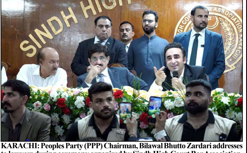
to lawyers during ceremony organized by Sindh High Court Bar Association. held in Karachi.

The task force has asked the owners of the IPPs to end capacity charges payment and charge against the power supplied to the government only.