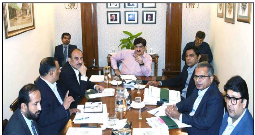
KARACHI: Sindh Chief Minister, Syed Murad Ali Shah presides over the Information Technology Department meeting, held at CM House in Karachi.