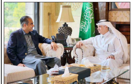
ISLAMABAD: Federal Minister for Interior Mohnsin Naqvi in a meeting with Ambassador of Saudi Arabia Nawaf bin Said Ahmed Al-Maliki.