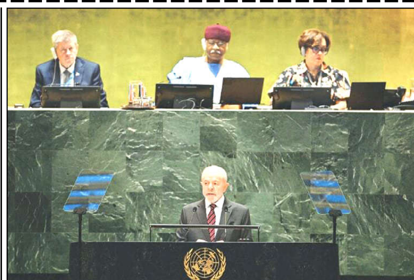
NEW YORK: President of Brazil Luiz Inácio Lula da Silva speaks during 'Summit of the Future' on the sidelines of the UN General Assembly.