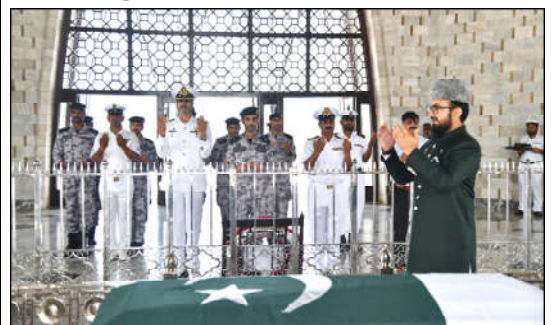
Qatar Emiri Naval Forces delegation offering Fateha at Mazar-e-Quaid during visit to Karachi.

ISLAMABAD (APP): Federal Minister for Law and Justice Azam Nazeer Tarar on Monday said that a lot of questions were still unanswerable in the detailed judgement announced by the Supreme Court in the reserved seats case. The Pakistan Tehreek-e-Insaf (PTI), he said, had not been a party in the reserved seats case at any forum, including the Election Commission of Pakistan (ECP), Peshawar High Court (PHC) or the SC. He said courts were used to give decisions on principles that who had filed the case and what relief was prayed by the petitioner. Such questions were not answered in the reserved seats case as the apex court seemed to have not examined those aspects, the law minister said while addressing a press conference. Azam Tarar said that independent candidates had joined the Sunni Ittehad Council (SIC) willfully and that their move was irreversible as per the law. He said that the ECP was an independent institution working under constitutional oath and it had to render its responsibility under the law. Similarly, he said, that the legislation was the sole prerogative of the Parliament. The judgment had not commented on the amendments in the election law, he added.