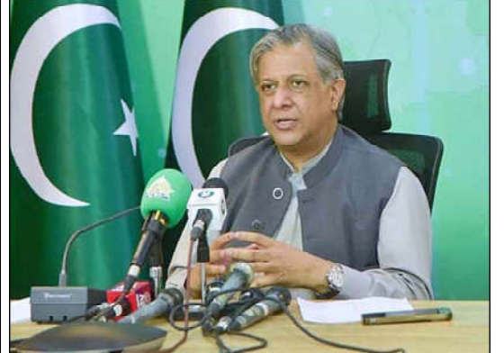
ISLAMABAD: Federal Minister for Law and Justice Senator Azam Nazeer Tarar addressing an important press conference.

KARACHI (INP): JUI-F head Maulana Fazlur Rehman said that "neither the constitution nor the law has been safe in Pakistan. Addressing a gathering in Karachi, JUI leader said that the Parliament and other institutions have also not been safe. He said Pakistan's friendly nations are also worried, how to save the country? "We are not prepared for compliance of the constitution," Fazlur Rehman said. "Bring changes (in constitution), but those changes that should not reflect your specific political