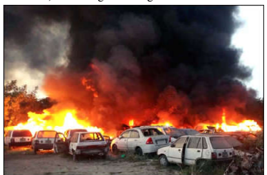
KARACHI: View of huge fire flames and dark smokes rise from burning vehicles after fire broke out incident near Qurtaba Mosque Clifton in Shireen Jinnah Colony in Karachi.