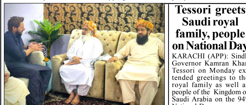
KARACHI: Jamiat Ulema-e-Islam (JUI-F) Chief, Maulana Fazal-ur-Rehman exchanges views with Former Pakistan Captain and All-Rounder, Shahid Khan Afridi during meeting held in Karachi.