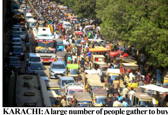
KARACHI: A large number of people gather to buy and sell birds at a weekly birds market located on Liaquatabad area in Karachi.

KARACHI (INP): A video showing Pakistan Railways employees stealing diesel from Karachi Railway depot has surfaced online. In a video, three employees of Pakistan Railways including an engine driver can be seen stealing the diesel from Karachi Cantt Railway Station depot. Sources stated that the suspects had been involved in diesel theft for the past three months. The accused have been arrested, and a case has been registered at the Cantt police station.