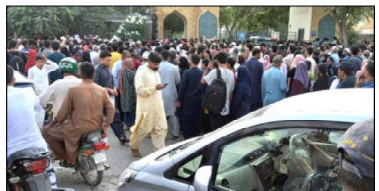
KARACHI: A large number of students are gathered outside the Dow Ojha Campus to attend the Entry Test of Medical and Dental College Admission Test (MDCAT) in Karachi.