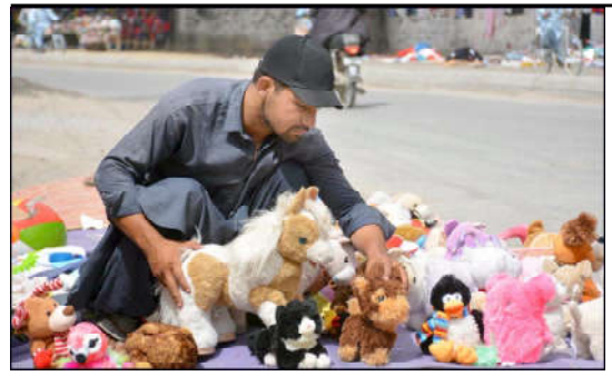
QUETTA: A vendor displaying stuffed toys to attract the customers at roadside near Sunday Bazaar at Joint road.