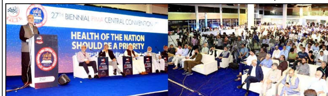
KARACHI: Jamaat-e-Islami (JI) Pakistan Ameer Engr Hafiz Naemur Rehman addressing at the two-day biannual countrywide central convention organized by the Pakistan Islamic Medical Association (PIMA) at the Karachi Expo Center.

of healthcare facilities in the province. He also criticized the exorbitant fees of medical colleges, which he argued are depriving middle-class families of educational opportunities. "Heavy tuition fees are preventing aspiring doctors from pursuing their dreams, further widening the gap between the rich and the poor," he stated. Addressing broader societal issues, Hafiz Naem emphasized the collective responsibility of society to steer the younger generation away from drug abuse and other social problems.