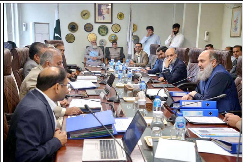
ISLAMABAD: Commerce Minister Jam Kamal Khan chairs the 85th EDF Board meeting, approving Rs. 8.5 billion for initiatives aimed at boosting Pakistan's textile, agriculture and global branding efforts.

Irfan Malik stated that Rs 10,500 each were disbursed among 131,000 beneficiaries through 120 retailers registered with the BISP across the district. He added that strict monitoring of disbursement of quarterly tranche was being ensured to provide full payment to the deserving beneficiaries in a transparent manner.