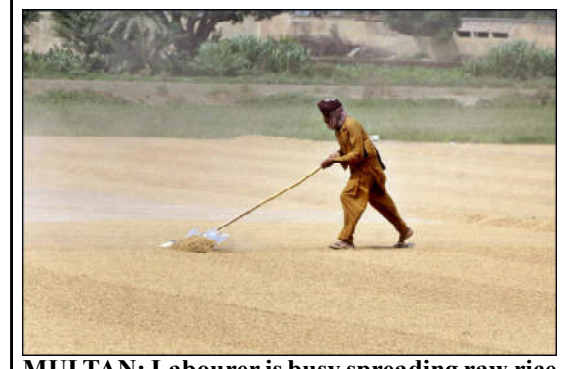
MULTAN: Labourer is busy spreading raw rice for drying in the field.

Experts were of the view that these IPPs have earned hundreds of times their profit, so the contracts should be reviewed. According to the sources, IPPs installed wind plants of the same capacity in Pakistan four times more expensive than in Bangladesh and Vietnam, and committed an over invoicing. Despite coal reserves in Pakistan, IPPs are dependent on imported fuels such as high-speed diesel and imported coal for power generation. Costly electricity is being generated due to these initiatives of IPPs. According to sources, IPPs did not generate as much electricity as they imported fuel and also received billions of rupees subsidy from the government.