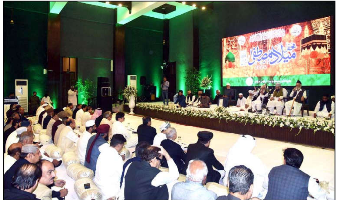
KARACHI: The Sindh Chief Minister organized an Eid Milad-un-Nabi programme at CM House in Karachi. Renowned Naat Khawans recited naats, and religious scholars delivered speeches on the life and teachings of Holy Prophet (PBUH).

Allah stresses the injunction to respect the beliefs of others: "And do not insult those they invoke other than Allah, lest they insult Allah in enmity without knowledge." He said this verse highlights the importance of tolerance and respect for differing beliefs as a foundation for peaceful coexistence. He said that Islam guarantees the protection of minority rights within an Islamic state, underscoring the shared basic beliefs of all revealed religions, particularly the oneness of Allah.