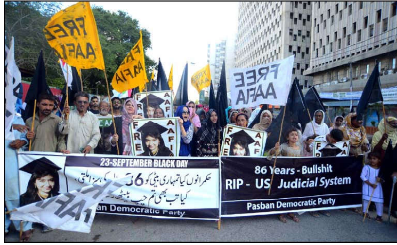
KARACHI: Activists of Pasban Democratic Party (PDP) are holding protest demonstration for release of Pakistani Neuroscientist, Dr. Aafia Siddiqui, at Karachi press club.

"National unity for political stability will prove to be the guarantee of Pakistan's bright economic future and relief from inflation," he remarked. To address the country's ongoing economic and security challenges, the prime minister called for collaboration between political parties, institutions, and provinces. "To tackle economic challenges and terrorism, the nation, political parties, institutions, and provinces must work together," he urged. Recalling the past political instability, PM Shehbaz Sharif lamented that a lot of time had been wasted in political chaos therefore wasting more time was not in the interest of the country and the nation. On the economic front, the prime minister was optimistic about the country's progress, noting that inflation had returned to single digits and that Pakistan's overall economic situation was improving. "Thank God, inflation has returned to single digits, and the economic situation is improving," he said, highlighting key indicators such as rising exports, the stability of the rupee, increasing remittances, and declining interest rates.