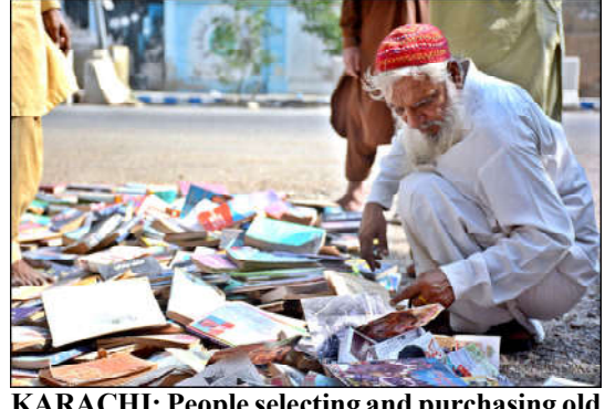
KARACHI: People selecting and purchasing old books at Reagal Chowk.