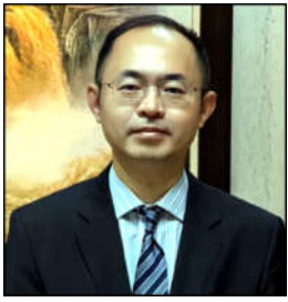
By Zhang Hao

In June of this year, the China-Pakistan Friendship Hospital (CPFH) in Gwadar, Balochistan, was officially handed over to the Pakistani side. As a significant livelihood project under the framework of the China-Pakistan Economic Corridor (CPEC), this modern comprehensive hospital, with 150 beds, features an intensive care unit, a neonatal intensive care unit (NICU), and four fully equipped operating rooms. It serves over 900 patients daily and employs nearly 300 local people.