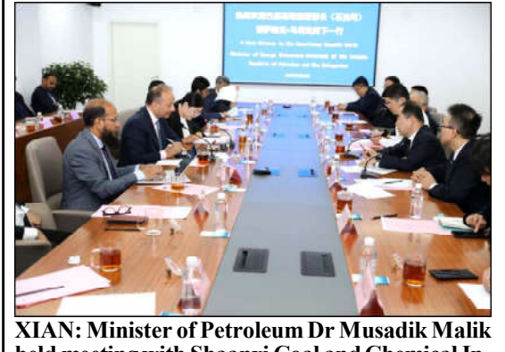
XIAN: Minister of Petroleum Dr Musadik Malik held meeting with Shaanxi Coal and Chemical Industry Group to expand partnership in coal.

The Karachi police are continuing their search for the remaining fugitive members of the gang. On August 3, the police managed to bust another honey trap gang in Lahore.