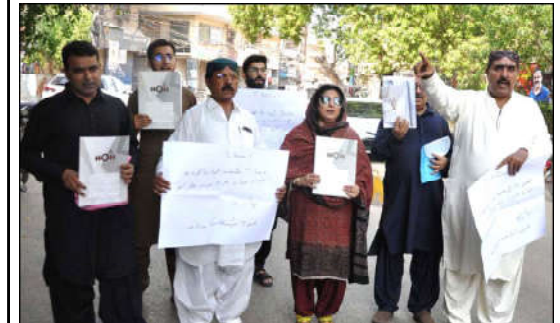
HYDERABAD: Allottees of Shams Icon Plaza are holding protest demonstration for demanding possession, at Hyderabad press club.