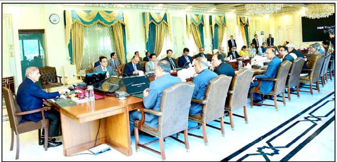
ISLAMABAD: Prime Minister Muhammad Shehbaz Sharif chairs a meeting on transformation plan of Federal Board of Revenue.