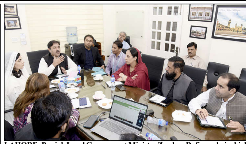
LAHORE: Punjab Local Government Minister Zeeshan Rafique chairs high level meeting regarding preparation of app for citizens under "Suthara Punjab Program".

He said that the relations between the two countries are based on common religion, culture and mutual support. He stressed the need for exchange of trade delegations between the two countries. The Ambassador of the Republic of Azerbaijan to Pakistan, Khazar Farhadov said that Pakistan stood with Azerbaijan in difficult times. He expressed determination to enhance trade relations between the countries. He said that plan for preferential trade facilities for Pakistani businessmen was on the cards. He said that there are vast opportunities for cooperation in infrastructure and energy sectors between Azerbaijan and Pakistan. He reaffirmed his commitment to foster economic relations with Pakistan.