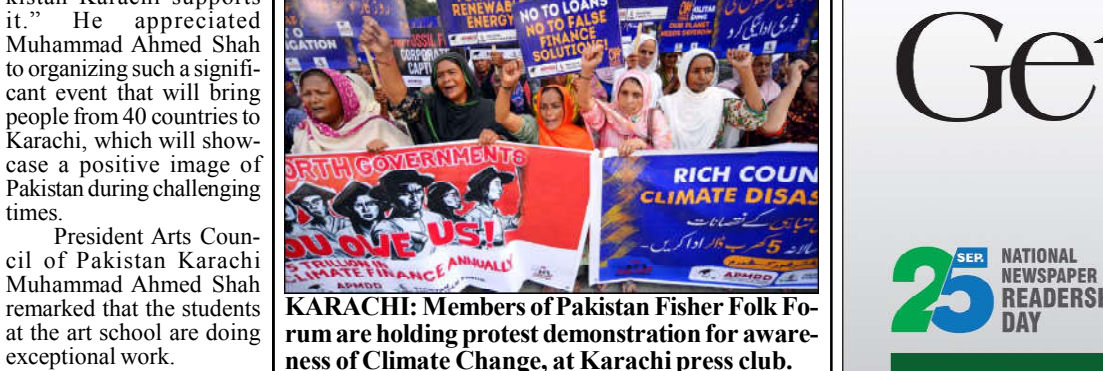
KARACHI: Members of Pakistan Fisher Folk Forum are holding protest demonstration for awareness of Climate Change, at Karachi press club.