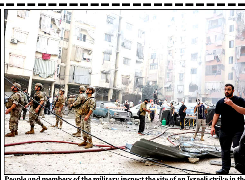
People and members of the military inspect the site of an Israeli strike in the southern suburbs of Beirut, Lebanon.

Aqil has a $7 million bounty on his head from the United States over his link to the deadly bombing of Marines in Lebanon in 1983, according to the U.S. State Department website. The Israeli military reported warning sirens sounded in northern Israel following the Beirut strike. Israeli media reported heavy rocket fire in northern Israel. Hezbollah said it had fired Katyusha rockets at what it described as the main intelligence headquarters in northern Israel "which is responsible for assassinations". White House spokesman John Kirby said he was not aware of any Israeli notification to the United States before the Beirut strike, adding that Americans were strongly urged not to travel to Lebanon, or to leave if they are already there.