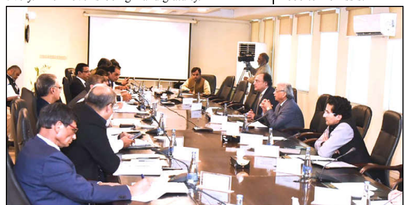
ISLAMABAD: Federal Minister for Finance and Revenue Senator Muhammad Aurangzeb chairs the meeting of the Economic Coordination Committee (ECC) at the Finance Division.

LAHORE (INP) The district administration of Lahore has decided to permit Pakistan Tehreek-e-Insaf (PTI) to hold a rally in Lahore but with some caveats. The decision includes strict adherence to Standard Operating Procedures (SOPs) to ensure safety and order during the event, as confirmed by a spokesperson. Currently, officials are in discussions to finalise the venue for the rally. Sources indicate that the Kahna Maweshi Mandi (Cattle Market) is being considered as a potential location. PTI had initially requested to hold the rally at Minar-e-Pakistan ground. However, based on the District Intelligence Committee's report, alternative locations such as Kahna Cattle Market, Shahpur Kanjran, and Saggian Bridge are also under consideration.