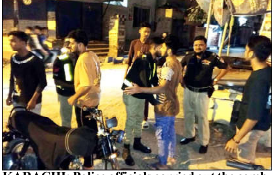
KARACHI: Police officials carried out the combing search operation against criminals as security has been tightened in city due to security reasons, at Saudabad area in Karachi.