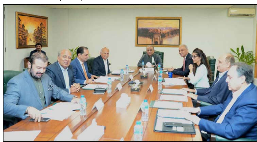
Federal Minister for Privatisation, Abdul Aleem Khan presiding Privatisation Commission Board Meeting in Islamabad.