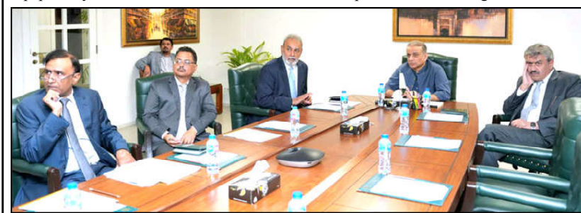
ISLAMABAD: Federal Minister Communications, Privatization & Board of Investment Abdul Aleem Khan presides over high level meeting of NHA.