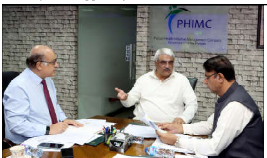
LAHORE: Punjab Minister for Health Khawaja Salman Rafique chairs high level meeting at Punjab Health Initiative Management Company.

The ongoing projects include the construction of the six kilometer-long Hayatabad Jogging and Cycling Track in the provincial capital, the renovation and construction of Peshawar Zoo Road (Palosi Road), the Iqra Chowk Island on University Road, the Park Avenue Island on University Road, and the construction of the Walkway Town Market. Additionally, several projects have been completed at the historic University of Peshawar, including the renovation of the university, repair and construction of the main roads, flooring of key areas, construction of public washrooms, and modern parking facilities.