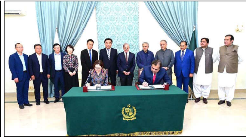
ISLAMABAD: Prime Minister Muhammad Shehbaz Sharif witnesses signing of an MoU between Board of Investment and RUYI Shangdong.

on, the case that comes first would be taken up first by the court and the cases coming after would be fixed on their number. He said that in a case under section 184(3), it will have to be written why it was a matter of public importance. A formal order will be issued that if a case under Section 184(3) was taken up, whether it was a case of public importance, or human rights issue. He said under the ordinance, on 184 (3) any order passed by the Supreme Court, the right of appeal had been granted. According to this ordinance, a transcript will be prepared of the proceedings including judges' remarks and observations during the case and this text will also be available to the public.