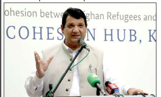
KARACHI: Federal Minister for States, Frontier Regions and Kashmir Affairs and Gilgit Baltistan, Engineer Ameer Maqam, addressing to elders of Afghan Refugees during visit of Urban Cohesion Hub Karachi.

He criticised former chief justices Iftikhar Chaudhry, Saqib Nisar, and Gulzar Ahmed for perpetuating a system where nepotism influenced judicial appointments.