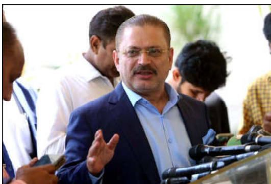
KARACHI: Sindh Minister for Information, Transport and Mass Transit, Excise Taxation and Narcotics Control, Sharjeel Inam Memon addresses to media persons during press conference, held at Sindh Assembly building in Karachi.

Speaking to the media at the Sindh Assembly Media Corner, Sindh Senior Minister and Provincial Minister for Information, Transport, Excise, Taxation, and Narcotics Control, Sharjeel Inam Memon, stated that the funds obtained from the premium number plates are being allocated to the world's largest housing project for flood victims, as envisioned by Chairman Bilawal Bhutto Zardari.