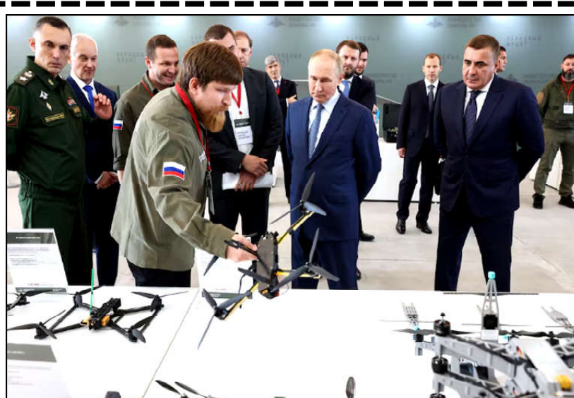
Russia's President Vladimir Putin visits a drone production facility of the Special Technology Centre in Saint Petersburg, Russia.

The Reuters Daily Briefing newsletter provides all the news you need to start your day. Sign up here.