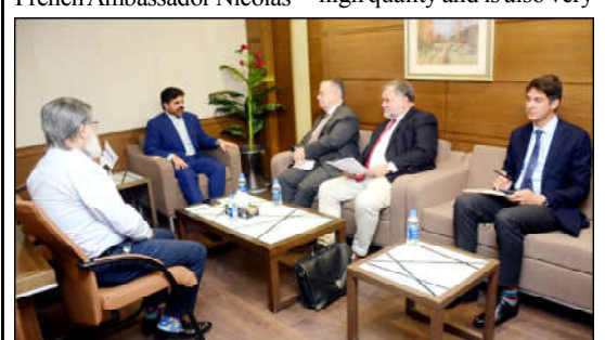
KARACHI: Sindh Minister for Information, Transport and Mass Transit, Excise Taxation and Narcotics Control, Sharjeel Inam Memon addresses to media persons during press conference, held at Sindh Assembly building in Karachi.

test of Thar coal has been conducted by the world's largest and most authoritative institute, according to the report, Thar coal is of high quality and is also very suitable for gasification. Sindh Transmission and Dispatch Company (STDC) is the first provincial grid company which is a PGC license holder with a mandate to develop 132KV power transmission infrastructure under the direction and vision of Chairman Bilawal Bhutto Zardari, steps are being taken to provide free electricity to the people of Sindh.