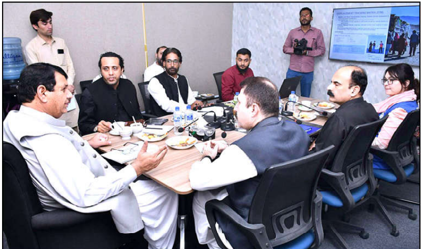
ISLAMABAD: President Asif Ali Zardari in a meeting with the visiting Deputy Prime Minister of Russia, Alexei Overchuk, at Aiwan-e-Sadr.

connectivity to strengthen economic relations between the two nations.