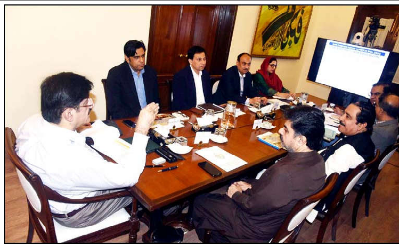
KARACHI: Sindh Chief Minister, Syed Murad Ali Shah presides over a meeting regarding repairing of flood-affected roads, at CM House in Karachi.

He emphasized that it was incumbent upon us all to follow the Prophet's (PBUH) examples of helping and benefiting others, with special attention to those suffering from poverty, hunger, and hardships.