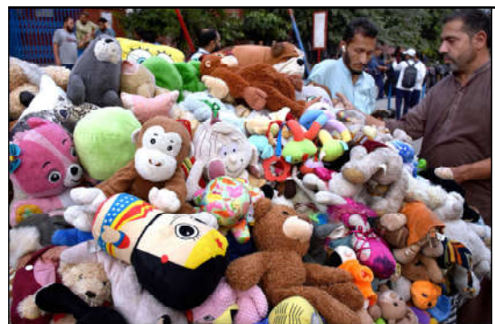
LAHORE: A vendor displaying and selling the used toys on their handcart at Landa Bazar in the Provincial Capital.

Similarly, continuous rains over the past two weeks in Sindh have further delayed cotton picking and it resulted in labour shortages and price.