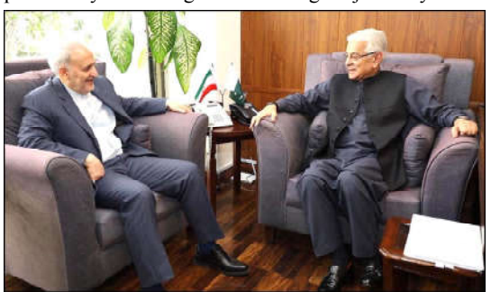
ISLAMABAD: Iranian Ambassador to Pakistan Dr. Reza Amiri Moghadam called on Federal Minister for Defence, Defence Production, and Aviation Khawaja Muhammad Asif.

support of the required number of MNAs and senators, from the treasury and opposition benches, it badly failed in its efforts. But even after receiving the setback, the government insisted that it had not backed down and the proposals to alter the constitution were still on the table. The opposition, mainly led by former prime minister Imran Khan's PTI slammed the proposed reforms, calling them "unconstitutional" and saying that no draft of the proposed changes had been shared with them or the media. According to statements made by the opposition parties and local media reports, the government's package includes more than 50 proposals, most of them concerning the judiciary.