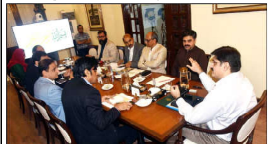
KARACHI: Sindh Chief Minister, Syed Murad Ali Shah presides over a meeting to assess the damage caused to the city roads by the 2024 heavy rainfall, at CM House in Karachi.