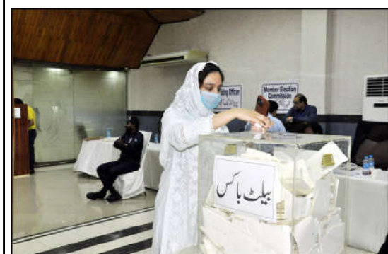
FAISALABAD: Voters casting their votes during the Elections of Chamber of Commerce in the city.

He said that Prime Minister Shehbaz Sharif had set up a Gems and Stone Committee which would form a growth-oriented policy with the consultation of all stakeholders.