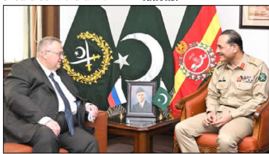
RAWALPIDI: Russian Deputy Prime Minister Alexei Overchuk meeting with Chief of Army Staff Syed Asim Munir at the General Headquarters.

The resolution is the first to be formally put forward by the Palestinian Authority since it gained additional rights and privileges this month including a seat among UN members in the assembly hall and the right to propose draft resolutions.