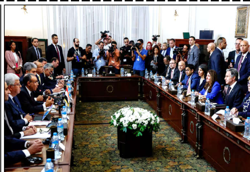
U.S. Secretary of State Antony Blinken attends a U.S.-Egypt strategic dialogue with Egypt's Foreign Minister Badr Abdelatty in Tahrir Palace in Cairo, Egypt.

had been agreed by all sides. Making progress involved long waits for messages to be passed between the parties that left time for incidents to disrupt the talks, Blinken said. "We've seen that in the intervening time, you might have an event, an incident - something that makes the process more difficult, that threatens to slow it, stop it, derail it - and anything of that nature, by definition, is probably not good in terms of achieving the result that we want, which is the ceasefire," Blinken said. He cited Hamas' execution of six Israeli hostages last month. He did not name Israel, which is believed to have targeted members of groups aligned against it in Lebanon, Syria and Iran that have set back the talks.