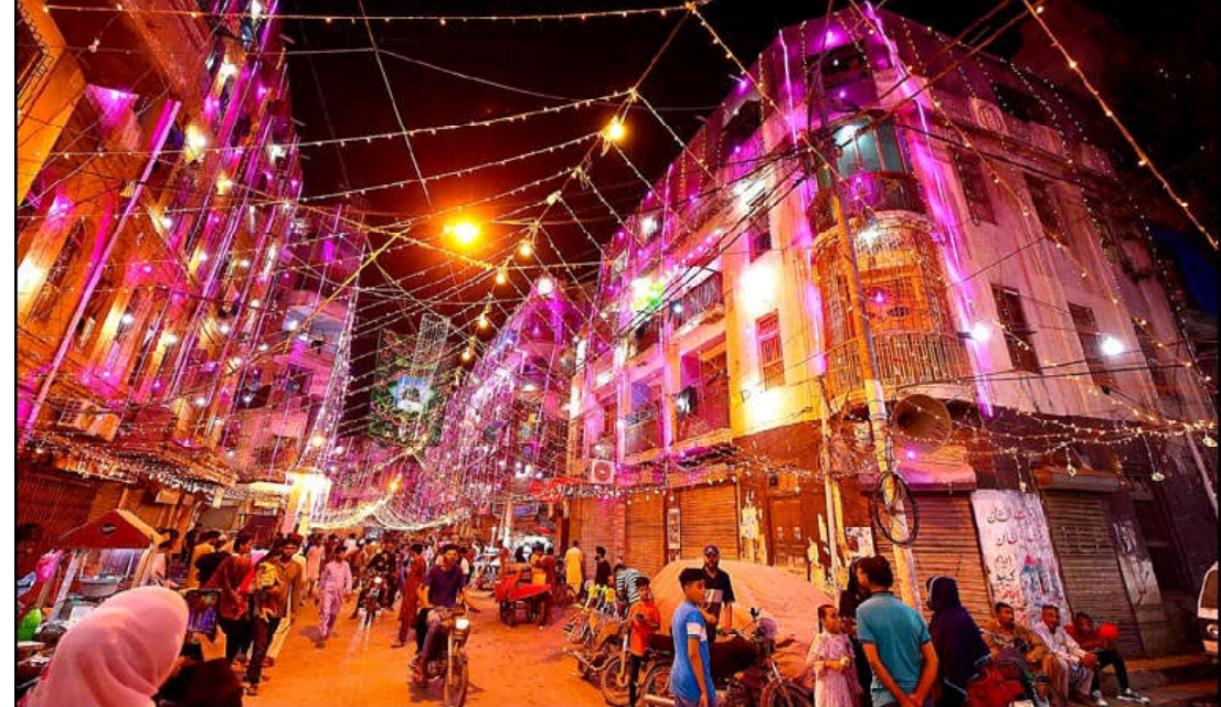
KARACHI: A view of an illuminated street for the celebrations of Mawlid al-Nabi, the birth anniversary of Prophet Muhammad, in Karachi, Pakistan.

will continue to move forward," he added. In response to a query regarding the opposition's claim of not receiving the draft of the amendments, he clarified that constitutional drafts are never made public, rather these are presented in the Parliament. Earlier, the federal government was set to make another attempt today to pass its proposed 22 constitutional amendments package in the Senate and National Assembly (NA).