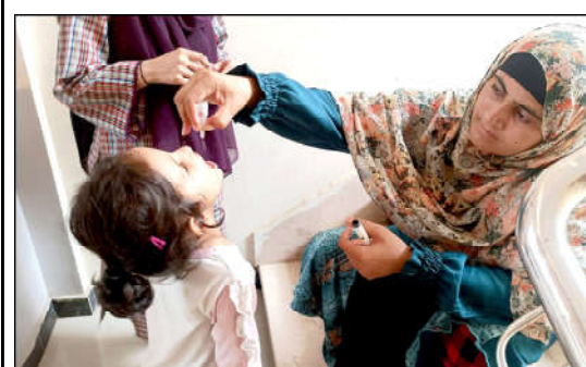
KARACHI: A health worker administering Polio Vaccine Drop to a girl during Polio Vaccination Door-to-Door Campaign in the city.