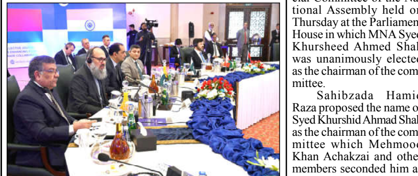
ISLAMABAD: Federal Minister for Commerce, Jam Kamal Khan addresses the 23rd meeting of the Ministers of the Member States of the SCO 'Responsible for Foreign Economic and Trade Activities'.

The collective vision of the SCO Ministers on these issues was articulated in the Ministerial Statement adopted by the Meeting, which inter alia underscored the importance of fair trade practices.