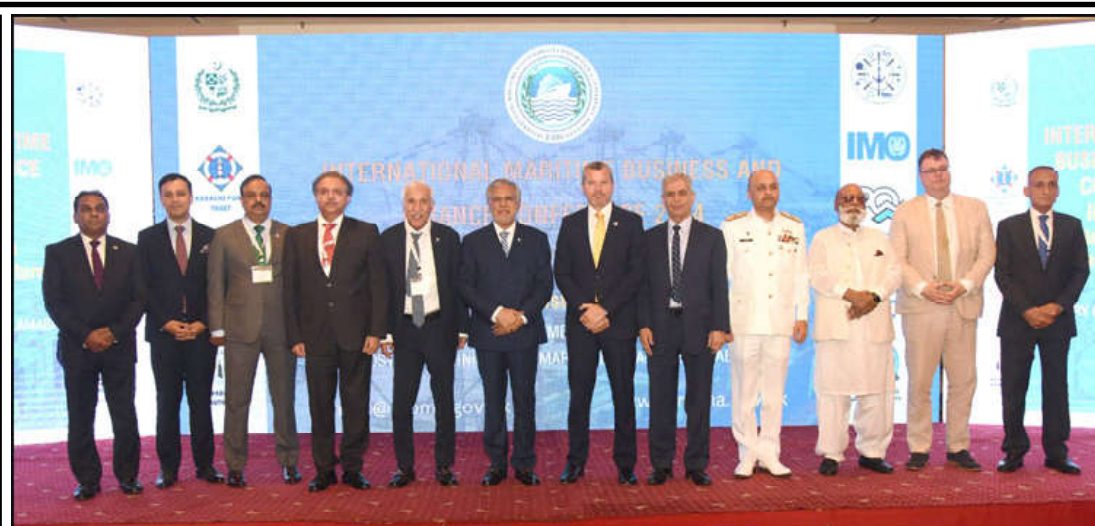
ISLAMABAD: Deputy Prime Minister and Minister for Foreign Affairs, Senator Mohammad Ishaq Dar and Federal Minister for Maritime Affairs, Qaiser Ahmed Sheikh in a group photo at International Maritime Sustainability Exhibition & Conference Pakistan IMSEC-2024.

The head of the delegation said that there is a vast scope for investment in Punjab and "We will take advantage of the investment opportunities."