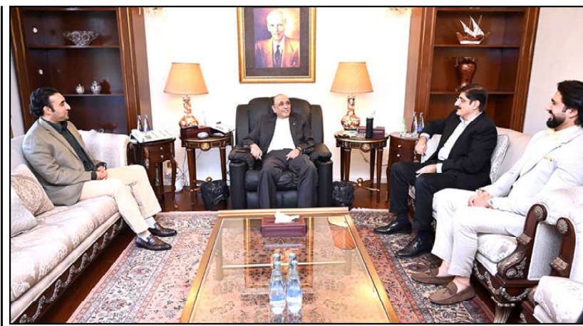
ISLAMABAD: Chief Minister Sindh Syed Murad Ali Shah, calls on President Asif Ali Zardari, at Aiwan-e-Sadr. Chairman Pakistan People's Party and MNA, Bilawal Bhutto Zardari, is also present in the meeting.