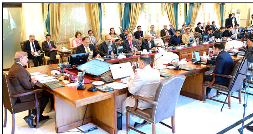
ISLAMABAD: Prime Minister Muhammad Shehbaz Sharif chairs the Federal Cabinet meeting.

The prime minister expressed hope that the policy rate could gradually decrease to single digits, in line with the country's inflation rate.