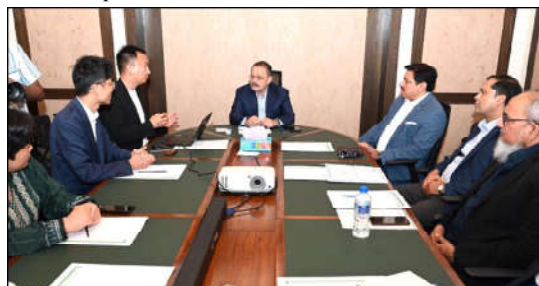
KARACHI: Sindh Senior Minister Sharjeel Inam Memon presiding over a meeting with representatives from the Chinese automobile manufacturer GAC and Dewan Motors.

He stated that the introduction of electric taxis will not only provide safe and modern travel options for people but will also help protect the environment by reducing carbon emissions.