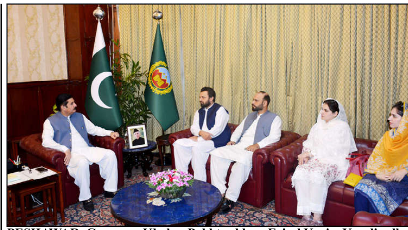
PESHAWAR: Governor Khyber Pakhtunkhwa Faisal Karim Kundi called on by faculty members of Sarhad University of Science & Information Technology at Governor House.

research and practical work for the students. They informed the Governor about a proposal sent to the Higher Education Commission, JICA, and the Museum Department, adding the HED also had not seen any progress since 2021 in this regard. Additionally, the delegation proposed establishing a Biennale 3D Installation Exhibition in Peshawar. During the discussion, the Governor assured full support for the department and recommended preparing a comprehensive new proposal. He also suggested informing him about countries that support fine arts.