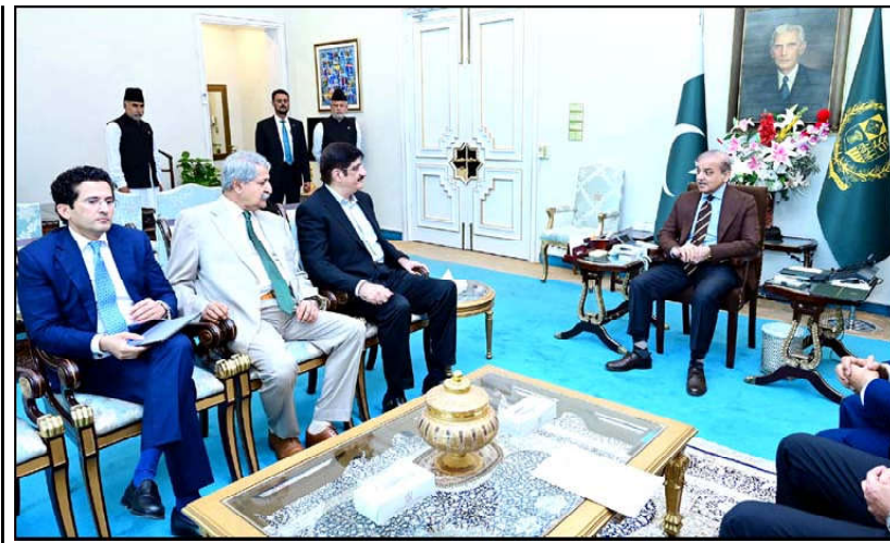
ISLAMABAD: Prime Minister, Muhammad Shehbaz Sharif exchanging views with Syed Murad Ali Shah, Sindh Chief Minister and Syed Naveed Qamar, Member of National Assembly (MNA) during meeting held in Islamabad.

The president congratulated the Secretary-General on his election as the 10th Secretary General of IMO and expressed confidence in his leadership to advance the organization's mission for a fair and effective regulatory framework for the global shipping industry.