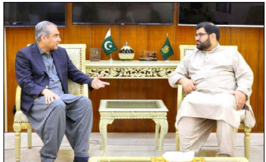
ISLAMABAD: Interior Minister Mohsin Naqvi in a meeting with President Awami National Party Senator Aimal Wali Khan.

The minister said that the IIEEP's contributions will undoubtedly strengthen our efforts to meet the nation's energy challenges and enhance industrial efficiency.