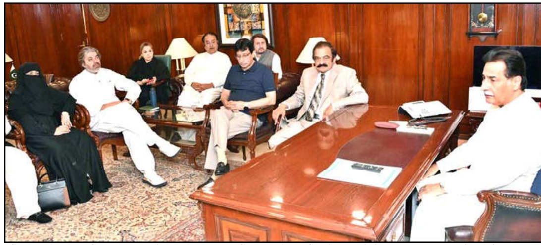
ISLAMABAD: Speaker National Assembly Sardar Ayaz Sadiq presiding over the meeting of Treasury & Opposition Members in National Assembly at Parliament House.

and provide justice to the common-man at gross-root level as well as behave with the common-man politely and safeguard the properties, lives and honour of the people without any discrimination. He said that in order to keep the writ of law and whatever you have learned in the training face the criminals as well as terrorists and safeguard the lives and properties of the people at gross root level. He also asked the Police officials that they should behave politely with the people and proved themselves as true Pakistanis and work for the solidarity and integrity of the country.