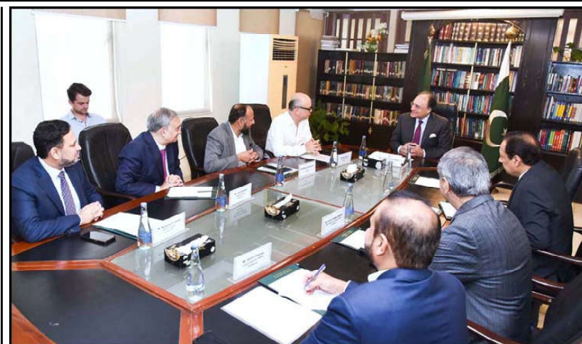
ISLAMABAD: Finance Minister Senator Muhammad Aurangzeb held a meeting with the K-Electric leadership to discuss energy sector reforms and renewable energy transition.

"We are trying to promote dairy and livestock financing through banks and the point of the Member is well noted," he said.