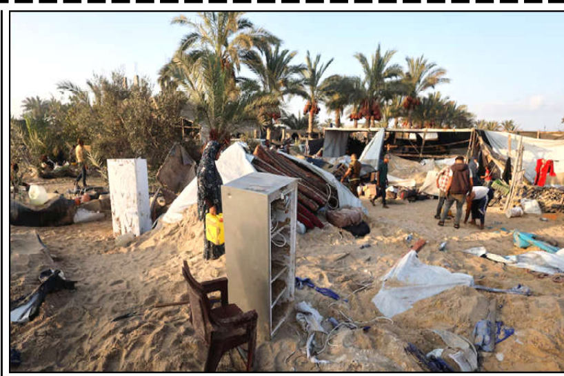
Palestinians inspect the site following Israeli strikes on a tent camp sheltering displaced people, amid the Israel-Hamas conflict, at the Al-Mawasi area in Khan Younis, in the southern Gaza Strip.

Israel's U.N. Ambassador Danny Danon reacted to Guterres' comments saying, "It is disappointing to see the U.N. advocate for a cease-fire without mentioning the hostages and without condemning Hamas."