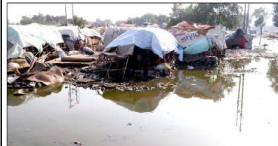
HYDERABAD: A view of Makrani para submerged with rain water after recent rainfall.