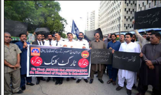
KARACHI: Members of Pakistan Punjabi Organization are holding protest demonstration against target killing of Punjabis in Balochistan, held at Karachi press club.

SUKKUR (APP): Sindh Rural Support Organization (SRSO) has installed 10 pit latrines at the Tent City in village Faiz Muhammad Samjeo, UC Dharkdo, taluka Shaheed Fazul Raho, district Badin on the request of the district administration and the SRSO-fostered Village Organization (VO). According to a release issued here on Tuesday, the Tent City was established by the administration to provide shelter and essential services to families affected by the recent rain-drain floods. The VO volunteers from Village Faiz Muhammad Samejo worked tirelessly to install the latrines, providing basic WASH (Water, Sanitation, and Hygiene) facilities to the temporarily displaced families.