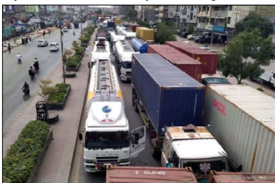
KARACHI: A large number of vehicles stuck in traffic jam during protest demonstration of residents of Punjab Colony against prolong electricity load shedding in their area, at Mai Kolachi Road in Karachi.

public can benefit from these schemes. He said that special care should be taken of the materials used in these development schemes. In this regard, no shortcoming will be tolerated. He said that these schemes are for the benefit of the public and they should be completed as soon as possible. During the visit, Deputy Commissioner Larkana was also briefed by officials about the schemes through maps. Officials of concerned departments were also present during the visit.