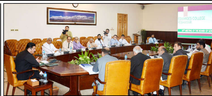
PESHAWAR: Governor Khyber Pakhtunkhwa Faisal Karim Kundi presides over the 14th BoGs meeting of Edwards College at Governor House.