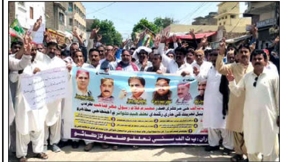
LARKANA: Members of Primary Teachers Association (PTA) are holding protest demonstration for acceptance of their demands held at Jinnah Bagh in Larkana.