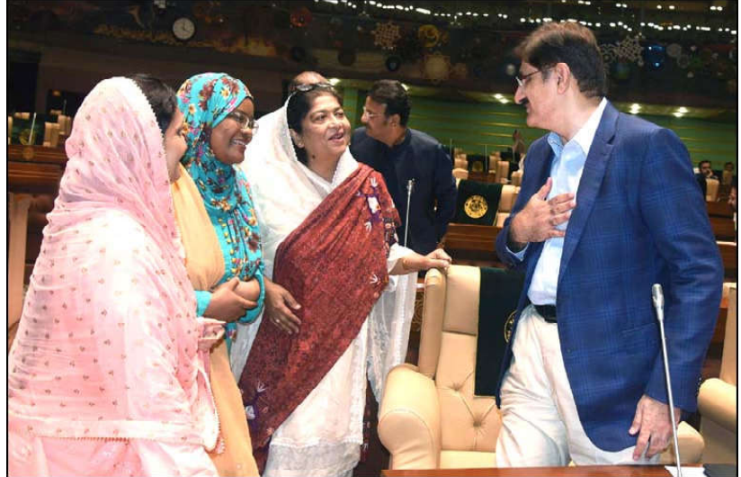
KARACHI: Sindh Chief Minister, Syed Murad Ali Shah honored women members of provincial assembly (MPAs) by standing from his seat during the assembly session, held at Sindh Assembly building in Karachi.

"We will take action on last night's incident and address it seriously," Sadiq said, adding that he had requested all video footage to identify the responsible parties.