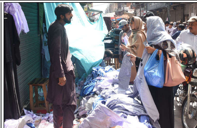
LAHORE: Women buying second-hand school uniforms from Anar Kali Bazaar in the provincial capital.

In closing, both leaders expressed optimism for the future, with Minister Jam Kamal reiterating his commitment to deepening the economic ties between the two nations.