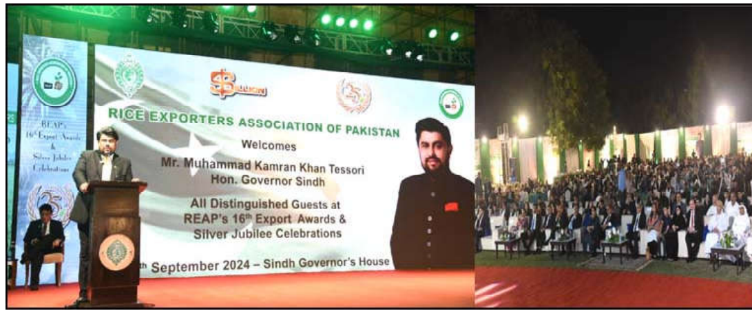
KARACHI: Sindh Governor Kamran Khan Tessori addressing Rice Exports Association of Pakistan's Export Award & Silver Jubilee celebrations at Governor House.

casions, Tarar expressed pride in being present at the memorial and praised the eternal services rendered by the Pakistan Navy for the country's defense. He highlighted the significance of Operation Dwarka, launched on September 7, 1965, and commended the bravery of Navy personnel who targeted enemy positions during the operation.