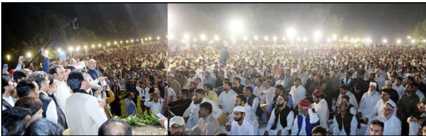
LAHORE: Governor Punjab Sardar Saleem Haider Khan addressing Milad Mustafa gathering organized in connection with Milad-ul-Nabi (SAW) at the Governor House.