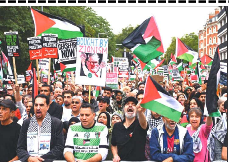
LONDON: People hold a Palestinian flag during a demonstration in support of Palestinians amid the ongoing conflict in Gaza.

some of which resounded loudly around the city centre, waking up its residents. Since the start of its invasion in February 2022, Moscow has launched thousands of missiles and Shahed drones into Ukraine. The Iranian-designed drone has been used by Russia since September 2022 as a cheap, more expendable alternative to missiles, which are expensive and harder to manufacture. The propeller-powered Shahed flies at less than 200 km per hour (125 miles per hour) but can be tricky for conventional air defence systems to track because it flies low and emits far less heat than a missile.