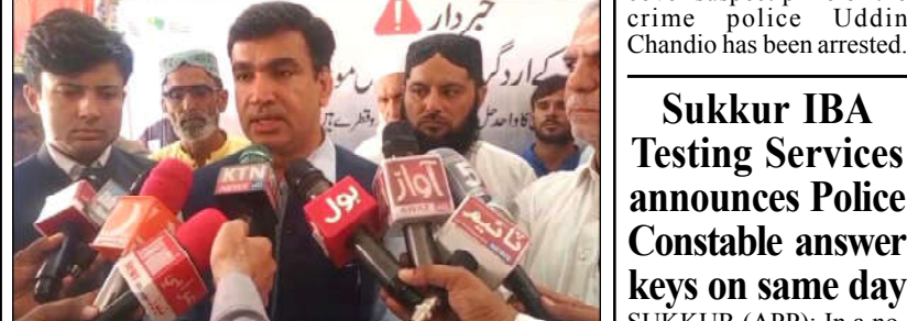
SUKKUR (APP): In a notable initiative to uphold merit and excellence, Sukkur IBA Testing Services (STS) has announced that the answer keys for the Police Constables test conducted on Sunday are available now for the candidates.

Parents are urged to cooperate with polio vaccination teams. The Commissioner said that parents should ensure their children get vaccinated on time to prevent the spread of the polio virus.