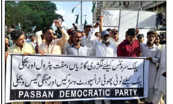
KARACHI: Activists of Pasban Democratic Party (PDP) are holding protest demonstration against massive unemployment, increasing price of daily use products, inflation price hiking and the highly inflated electricity bills, at Karachi press club.