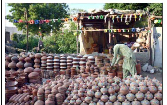
LAHORE: A vendor displaying clay-made items at roadside to attract the customers.

Credit Information Bureau (eCIB) to ensure applicants were not defaulters.