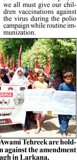
LARKANA: Activists of Awami Tehreek are holding protest demonstration against the amendment in IRSA Act, at Jinnah Bagh in Larkana.