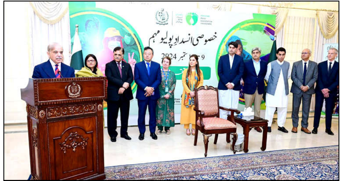
ISLAMABAD: Prime Minister Muhammad Shehbaz Sharif addressing the inaugural ceremony of countrywide Special Anti-Polio Campaign.

He further pledged that once polio is eliminated, the government will ensure it never returns, providing a safer future for generations to come.