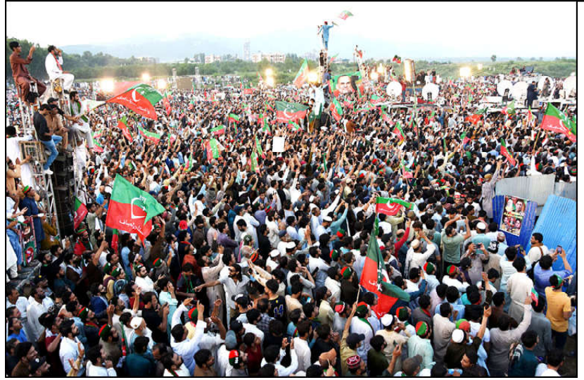
ISLAMABAD: Activists of Pakistan Tehreek-e-Insaf (PTI) party gathered in a ground during public gathering (Jalsa) at Sangjani in the Federal Capital.

contribute in non-CPEC projects and power sector for strengthening economic foundations between the two countries. Talking on the forthcoming C5 Nuclear Power Plant, he appreciated the ongoing negotiations between both the countries and assured complete support for execution of the project which will ultimately enhance nuclear power potential of Pakistan. He also thanked Chairman PAEC for ensuring foolproof safety and security for Chinese workforce.