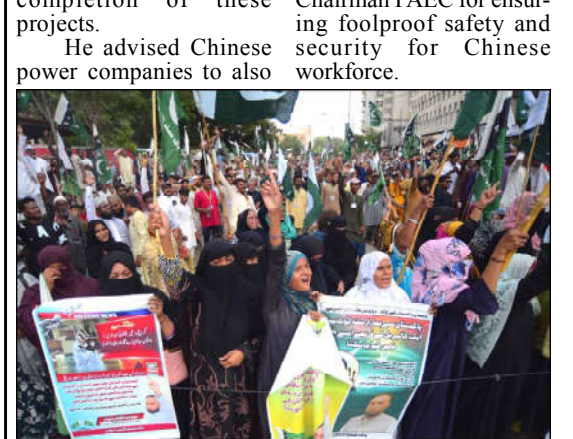
KARACHI: Members of Pak Muslim Alliance (PMA-Dewan) are holding protest demonstration over the derogatory statement against Bengalis and Biharis in the Sindh Assembly, at Karachi press club.