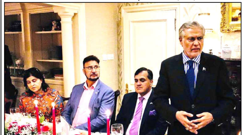
Senator Mohammad Ishaq Dar, Deputy Prime Minister/Foreign Minister interacts with British Parliamentarians of Pakistani origin in London.

Dar informed the audience that during the Pakistan Muslim League-Nawaz (PML-N) government from 2013 to 2017, terrorism was contained at an immense cost of blood and national exchequer.