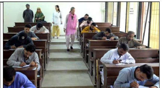
KARACHI: Students are busy in solving their questionnaire during the entry test for vacancies in Foreign Ministry organized by Karachi University Assessment and Testing Services, in Karachi.