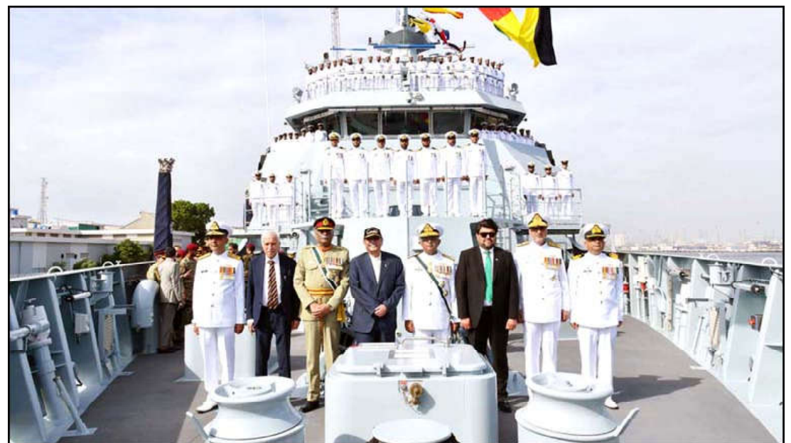
KARACHI: President Asif Ali Zardari in a group photo with senior military officials and crew of Pakistan Navy Ship Hunain during its induction ceremony.

He noted that these ships would enhance the operational readiness of the Navy to counter both conventional and asymmetric threats.