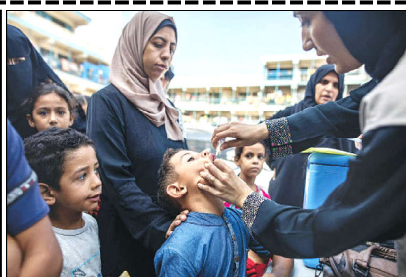
GAZASTRIP: A child receives vaccination drops at a makeshift camp in a school at Khan Yunis for people displaced by the Israeli aggression.