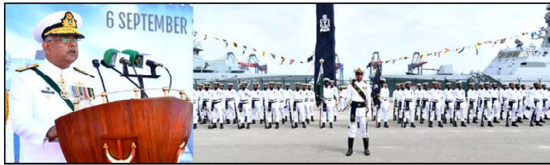
Chief of the Naval Staff Admiral Naveed Ashraf addressing the audience at the Induction Ceremony of PNS BABUR and PNS HUNAIN held at PN Dockyard, Karachi.

The Federal Minister said that the inclusion of Policy Board members will make the Planning Commission a complete think tank which will further improve the development process of Pakistan.