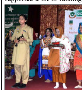
HYDERABAD: Girls students presenting tableau on Defence Day at Govt Shah Latif Girls College.