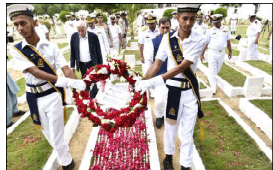
KARACHI: Federal Minister for Maritime Affairs Qaiser Ahmed Sheikh is arriving at Naval Cemetery to offer Fatcha.

They are providing free treatment for individuals who, due to financial constraints, could not receive it in their childhood. I have been informed that experienced doctors from the United States are conducting the surgeries."