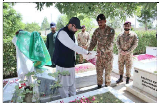
RAWALPINDI: Federal Minister for Overseas Pakistanis and Human Resource Development Chaudhry Salik Hussain visited Army Graveyard to pay tribute to the unwavering bravery and ultimate sacrifices of armed forces in Racecourse.