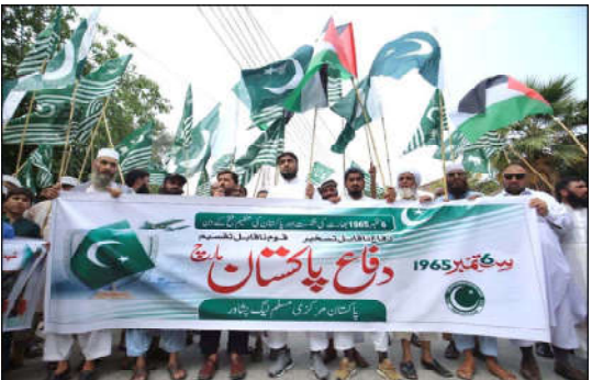
PESHAWAR: Pakistan Markazi Muslim League workers held a rally in connection with Pakistan Defence Day in front of the Press Club.