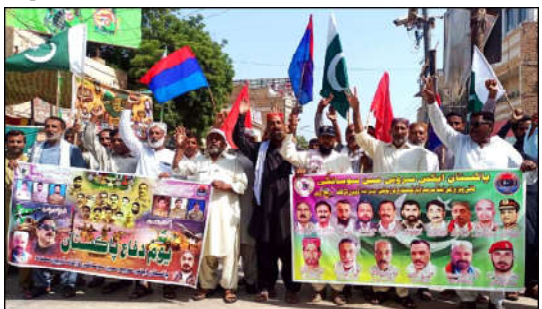
LARKANA: Members of Pakistan Ex-Servicemen Society (PESS) are holding rally to pay homage to the Ghazis and Shuhada of 06 September 1965 Indo-Pak War on the occasion of Defence Day of Pakistan at Jinnah Bagh in Larkana.

The assistant commissioners will use the new vehicle for their day-to-day office work.