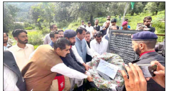
HAVELI KAHUTA: Federal Minister for Kashmir Affairs and Gilgit-Baltistan Engr. Amir Muqam laying floral wreath at the graves of martyred on the occasion of Pakistan Defence Day.