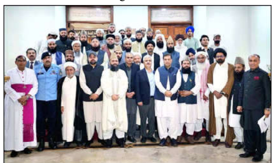
ISLAMABAD: Interior Minister Mohsin Naqvi and Federal Minister for Religious Affairs Chaudhry Salik Hussain in a group photo with a delegation of scholars and religious leaders.

Broad areas identified for improvement include: IPO pricing, public offering and listing conditions, role of consultant to the issue, IPO approval timelines and documentation requirements, disclosure requirements, digital and IPO outreach, public offering regime for GEM companies and post IPO matters. Suggested improvements are focused on both, supply and demand side. The supply side improvements are focused on enabling a conducive regulatory environment for businesses/issuers to raise funds in a smooth and cost-effective manner.