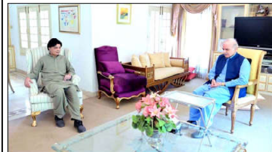
ISLAMABAD: Prime Minister Muhammad Shehbaz Sharif offering condolences to Chaudhary Nisar Ali Khan on the demise of his sister.

Paying rich tributes to the valiant sons of soil and brave heroes of Armed Forces who fearlessly fought, and defeated the enemy that attacked our motherland across the international border on 6 September 1965.