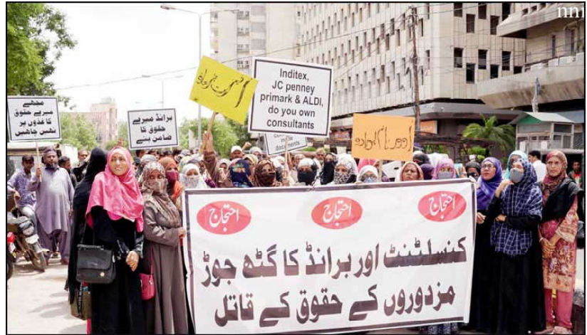
KARACHI: Contract Employees of All Karachi Textile Company protesting in favour of their demands at Karachi Press Club.