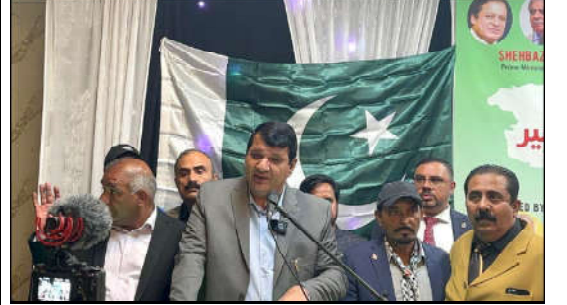
Federal Minister for Kashmir Affairs & Gilgit Baltistan and SAFRON, Engr. Amir Muqam addressing the Kashmiri diaspora in Toronto, Canada.

ment was creating opportunities to provide digital education to people, stressing the need for increasing literacy. "We will have to boost literacy by up to 90 percent in a bid to steer the country towards prosperity," he added. The minister announced the release of the district education index report. "Schools from 124 districts of the country have scored 53 percent. The prime minister has established a task force in connection with the educational emergency," he added.