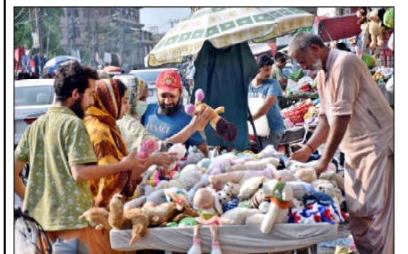
LAHORE: People selecting and purchasing second hand toys from roadside vendor in Provincial Capital.

To ensure a hassle-free experience for farmers, the authorities have implemented a smooth registration procedure for the Kissan Card.