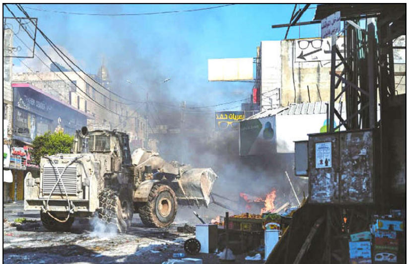
OCCUPIED WEST BANK: An Israeli bulldozer drives as a fire breaks out in a fruit market in the city of Jenin amid ongoing Israeli raids.