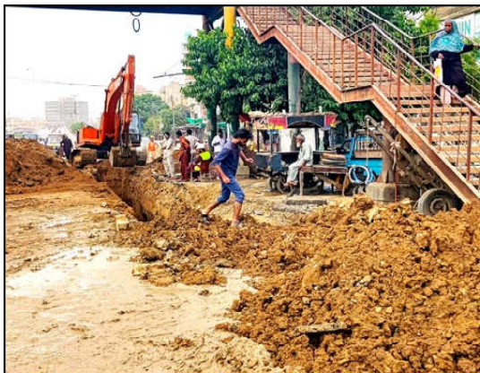
KARACHI: Labourers busy in digging for laying pipeline at Liaquatabad area.

Indian police personnel in the territory. During the period, the personnel of Indian army, police, paramilitary, Special Investigation Agency (SIA) and National Investigation Agency (NIA) arrested 96 civilians, mostly political activists, youth and students, during 186 cordon and search operations and house raids while several of them were booked under black laws.