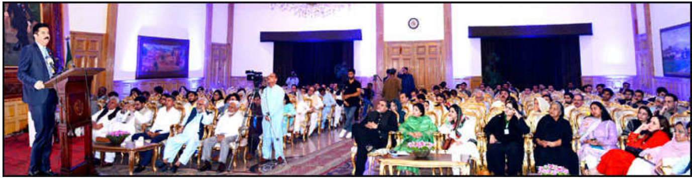
PESHAWAR: Khyber Pakhtunkhwa Governor Faisal Karim Kundi addressing National Dialogue session organized by Oxford Alumni Community of Pakistan in Governor House.

LAHORE (APP): At least nine people were killed and 1,346 others injured in 1,257 road accidents in Punjab during the last 24 hours. As many as 570 people with serious injuries were shifted to different hospitals, while 776 with minor injuries were treated at the incident site by the rescue medical teams. The data analysis showed that 694 drivers, 54 underage drivers, 161 pedestrians, and 500 passengers were among the victims of road traffic crashes.