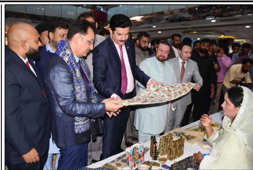
ISLAMABAD: Governor Khyber Pakhtunkhwa Faisal Karim Kundi visiting artisans at work exhibition in the Federal Capital.

He said we have taken various initiatives to further enhance our trade with Germany and German Trade Minister also visited Pakistan.