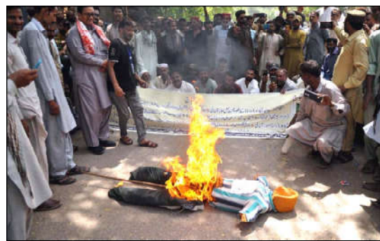
HYDERABAD: Members of HDA Labour Union are holding protest demonstration against non-payment of their salaries, at Hyderabad press club.