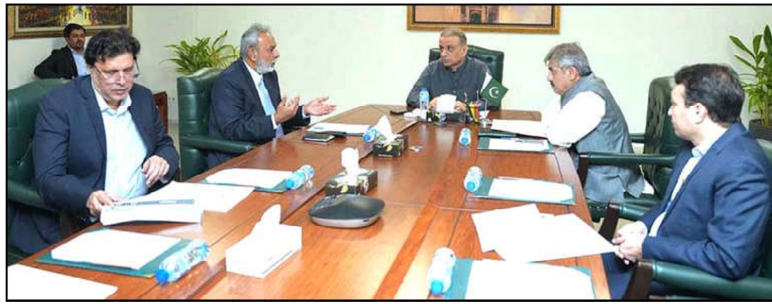
ISLAMABAD: Federal Minister for Communications, Privatization & Board of Investment Abdul Aleem Khan presides over high level meeting on NHA.