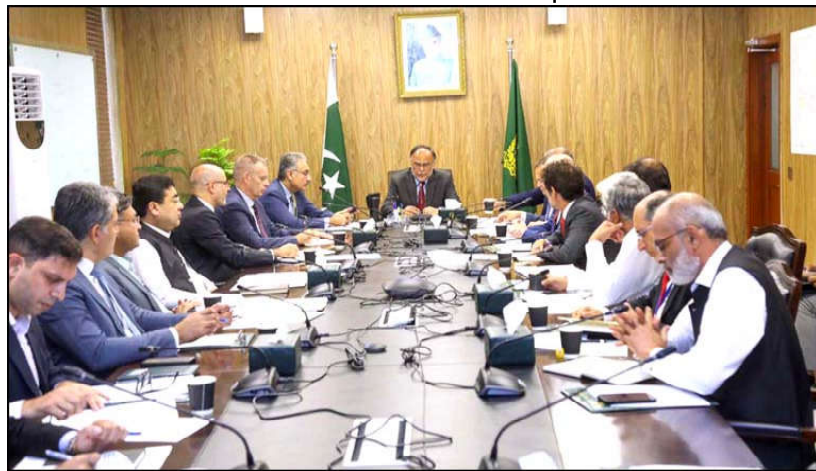
ISLAMABAD: Federal Minister for Planning, Development & Special Initiatives, Ahsan Iqbal, chairing the 4th meeting of the Policy and Strategy Committee (PSC) and the Oversight Board on Post-Flood Reconstruction Activities.

They also announced that a program for Eid Milad-un-Nabi (PBUH) will be organized at Bagh-e-Ibn Qasim, where scholars, reciters, and intellectuals from all sects, as well as a large number of citizens, will be invited. During the meeting ulema presented various suggestions regarding municipal issues and emphasized the immediate resolution of these problems.