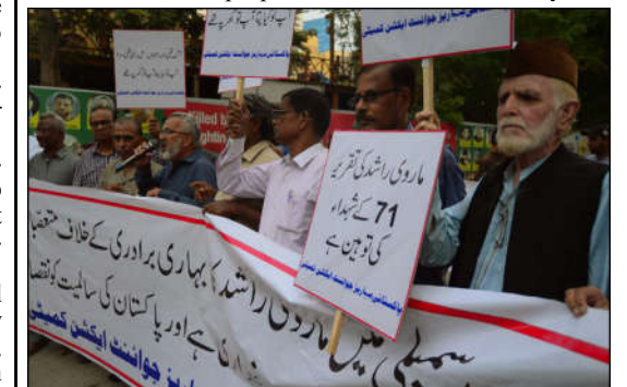
KARACHI: Members of Pakistan Biharis Joint Action Committee are holding protest demonstration for acceptance of their demands, at Karachi press club.