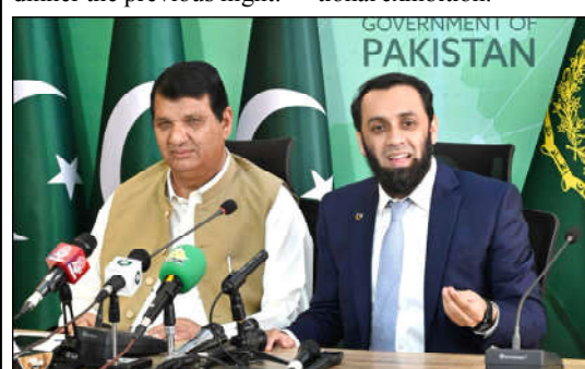
ISLAMABAD: Federal Minister for Information Ataulah Tarar along with Federal Minister for Kashmir Affairs and Saffron, Engineer Amir Maqam addresses important press conference at PTV Headquarters.

There are hundreds of schools in Sindh deprived of teachers.