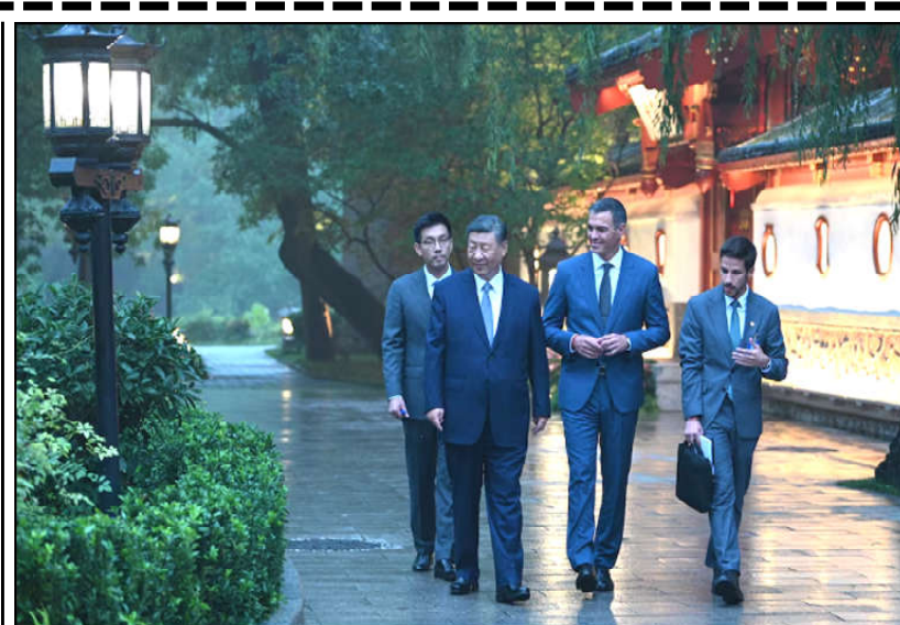
Spain's Prime Minister Pedro Sanchez and China's President Xi Jinping meet at Diaoyutai State Guesthouse in Beijing, China.

events Spain would work for a negotiated consensus to the EV dispute within the World Trade Organization and that a "trade war would benefit no one," a government source said. Spain in 2023 exported $1.5 billion worth of the pork products that China will investigate, Chinese customs data showed, dwarfing the outbound shipments from second- and third-ranking the Netherlands and Denmark. Spain also sold just under $50 million worth of targeted dairy products to China last year. But in a promising sign for Spain's pork producers, a separate source with direct access to Xi's meeting with Sanchez said the two leaders had "found harmony and understanding," when asked about possible curbs on Spain's outbound pork shipments.