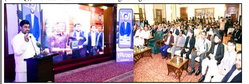
KARACHI: Governor Sindh Kamran Khan Tessori addressing inaugural ceremony of latest online application IVY.