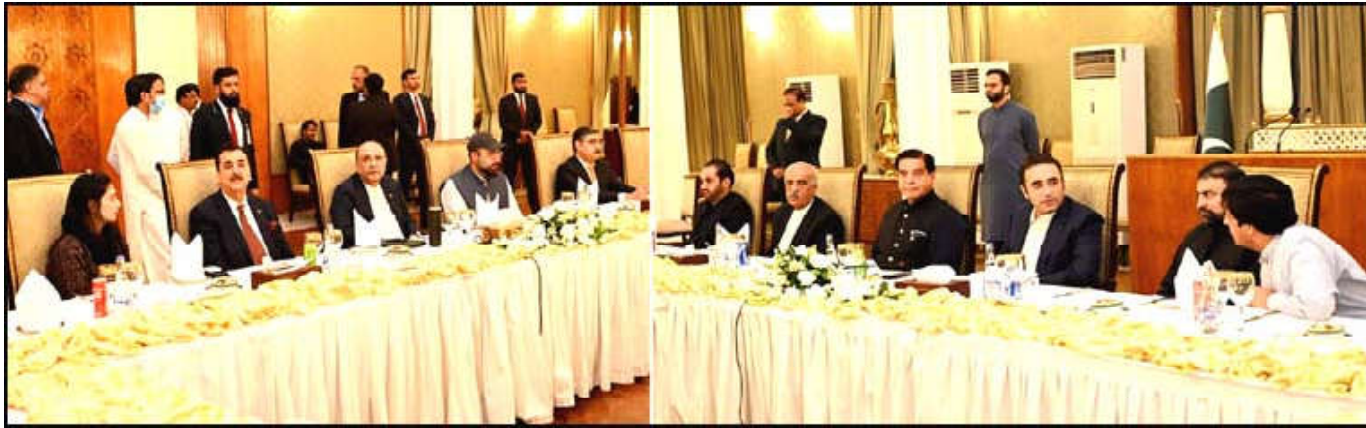
President Asif Ali Zardari hosted a dinner in honour of Parliamentarians belonging to Pakistan People's Party (PPP), Awami National Party (ANP), Pakistan Muslim League-Q (PMLQ), and Istehkaam-e-Pakistan Party (IPP), at Aiwan-e-Sadr.

Ph: 0300-3898091 Vol: 06. No. 201 Rabi-ul-Awwal 05, 1445 AH Tuesday September 10, 2024 Pages 04 Price Rs. 12.00