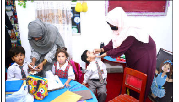
HYDERABAD: Lady Health workers administering polio drops to child student to kicks off nationwide Polio Eradication Programme 2024 at local private school.