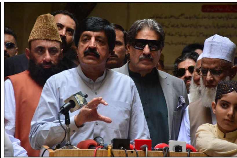
RAWALPINDI: Governor Punjab, Sardar Saleem Haider addressing to the media at Madrasa Taleem ul Qur'an Raja Bazar.

Salim reiterated his commitment to serving the people. Responding to a question, he said that the doors of Governor House are open for CM KPK. "I will ask Ali Amin Gandapur to refrain from spreading unrest", he said adding that politics couldn't be run by aggressive slogans. "Politics can't be run by raising Mola Jutt slogans", he said and asked the KPK CM to avoid irresponsible behavior. The governor condemned Gandapur's statement regarding journalists saying it an 'irresponsible' statement.