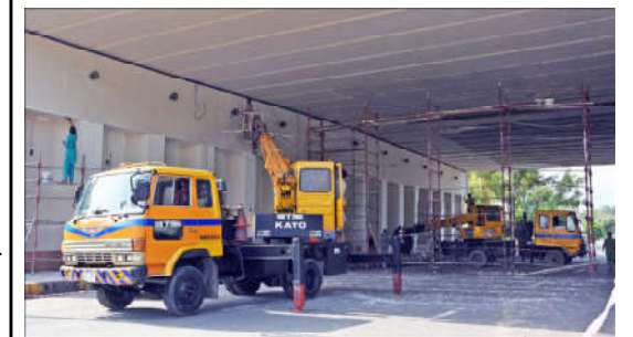
ISLAMABAD: Workers of Capital Development Authority (CDA) installing new colorful lights under zero point bridge, in the Federal Capital.