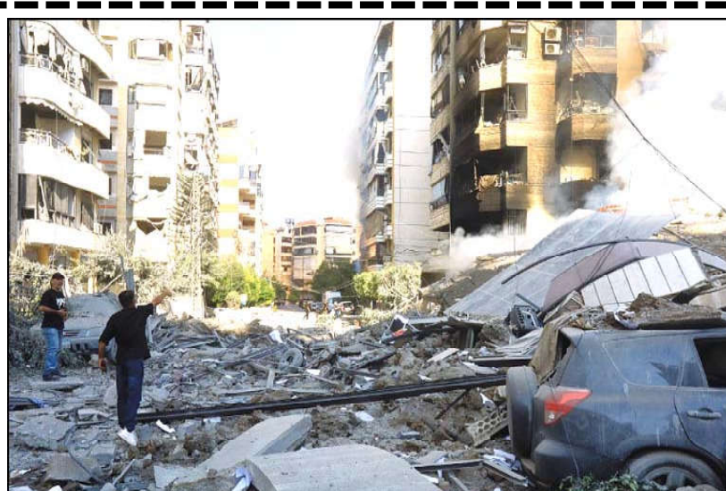
BEIRUT: People inspect the devastation in the Hadath district of the Lebanon capital's southern suburbs in the aftermath of intense Israeli air strikes.

boost his image as a powerful regional player by meeting with the Lebanese and Iraqi Prime Ministers on the sidelines of the UN General Assembly. But Ankara is increasingly finding itself sidelined as a regional diplomatic player. "Ankara's pro-Hamas approach has only marginalised Turkey in the international arena," said international relations expert Selin Nasi of the London School of Economics. "So we see Egypt and Qatar receiving credits for their roles as mediators. And Turkey is locked out of international diplomatic efforts." Since Hamas's 7 October attack on Israel and Israel's subsequent Gaza campaign, Ankara has tried to position itself among international mediating efforts to end the fighting, given its close contacts with Hamas. "Turkey was