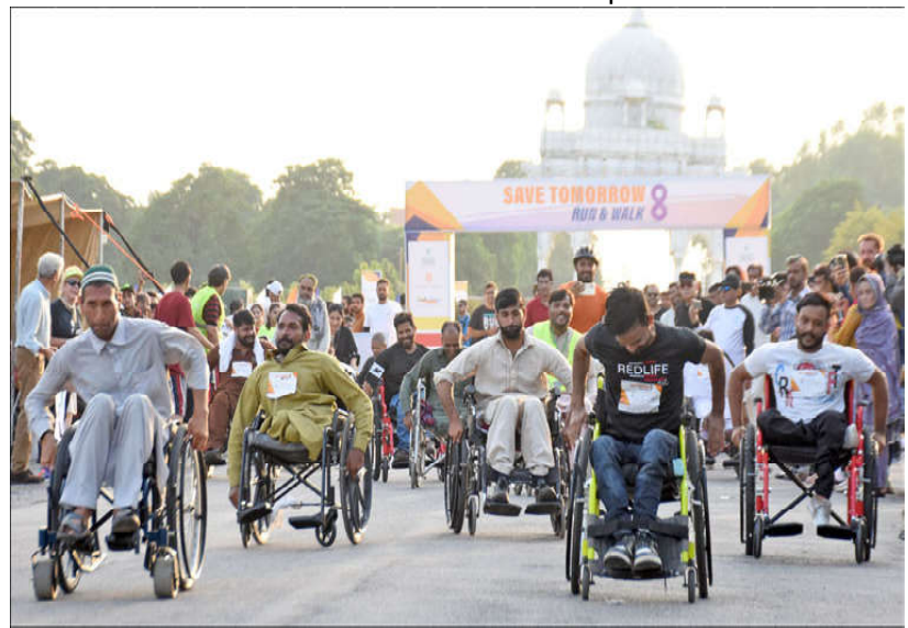
ISLAMABAD: Disable persons take part in race during a ceremony title 'Save Tomorrow 8 Run and Walk' at Fatima Jinnah Park, organized by KKAWF, in the Federal Capital.