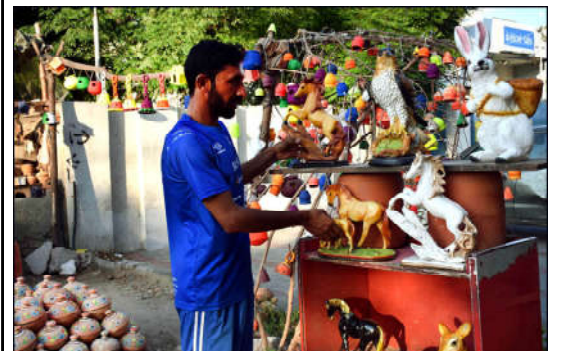
LAHORE: A vendor arranging and displaying the different kinds of clay made decoration items to attract the customers at his roadside setup.