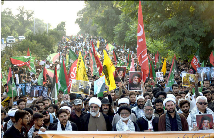
ISLAMABAD: Activists of Majlis Wahdat-e-Muslimeen carrying placards and Palestinian national flags stand beside a portrait of slain Lebanese Hezbollah chief Hassan Nasrallah, during an anti-Israel protest in the Federal Capital.

the doors of the Election Commission of Pakistan (ECP) and courts for promoting a peaceful and constitutional approach to resolving disputes, he stressed. Senator Irfan Siddiqui also praised Prime Minister Shehbaz Sharif's powerful speech at the 79th United Nations General Assembly (UNGA), where he addressed pressing global issues. PM Sharif's speech was notable for its emphasis on key issues such as Israel's military actions in Gaza, the unresolved Kashmir dispute, the global climate crisis and the international community's failure to uphold justice and human rights.