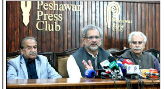
PESHAWAR: Former prime minister and Awami Pakistan Party leader, Shahid Khaqan Abbasi addresses to media persons during press conference held at Peshawar press club.