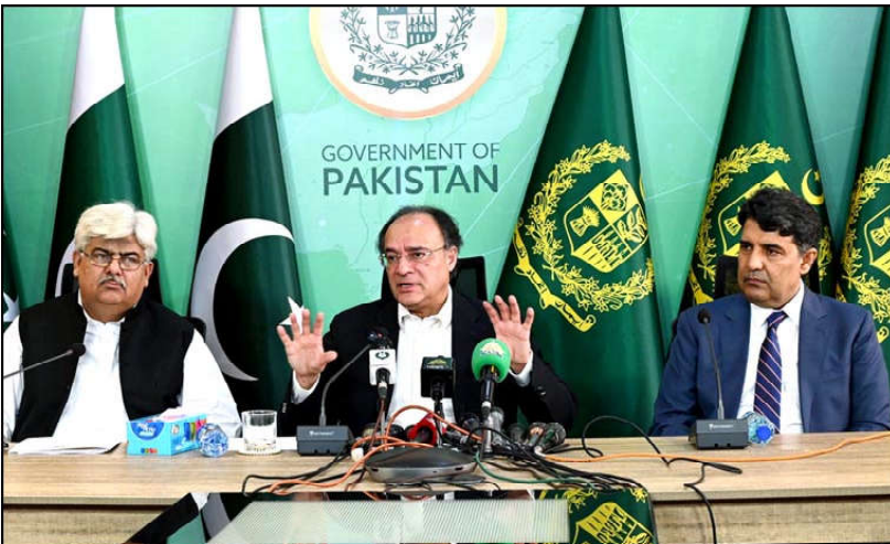
ISLAMABAD: Federal Minister for Finance and Revenue Senator Muhammad Aurangzeb addressing a press conference at PTV Headquarter.

the government's resolve to implementing homegrown structural reforms, Federal Minister for Finance and Revenue, Senator Muhammad Aurangzeb here on Sunday emphasized the crucial need to bring fundamental changes in the DNA of country's economy, leading to an export-driven model, thereby fostering sustainable growth. "We need to adopt new approach. If we are saying that this is going to be the last programme of IMF, we have just embarked on, we have to change the DNA of economy fundamentally," the minister said while addressing a press conference here. He was accompanied by Chairman Federal Board of Revenue, Rashid Mahmood Langrial. The Minister said, there were two main reasons for going to Interna-