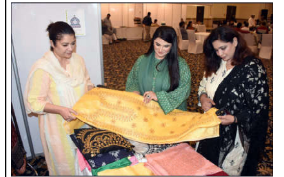
LAHORE: Women are busy buying clothes on a stall at a local hotel, in the Provincial Capital.

The gathering sought to address challenges in the tourism sector and explore avenues for exponential growth.