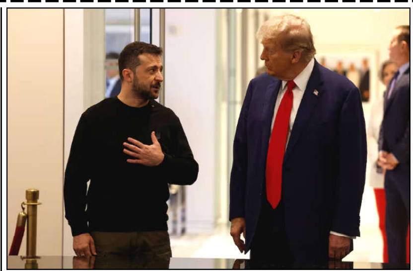
Republican presidential nominee and former U.S. President Donald Trump and Ukraine's President Volodymyr Zelenskiy meet at Trump Tower in New York City, U.S.

non-starter for Kyiv - Trump replied: "We'll see what happens." Still, Trump said on Friday he was pleased to meet with Zelenskiy, a marked change in tone from some of his previous comments on the campaign trail. On Monday, Trump said Zelenskiy wanted Harris to win the election. He has also called Zelenskiy "the greatest salesman of all time" because his country has received billions of dollars in military aid from the United States and Europe. "It's an honor to have the president with us, and he's been through a lot," Trump said on Friday. "He's been through a tremendous amount, like probably nobody else, almost nobody else in history, if you really get right down to it, and we're going to have a discussion and see what we could come up with."