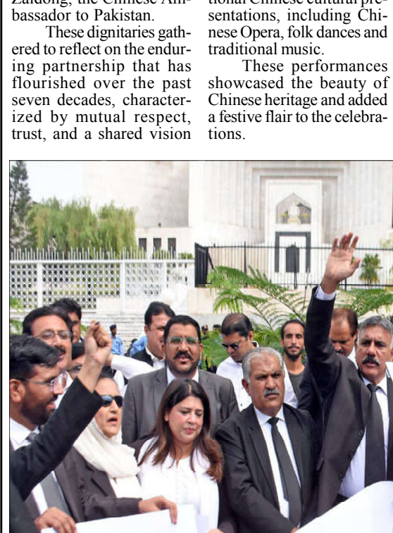
ISLAMABAD: Lawyers shouting slogans during protest in favor of their demands outside Supreme Court, in the Federal Capital.