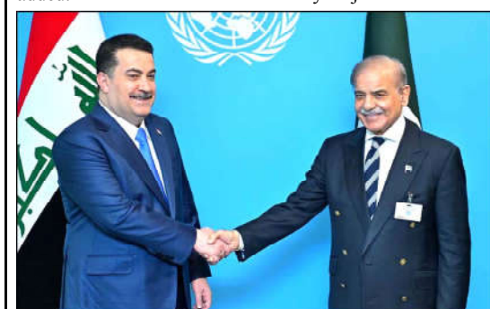
NEW YORK: Prime Minister Muhammad Shehbaz Sharif meets with Prime Minister of Iraq Mr. Mohammed Shia' Al Sudani on the sidelines of 79th session of the United Nations General Assembly.

The minister said the matter of ban on X was sub judice and the Ministry of Interior had already filed its reply in the court in that regard. "As Pakistanis we can request the management of X to remove anti-state content uploaded by the terrorists," he stressed. Terrorists, he added, were misusing social media platforms which was totally unjustified.