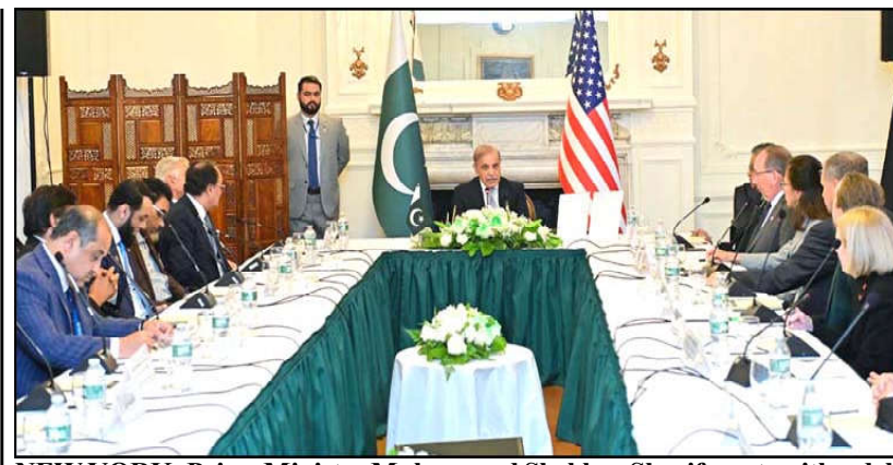
NEW YORK: Prime Minister Muhammad Shehbaz Sharif meets with a delegation of the US-Pakistan Business Council on the sidelines of 79th session of the United Nations General Assembly.