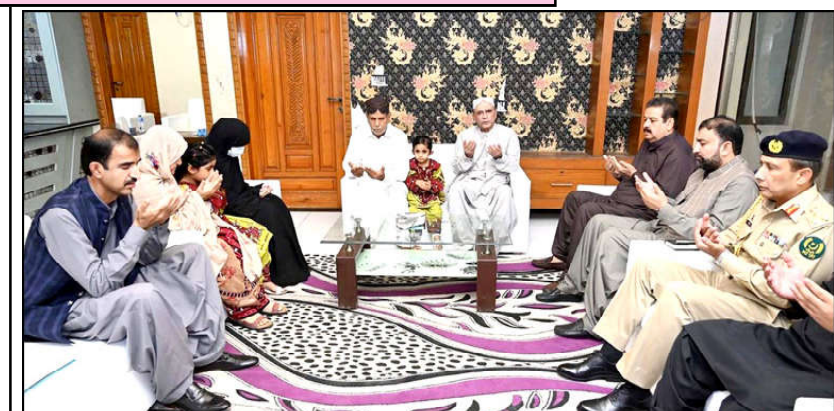
KARACHI: President Asif Ali Zardari offering condolences to the family members of Deputy Commissioner Zakir Baloch Shaheed. Chief Minister of Balochistan Mir Sarfaraz Ahmed Bugti is also present

He emphasized that China's success lies not only in its modernization but also in its preservation of a unique cultural identity.