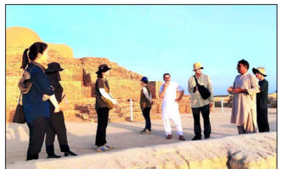
MOHENJO DARO: A tourist delegation from Korea are visiting and expressed keen interest in the historical ruins of the World Heritage Monuments of Mohenjo Daro.

LAHORE (APP): At least thirteen persons were killed and 1400 injured in 1334 Road Traffic Crashes (RTCs) in all 37 districts of Punjab during the last 24 hours. Out of these, 617 people with serious injuries were shifted to different hospitals, while 783 victims with minor injuries were treated at the incident site by Rescue Medical Teams thus reducing the burden of hospitals. Furthermore, the analysis showed those 783 drivers, 64 underage drivers, 140 pedestrians.