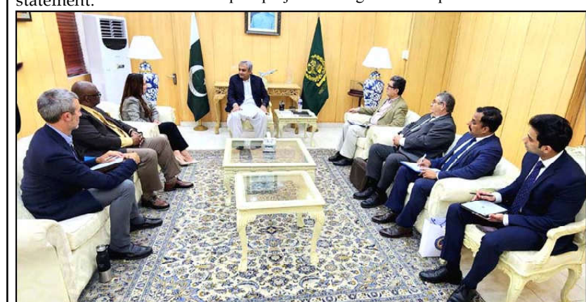
ISLAMABAD: Federal Minister for Interior Mohsin Naqvi in a meeting with the delegation of US Bureau of International Narcotics and Law Enforcement Affairs (INL).

Federal Interior Minister appreciated INL's exceptional cooperation in enhancing the capacity of Pakistan's police and paramilitary forces, citing several notable projects as praiseworthy. He emphasized for further strengthening this cooperation and making it more sustainable. He underscored the need for prioritizing high-impact projects through a master plan.