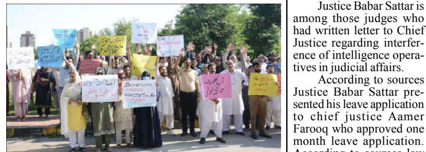
ISLAMABAD: Staff and members of educational institutions of Overseas Pakistani Foundation (OPF) are protesting outside NPC in favor of their demands.