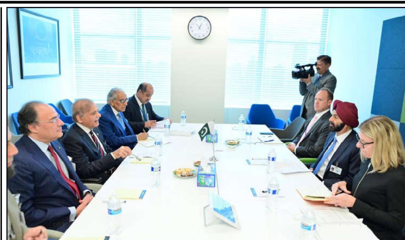
Prime Minister Muhammad Shehbaz Sharif meets Mr. Ajaypal Singh Banga, President of the World Bank on the sidelines of the UNGA in New York. Finance Minister, Muhammad Aurangzeb was also present in the meeting.

During the session, Minister Jam Kamal Khan asked council members to submit proposals for further review by the Executive Committee of Commerce, chaired by the Commerce Minister himself.