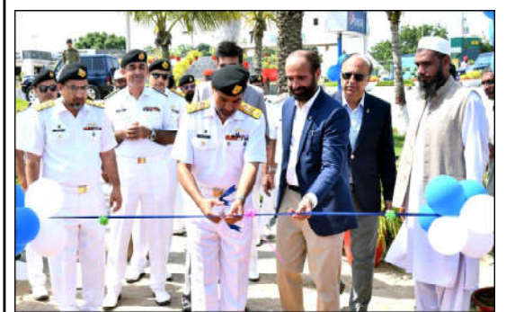
KARACHI: Commandant PNS BAHADUR inaugurating World Maritime Day Gala 2024 at Pakistan Maritime Museum.