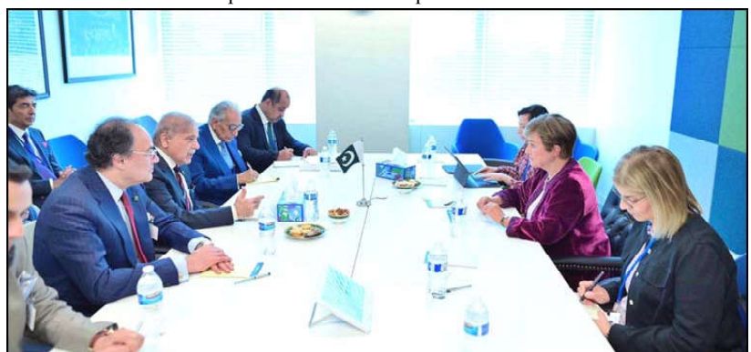
NEW YORK: Prime Minister Muhammad Shehbaz Sharif meets Ms. Kristalina Georgieva, the Managing Director of the International Monetary Fund (IMF) on the sidelines of the UNGA.