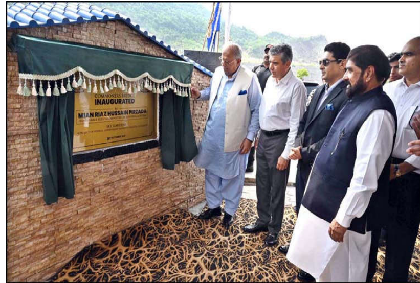
ISLAMABAD: Federal Minister of Housing & Works Mian Riaz Hussain Pirzada unveiling plaque to inaugurate Commoners Bridge at Sky Gardens a project of Federal Government Employees Housing Authority Murree Expressway.

During the visit, minister also inaugurated Commoners Bridge and planted a tree.