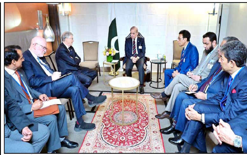
NEWYORK: Prime Minister Muhammad Shehbaz Sharif meets Mr. Bill Gates, founder and co-chair of the Bill & Melinda Gates Foundation (BMGF) on the sidelines of the 79th Session of the United Nations General Assembly.

He also shared with the Prime Minister BMGF's work on nutrition especially the micronutrients for pregnant women and how it can be increased by providing them additional vitamins in support of UNICEF. The prime minister complimented the Gates Foundation for its Polio campaign in Gaza given the challenges there and the plight of children. He emphasized on immediate ceasefire and the resolution of the conflict as per the UN Resolutions. He also complimented BMGF for being a trusted ally in Pakistan's socio-economic development and expressed interest in broadening collaboration in areas such as information technology, STEM education, agriculture, and livestock.