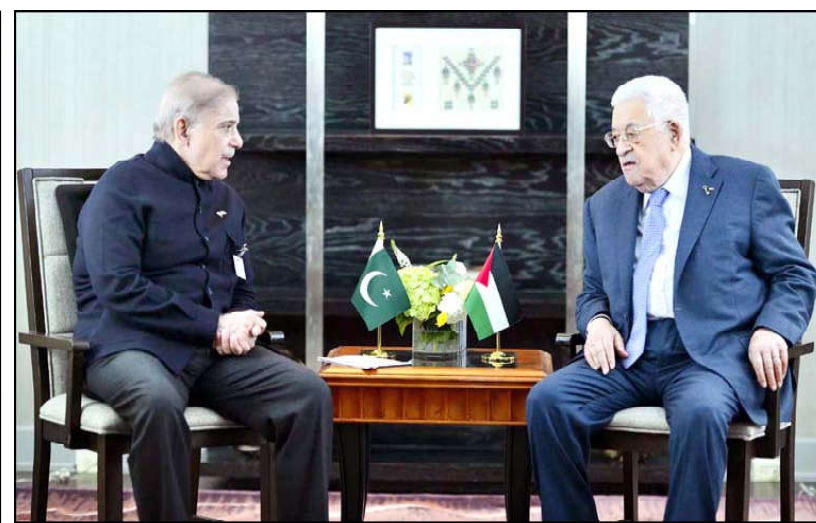
NEW YORK: Prime Minister Muhammad Shehbaz Sharif meeting with the President of the State of Palestine Mahmoud Abbas on the sidelines of the 79th session of the United Nations General Assembly.

He added that the Council should initiate building measures to prevent a war between major powers and ease the rising tension, especially in Asia. Additionally, the prime minister stressed that the Council must declare zero tolerance for the illegal use of force and revive global efforts to halt and reverse the new arms race in nuclear and conventional weapons. "It must also build control over new weapons and technologies including Artificial Intelligence that is making war more likely and more lethal." He said in cooperation with other member states, Pakistan would pursue these objectives in the Security Council after assuming its seat in the Council next year.