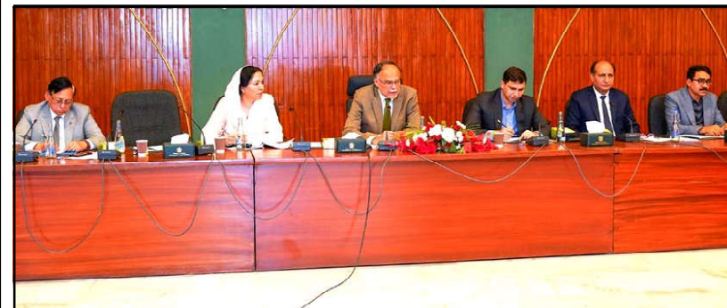
Federal Minister for Planning, Development, and Special Initiatives, Ahsan Iqbal chaired the meeting on the National Urban Planning Framework in Islamabad.