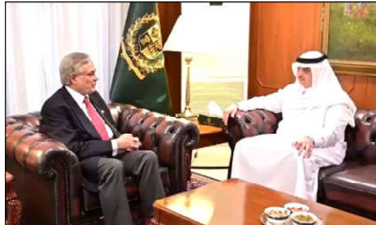
ISLAMABAD: Saudi Ambassador to Pakistan, Nawaf bin Saeed Ahmad Al-Malki meeting with Deputy Prime Minister and Foreign Minister Mohammad Ishaq Dar.

determine the exact nature of the blast. "The explosion has severely damaged the building, and rescue teams are on the ground," he stated. Rescue workers and fire brigade personnel quickly reached the scene, transferring the injured to nearby hospitals, including the Bacha Khan Medical Complex, where an emergency has been declared. A hospital spokesperson confirmed that eight injured have been admitted so far, with two in critical condition. "All necessary medical care is being provided, and the hospital administration is closely monitoring the situation," the spokesperson added.