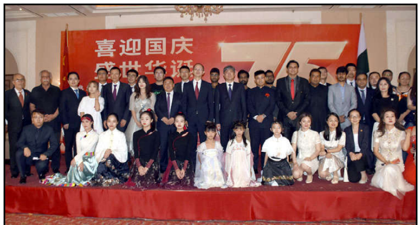
ISLAMABAD: Chinese Students group photo after a Performance During the 75th National Day of the People's Republic of China, Organized by the Overseas Chinese Association of Pakistan.

Deputy Prime Ministers of Nepal and Thailand also participated and addressed the Forum. This two-day Forum is hosted by the Minister of Transport of China, Li Xiaopeng who in his address expressed special thanks to Pakistan and assured further increase in the development of mutual cooperation and bilateral relations in all fields.