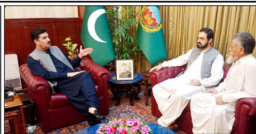
PESHAWAR: Governor Khyber Pakhtunkhwa Faisal Karim Kundi called on by MPA Sardar Ehsan Ullah Khan Mainkhel at Governor House.

Out of them, 578 people with serious injuries were shifted to different hospitals, while 825 victims with minor injuries were treated on the spot by Rescue Medical Teams.