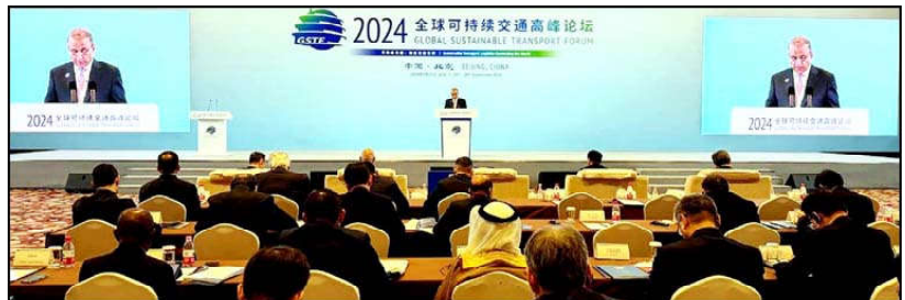
BEIJING: Federal Minister for Communications, Abdul Aleem Khan addressing during the opening session of Global Transport Forum 2024, in Beijing.

He issued directions to police officials and crime control teams to prevent incidents of robbery, dacoity, and theft in their jurisdiction. Under the supervision of the SHOs, these teams will work to arrest absconders, proclaimed offenders, target offenders, missing gang members and other criminals. The special teams will also take effective action to prevent incidents of robbery, dacoity, and theft. He said that the progress of the crime control teams will be reviewed daily. All police officers are expected to be more effective in combating criminal elements.