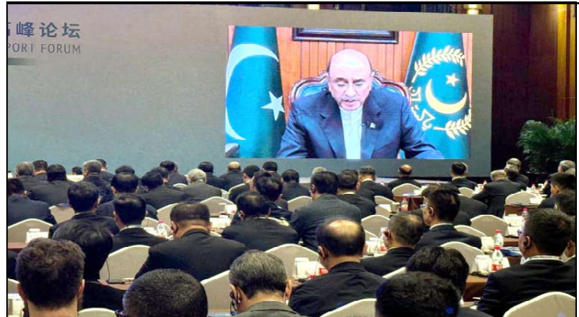
ISLAMABAD: President Asif Ali Zardari addressing the Global Sustainable Transport Forum-2024, through a video message, in Beijing China.

Secretary General Guterres thanked the prime minister for Pakistan's active engagement at the United Nations as well as for its role towards international peace and security in the form of its UN's peacekeeping force.