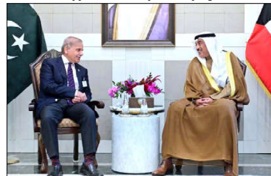
NEW YORK: Prime Minister Muhammad Shehbaz Sharif held a meeting with the Crown Prince of Kuwait His Highness Sheikh Sabah Al-Khaled Al-Hamad Al-Mubarak Al-Sabah on the sidelines of the 79th United Nations General Assembly Session.

Those Pakistanis, who could not leave Lebanon owing to some specific reasons, should exercise extreme caution and relocate to safe areas, he added.