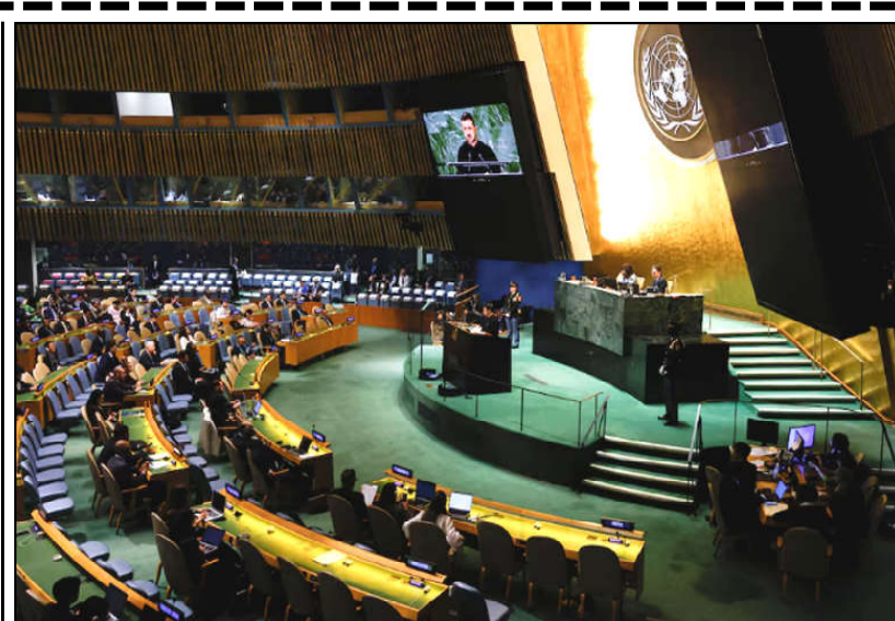
Ukraine's President Volodymyr Zelenskyy addresses the 79th United Nations General Assembly at U.N. headquarters in New York, U.S.

Trudeau, whose popularity has slumped amid unhappiness over rising prices and a housing crisis, became more politically vulnerable this month when the smaller New Democratic Party tore up a 2022 deal to keep him in power until the 2025 election.