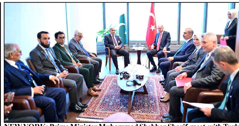
NEW YORK: Prime Minister Muhammad Shehbaz Sharif meet with Turkish President Recep Tayyip Erdogan on the sidelines of the 79th United Nations General Assembly Session.

In this regard, he profusely thanked China, Saudi Arabia and the UAE, saying without their support this would not have been possible. The premier said his government had accepted the economic challenge to the country and now, with collective efforts of the government and all institutions,