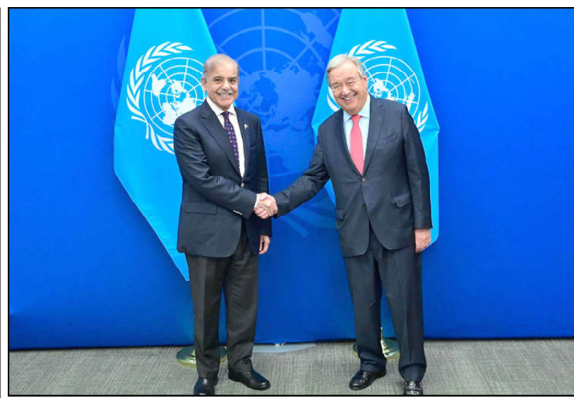
NEW YORK: Prime Minister Muhammad Shehbaz Sharif meets with Secretary General of the United Nations Antonio Guterres on the sidelines of 79th session of United Nations General Assembly.

The prime minister thanked all the provincial governments, especially Punjab Chief Minister Maryam Nawaz, Sindh CM Syed Murad Ali Shah and Balochistan CM Sarfaraz Bugti.