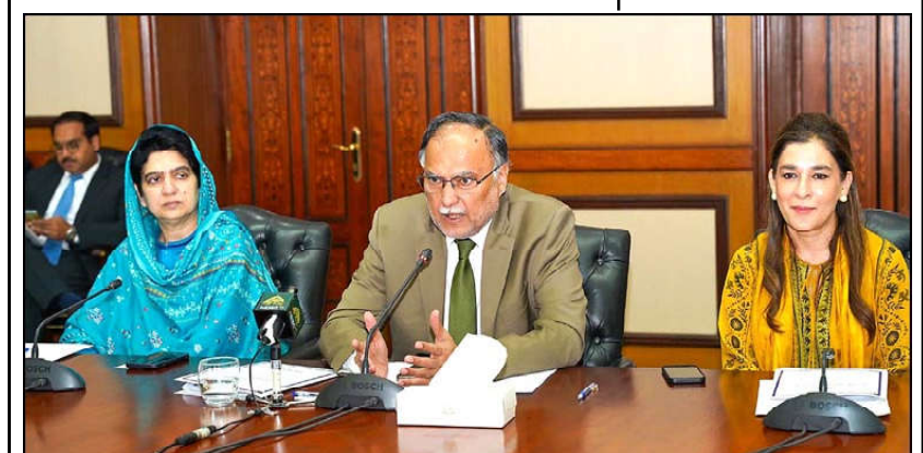
ISLAMABAD: Federal Minister for Planning, Development, and Special Initiatives, Ahsan Iqbal chaired the inaugural meeting of the Education Task Force.