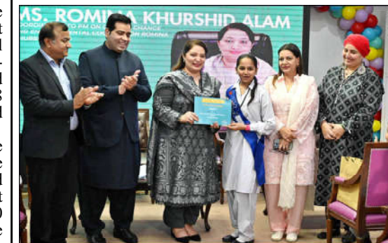
LAHORE: Coordinator to the Prime Minister on Climate Change, Romina Khurshid Alam, distributing certificates to students at the COP29 Simulation Program held at Aiwan-e-Iqbal.

For the people of the Merged Areas, especially the youth, hope is what drives progress.