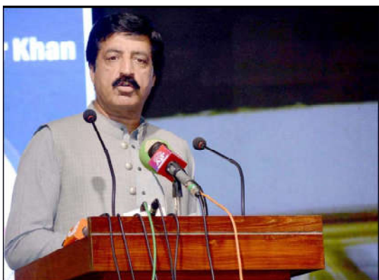
FAISALABAD: Governor Punjab Sardar Saleem Haider Khan addresses during annual prize distribution ceremony of Aziz Fatima Medical & Dental College at a local hotel.

She said that the previous rulers abused the young generation for their ulterior motives. They raised hollow slogans but never provided employment opportunities to the youth on merit. She said, "We have planned the biggest internship programme for the agriculture graduates with a monthly stipend of Rs. 60,000 per intern. These graduates were appointed purely on merit and their stipend would be enhanced gradually."