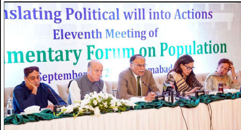
ISLAMABAD: Federal Minister for Planning, Development, and Special Initiatives, Ahsan Iqbal addressing as the chief guest during the 11th Parliamentary Forum on Population, in Islamabad.

The petition has mentioned Ministry of Health and President Pakistan Medical, Dental Council (PM&DC), Vice Chancellor Shaheed Zulfikar Ali Bhutto University and chairman National Medical and Dental Board as respondents in the case. The petitioners said that the MDCAT took place in capital on September 22, in which 26, 27 MCQs out of 200 were out of Syllabus.