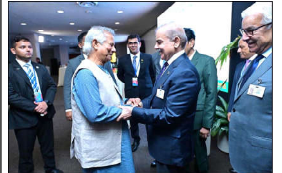
NEW YORK: Chief Advisor (Head of Government) of the Interim Government of Bangladesh Dr. Muhammad Yunus receives Prime Minister Muhammad Shehbaz Sharif at the reception to commemorate 50th Anniversary of Bangladesh's membership in the United Nations.