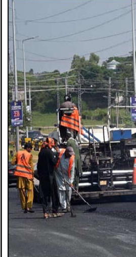
ISLAMABAD: Labourers busy in road construction with the help of heavy machinery during development work near Faizabad.

of road users, use of overhead bridges, use of zebra crossings and other traffic rules. Islamabad Police education wing delivered a lecture to participants about road safety and traffic rules and said that children would take charge of important responsibilities in the future and it is our duty to educate students about road safety and traffic rules. They further added that the Islamabad Police is fulfilling its duty well and has taken special measures.