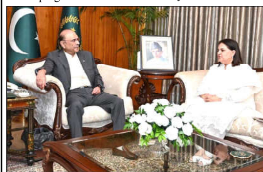
ISLAMABAD: The Chairperson Benazir Income Support Program (BISP), Robina Khalid, called on the President Asif Ali Zardari, at Aiwan-e-Sadr.

The minister highlighted that Pakistan's economic trajectory has continued from the last fiscal year into the first quarter of this fiscal year, with notable improvements in various economic indicators. He said the currency was stable while foreign exchange reserves were also stable with two months import cover. He said the inflation has decelerated and more importantly, policy rate has come down and Kibor rates also declined to the benefit of industry.