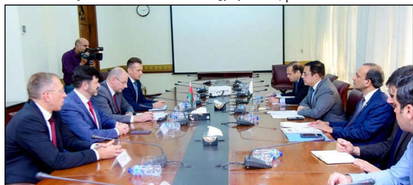
ISLAMABAD: Belarusian delegation headed by Minister for Energy Aleksei Kushnarenko is meeting with the delegation of Ministry of Economic Affairs under the leadership of Minister Ahad Cheema.

To a question, the official said that Khushal Khan Khattak Express was discontinued in March 2020 owing to COVID-19.