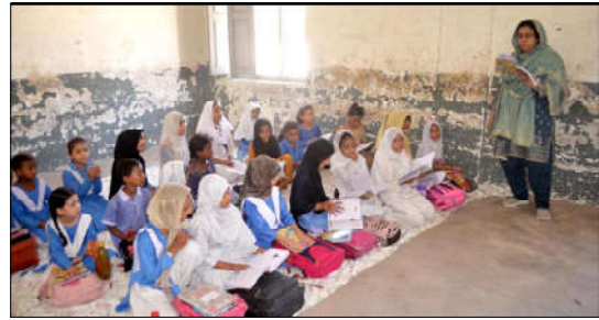
HYDERABAD: Student of Government Girls Urdu Primary School Hali road studying on the floor due to furniture not available.