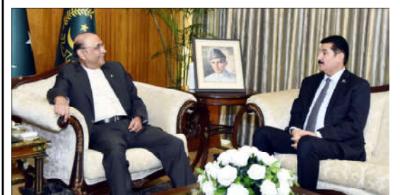
ISLAMABAD: Khyber Pakhtunkhwa Governor Faisal Karim Kundi meeting with President Asif Ali Zardari at Aiwan-e-Sadr.

He stressed the need for a more efficient and modernized approach to project planning and approval processes. "When approving new projects, their practical implications and expected outcomes must be thoroughly assessed. Ministries need to move beyond mere project initiation and focus on successful completion," he added.