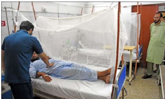
ISLAMABAD: Patients being treated in the special dengue ward of the Polyclinic Hospital in the Federal Capital.

Senator Bilal Ahmed raised concerns that the involvement of consultants and contractors could lead to fraud and urged the need for clearly specified authorizations. It was revealed that approximately 90% of buildings do not conform to approved structures. The committee highlighted that while the Building Code of Pakistan 2022 provides a framework for safe, sustainable, and environmentally responsible construction, it lacks the authority to approve building plans or monitor construction; these powers rest with local departments.