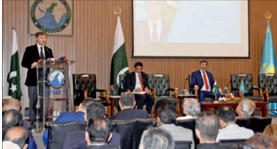
ISLAMABAD: Ambassador of Kazakhstan to Pakistan Yezhan Kistafin addressing during a conference titled "Rising Kazakhstan agenda for building regional cooperation" organized by Embassy of Kazakhstan at Institute of Regional Studies, in the Federal Capital

The project includes a research centre for the digital documentation of Buddhist heritage sites and a conservation laboratory for the treatment of museum artefacts.