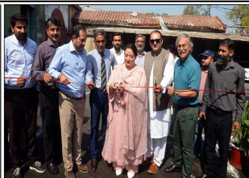
RAWALPINDI: Coordinator to Prime Minister on Climate Change, Romina Khurshid Alam inaugurating a solar energy project of a beverage company.

The minister highlighted the tremendous op