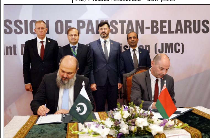
ISLAMABAD: Federal Minister for Commerce Jam Kamal Khan and Belarusian Minister of Energy Aleksei Kuchnarenko co-chair the 7th Joint Ministerial Commission, signing the Protocol and MoUs between the two countries.

Power Producer owners have also been warned of forensic audit if they continue to go with the present PPAs, the sources said.