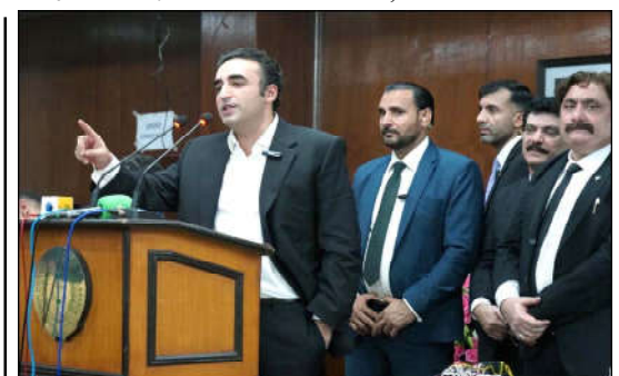
KARACHI: Peoples Party (PPP) Chairman, Bilawal Bhutto Zardari addresses to lawyers during ceremony organized by Sindh High Court Bar Association, held in Karachi.

The two sides also recognized the shared responsibility of South Asian nations to work together for peace, prosperity, and stability of the region.