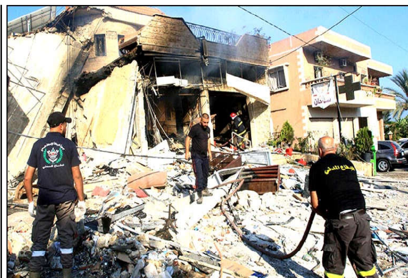
Rescuers inspect the debris at the site of an overnight Israeli strike on a pharmacy in the southern Lebanese village of Akbiyeh.

He said that "innocent civilians" in the blockaded Palestinian enclave were "going through hell," adding that now was the time for Israel and Hamas to agree to a cease-fire and hostage deal. The deal would "bring the hostages home and secure security for Israel" and ease the suffering in Gaza and end this war.