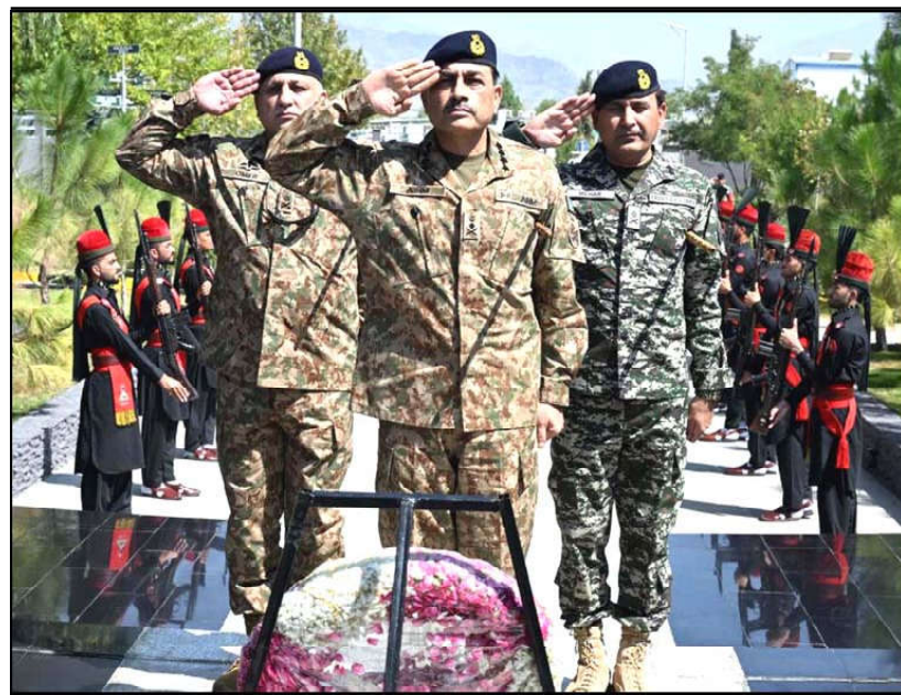
SOUTH WAZIRISTAN: Chief of Army Staff (COAS), General Asim Munir laying floral wreath at the Shuhada Monument during his visit to Wana in South Waziristan.