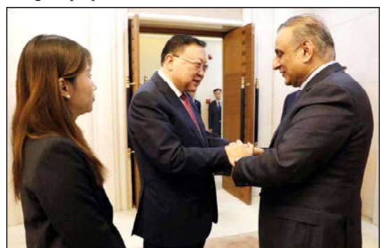
Federal Minister for Communications, Abdul Aleem Khan being received by Chinese Transport Minister Li Xiapeng in Beijing.

Palestinians was being committed and the world should take notice and bring the perpetrator Israel