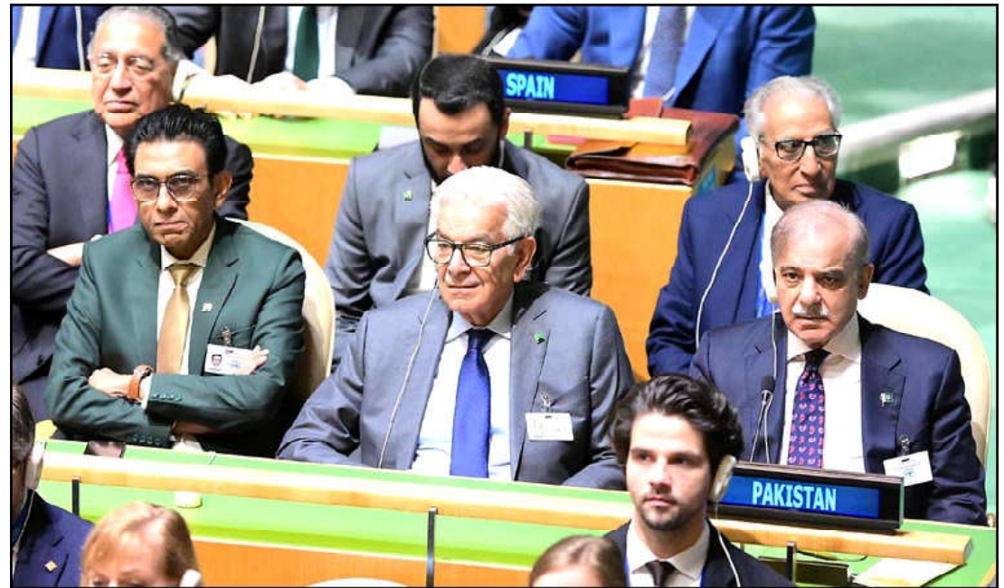
NEW YORK: Prime Minister Muhammad Shehbaz Sharif attending the inaugural session of United Nations General Assembly, New York.

Upon arrival, the COAS honoured the martyred by laying wreath at the Shuhada Monument. The COAS was warmly received at Wana by Commander Peshawar Corps.