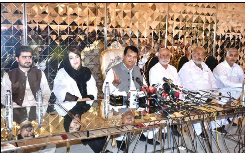
PESHAWAR: Federal Minister for Kashmir Affairs, GB, SAFRON and President PML-N Khyber Pakhtunkhwa Engr. Amir Muqam addressing a press conference.

The prime minister paid tribute to the visionary leadership of King Salman bin Abdul Aziz who steadfastly guided the KSA towards progress and prosperity while upholding the sacred responsibility of the custodian of the Two Holy Mosques. "We also highly commend the sagacious and farsighted vision of Mohammad bin Salman whose initiatives have positioned Saudi Arabia as a beacon of modernity, innovation and economic growth." He said the KSA with its vision 2030 and the theme "We Dream We Achieve" under the dynamic leadership of King Salman bin Abdul Aziz and Prince Mohammed bin Salman was assuming a global leadership role.