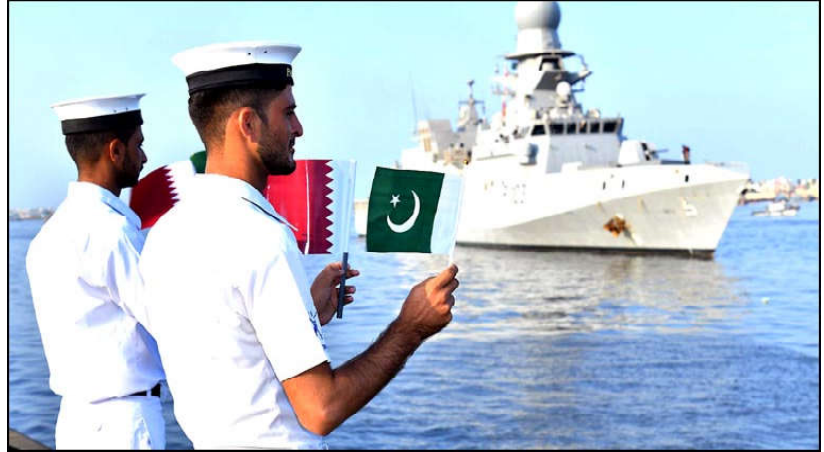
KARACHI: Warmly welcomed by Pakistan Navy officers and sailors upon arrival of Qatar Emiri Naval Forces Ship (QENS) ALKHOR visited Karachi for exercise ASAD ALBHAR-111.

Engr Amir Muqam referred to the recent IED blast in Malam Jabba Swat district that resulted in the death of one policeman and injuries to four others.