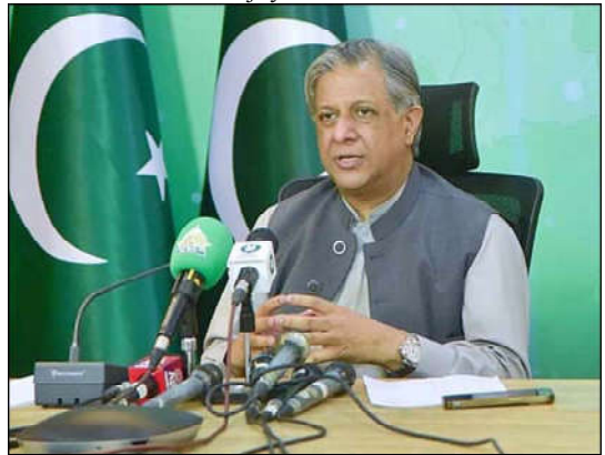
ISLAMABAD: Federal Minister for Law and Justice Senator Azam Nazeer Tarar addressing an important press conference.

Lieutenant General Asim is also a graduate of Fort Leavenworth and Royal College of Defence Studies and has also served in the Military Operations Directorate before his current assignment.