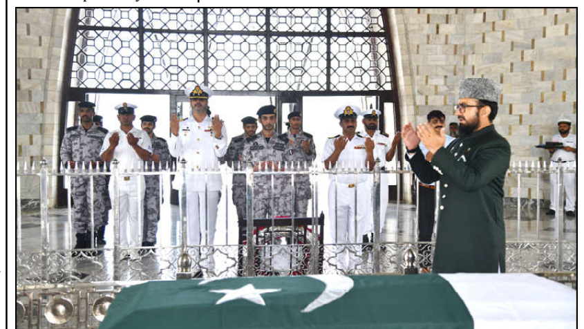
Qatar Emiri Naval Forces delegation offering Fateha at Mazar-e-Quaid during visit to Karachi.

The meeting was attended by officers of Punjab Land Revenue Authority who briefed the deputy commissioner on Online Registration System.