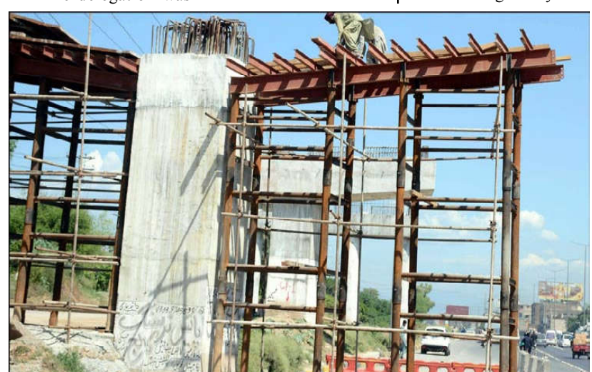
ISLAMABAD: Labourer busy in construction work of bridge at IJP Road during development work in the Federal Capital