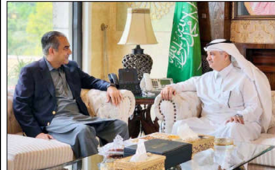
ISLAMABAD: Federal Minister for Interior Mohsin Naqvi in a meeting with Ambassador of Saudi Arabia Nawaf bin Said Ahmed Al-Maliki.

Also in attendance were Federal Minister Ahsan Iqbal and Senior Punjab Minister Marriyum Aurangzeb.