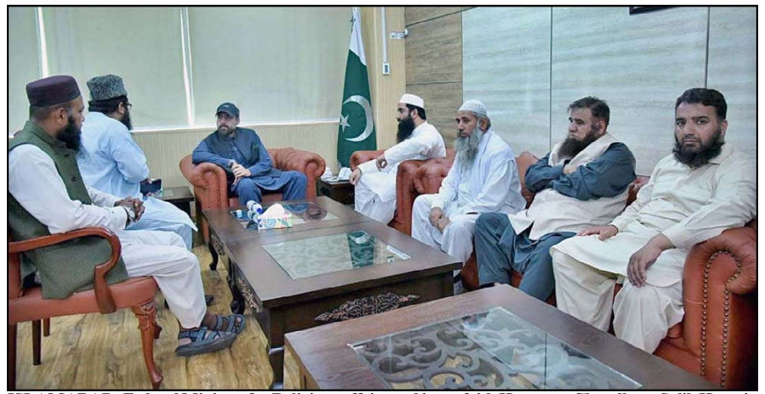
ISLAMABAD: Federal Minister for Religious affairs and inter-faith Harmony Chaudhry Salik Hussain meeting with religious scholars.

He remarked, "Anyone or any group that takes up arms against the state is a terrorist, and we must unite as a nation to eradicate the scourge of terrorism."