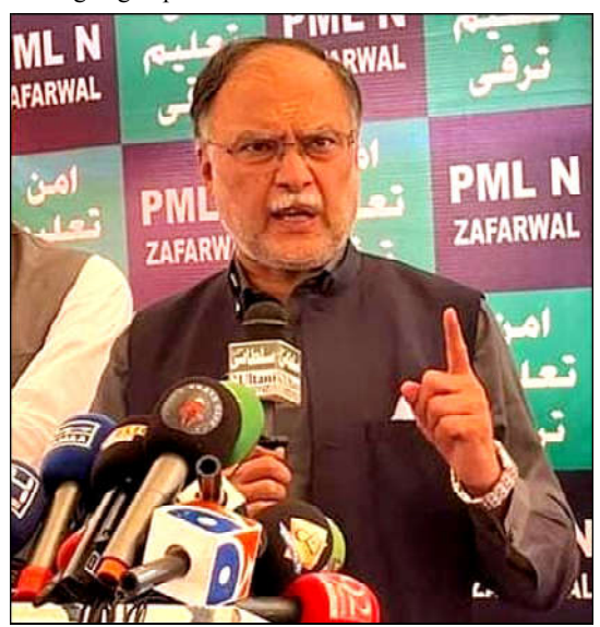
NAROWAL: Federal Minister for Planning and Development Ahsan Iqbal talking to media persons.

Independent Report KARACHI: Jamaat-e-Islami (JI) Pakistan Ameer Engr Hafiz Naeemur Rehman has shed light on virtually dissected anatomy of the ruling elite in the country, in the most ruthless way possible and said that the rulers only believe in unity among themselves in order to safeguard their interests. The JI supreme leader expressed these views while addressing a session at the Karachi Expo Center, here on Sunday, while he was delivering a lecture at the two-day biannual countrywide central convention held by the Pakistan Islamic Medical Association (PIMA). Speaking on the occasion, he said that the ruling elite was a class that doesn't believe in cast, creed or color but their mutual interests. He further said that every society has its own boiling point and it seems that the days of ruling elites