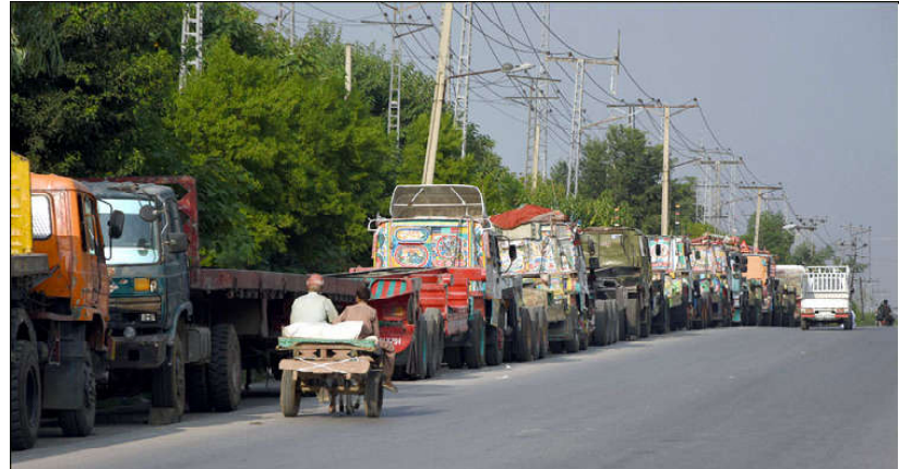
ISLAMABAD: A large numbers of heavy trailers parked in front of factories for waiting loading iron at Industrial area sector I-II, in the Federal capital.