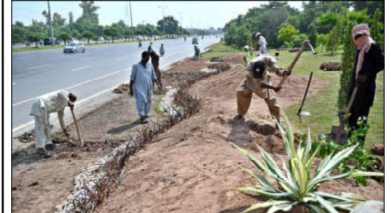
ISLAMABAD: CDA workers busy sapling plants at greenbelt along with Expressway in the Federal Capital.

observations, virtual space journeys, and more. The organization has invited educators to engage their students in a series of hands-on, interactive activities designed to foster a deeper understanding of space science. The program will feature a variety of learning experiences, including telescope observations of celestial phenomena, both during the day and at night. Students will also have the chance to participate in expert-led sessions on celestial objects such as planets, stars, and black holes, delving into the mysteries of the universe. Another highlight of the initiative is a virtual space journey.