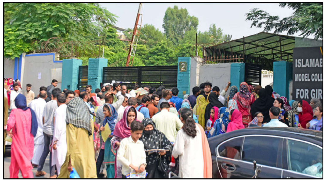
ISLAMABAD: A large numbers of parents stands outside Islamabad Model College for Girls G-10 as waiting for their children during the Medical and Dental College Admission Test (MDCAT) 2024, in the Federal Capital.