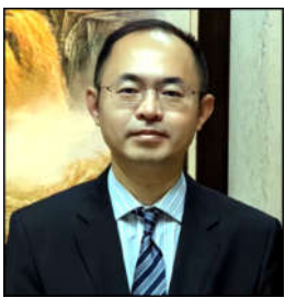
By Zhang Hao

In June of this year, the China-Pakistan Friendship Hospital (CPFH) in Gwadar, Balochistan, was officially handed over to the Pakistani side. As a significant livelihood project under the framework of the China-Pakistan Economic Corridor (CPEC), this modern comprehensive hospital, with 150 beds, features an intensive care unit (ICU), a neonatal intensive care unit (NICU), and four fully equipped operating rooms. It serves over 900 patients daily and employs nearly 300 local people.