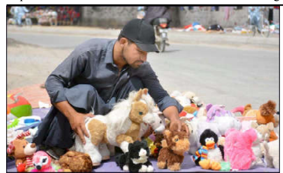
QUETTA: A vendor displaying stuffed toys to attract the customers at roadside near Sunday Bazaar at Joint road.