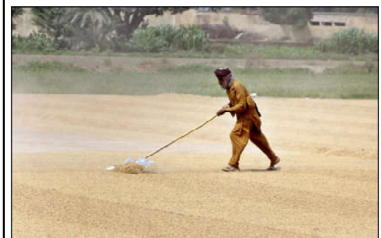
MULTAN: Labourer is busy spreading raw rice for drying in the field.

According to sources, IPPs did not generate as much electricity as they imported fuel and also received billions of rupees subsidy from the government.