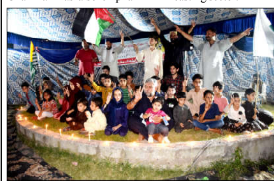
MUZAFFARABAD: Children of all Adhoc Contract employees of Azad Kashmir are protesting by lighting candles for their rights at Azadi Chowk.