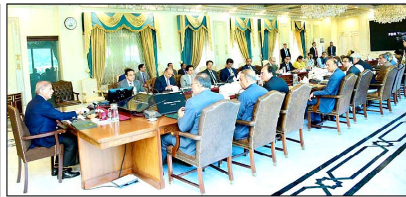
ISLAMABAD: Prime Minister Muhammad Shehbaz Sharif chairs a meeting on transformation plan of Federal Board of Revenue.

on time or those involved in fraud, to prevent tax evasion. It was told that such measures would be enforced after consultation with the good taxpayers. The meeting approved the FBR's Home Grown Transformation Plan which has been formulated on the prime minister's directives in consultation with economic and technological experts after analysing the tax receipts during the last 25 years. In the first phase, the efficient and competent officers would be posted in Karachi, the large taxpayer unit contributing 32% of receipts, who would be assisted by the auditors and experts. The plan also features the reward for best-performing officers, and a mandatory professional degree from the best universities for the officers, after their common and specialised training programs.