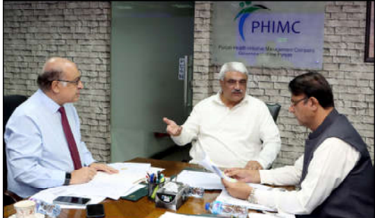
LAHORE: Punjab Minister for Health Khawaja Salman Rafique chairs high level meeting at Punjab Health Initiative Management Company.

and the construction of the Walkway Town Market. Additionally, several projects have been completed at the historic University of Peshawar, including the renovation of the university, repair and construction of the main roads, flooring of key areas, construction of public washrooms, and modern parking facilities. Furthermore, the renovation and restoration of the historic Government Hussain Sharif Higher Secondary School No. 1 in Peshawar City.