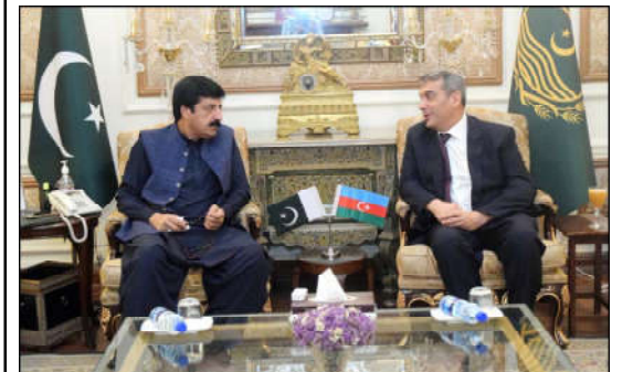
LAHORE: The Ambassador of the Republic of Azerbaijan to Pakistan, Khazar Farhadov, called on Punjab Governor, Sardar Saleem Haider Khan at Governor House.

The Election Commission stated that on the night of September 17, many bags of different polling stations were damaged by forcibly breaking the locks of the strong room in Papri Karachi, for which a committee has been established to investigate.