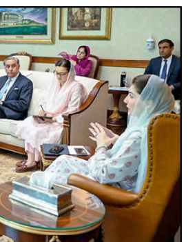
LAHORE: Punjab Chief Minister Maryam Nawaz Sharif presides over the special meeting about Health Department.