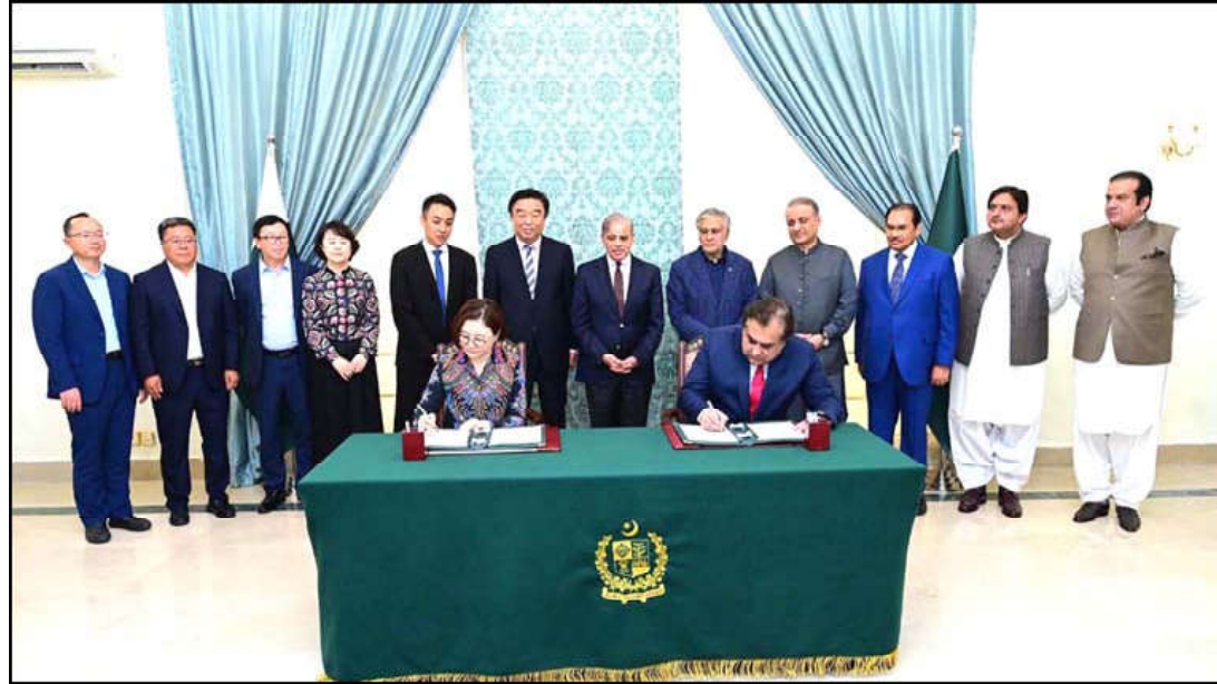
ISLAMABAD: Prime Minister Muhammad Shehbaz Sharif witnesses signing of an MoU between Board of Investment and RUYI Shangdong.

Briefing the prime minister, the company head said that the textile parks aimed at boosting textile exports and making the country a hub of textiles and garments.