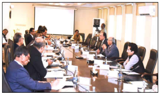
ISLAMABAD: Federal Minister for Finance and Revenue Senator Muhammad Aurangzeb chairs the meeting of the Economic Coordination Committee (ECC) at the Finance Division.