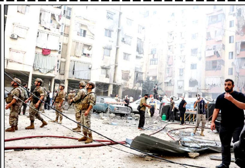
People and members of the military inspect the site of an Israeli strike in the southern suburbs of Beirut, Lebanon.

The Israeli military reported warning sirens sounded in northern Israel following the Beirut strike. Israeli media reported heavy rocket fire in northern Israel. Hezbollah said it had fired Katyusha rockets at what it described as the main intelligence headquarters in northern Israel "which is responsible for assassinations". White House spokesman John Kirby said he was not aware of any Israeli notification to the United States before the Beirut strike, adding that Americans were strongly urged not to travel to Lebanon, or to leave if they are already there.