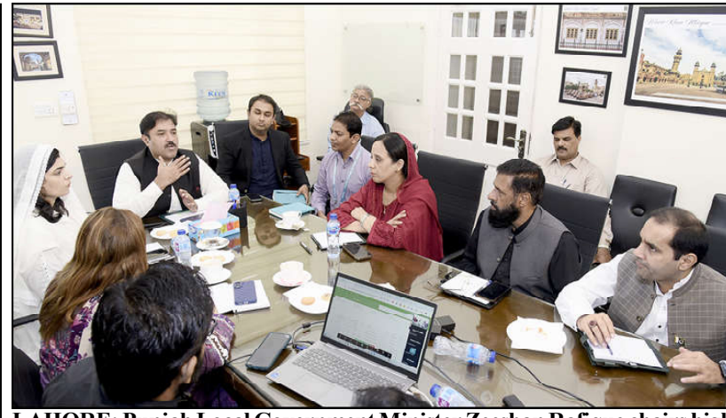
LAHORE: Punjab Local Government Minister Zeeshan Rafique chairs high level meeting regarding preparation of app for citizens under "Suthara Punjab Program".

He said that the relations between the two countries are based on common religion, culture and mutual support. He stressed the need for exchange of trade delegations between the two countries. The Ambassador of the Republic of Azerbaijan to Pakistan, Khazar Farhadov said that Pakistan stood with Azerbaijan in difficult times. He expressed determination to enhance trade relations between the countries. He said that plan for preferential trade facilities for Pakistani businessmen was on the cards. He said that there are vast opportunities for cooperation in infrastructure and energy sectors between Azerbaijan and Pakistan. He reaffirmed his commitment to foster economic relations with Pakistan.