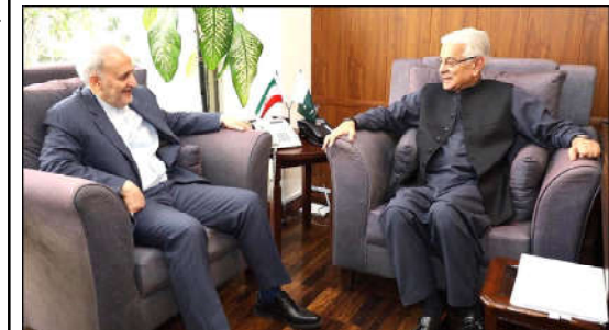
ISLAMABAD: Iranian Ambassador to Pakistan Dr. Reza Amiri Moghadam called on Federal Minister for Defence, Defence Production, and Aviation Khawaja Muhammad Asif.

of Chief Justice of Pakistan (CJP) Qazi Faez Isa, who is set to retire in October this year, following the PTT's request last month for the early issuance of a notification regarding the appointment of the next top judge. The ruling coalition left no stone unturned to woo the "fate-decider" Fazl, with leaderships of Pakistan Muslim League-Nawaz (PML-N) and Pakistan People's Party (PPP) holding a flurry of meetings with the cleric, but to no avail. Despite claims of securing the "magic number" needed to push the bill through, the government failed to table the amendments in parliament and postponed its move indefinitely — a development confirmed by PML-N Senator Irfan Siddiqui.