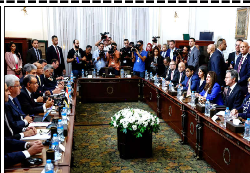
U.S. Secretary of State Antony Blinken attends a U.S.-Egypt strategic dialogue with Egypt's Foreign Minister Badr Abdelatty in Tahrir Palace in Cairo, Egypt.

had been agreed by all sides. Making progress involved long waits for messages to be passed between the parties that left time for incidents to disrupt the talks, Blinken said. "We've seen that in the intervening time, you might have an event, an incident - something that makes the process more difficult, that threatens to slow it, stop it, derail it - and anything of that nature, by definition, is probably not good in terms of achieving the result that we want, which is the ceasefire," Blinken said. He cited Hamas' execution of six Israeli hostages last month. He did not name Israel, which is believed to have targeted members of groups aligned against it in Lebanon, Syria and Iran that have set back the talks.