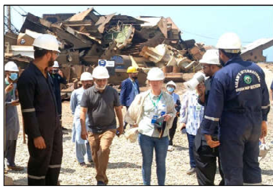
GADDANI: Team of IMO visiting Gaddani Ship Breaking Yard

prospectus of all the programs are available on the university website. The students can visit regional offices or call the university helpline at 051-111112468 for further information. The deadline for submitting admission form is 15th October. Please note that applications for admission can only be submitted online. Detailed information about all the programs offered is also available on the university website.