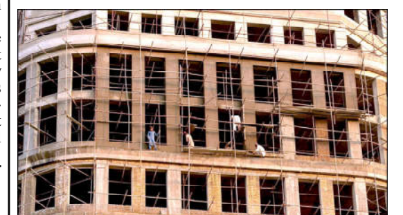
ISLAMABAD: Laborers busy in building construction work near F9 Park in the Federal Capital.

Nawaz Memon urged the citizens to discourage professional beggars. He emphasized that such activities could create an undesirable environment and could often be linked to organized groups. The administration has taken this step to not only clear the public spaces but also to ensure that vulnerable people, who may be exploited through begging networks, were not harmed. Memon called on the public to avoid giving money to individuals begging in public places, as it could inadvertently support these networks. Instead, he encouraged people to support recognized charitable organizations that work to address poverty and provide assistance to those in need.