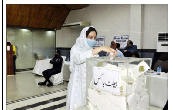
FAISALABAD: Voters casting their votes during the Elections of Chamber of Commerce in the city.

He said that Prime Minister Shehbaz Sharif had set up a Gems and Stone Committee which would form a growth-oriented policy with the consultation of all stakeholders.