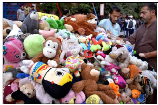
LAHORE: A vendor displaying and selling the used toys on their handcart at Landa Bazar in the Provincial Capital.