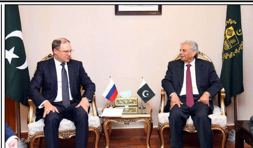
The Deputy Minister of Industry and Trade of Russian Federation Aleksei Gruzdev meets with Minister for Industries, Production and National Food Security Rana Tanveer Hussain in Islamabad.

He said the government will provides all the facilities to the Russian investor in the country.