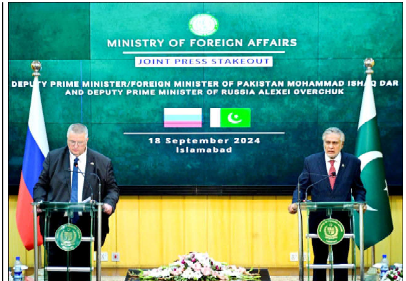
Deputy Prime Minister and Foreign Minister Senator Mohammad Ishaq Dar along with Deputy Prime Minister of Russia Alexei Overchuk addresses a joint press stakeout at the Ministry of Foreign Affairs, Islamabad

suess, including the situation in Palestine. Ishaq Dar said that Pak-Russia bilateral trade reached a record one billion US dollars last year. Expanding trade relations by addressing logistical issues is a priority for both sides. He emphasized the potential for energy cooperation, which will be explored further in detailed discussions. Additionally, both countries are eager to develop connectivity projects, including railways and roads, extending beyond their borders. Ishaq Dar expressed satisfaction over the growing cultural and educational ties between the universities of Pakistan and Russia.