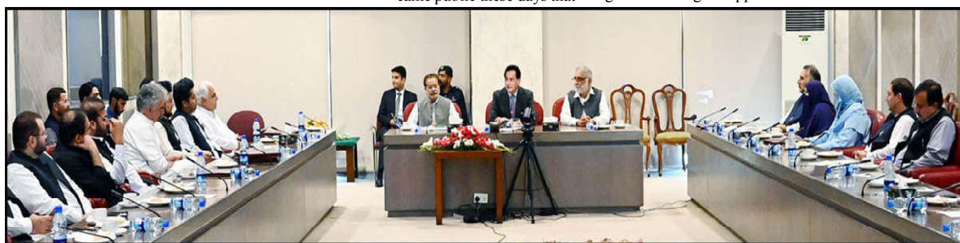
ISLAMABAD: Speaker National Assembly Sardar Ayaz Sadiq in a meeting with MPs & Officers of Khyber Pakhtunkhwa at Parliament House.