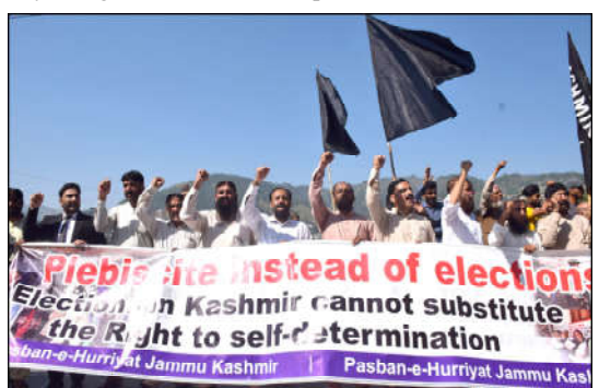
MUZAFFARABAD: Kashmiris shouting slogans at Azadi Chowk against the elections in Occupied Kashmir and demanding referendum.