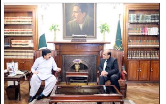
LAHORE: Deputy Chairman NAB Sohail Nasir meeting with Punjab Governor Sardar Saleem Haider Khan at Governor House.

Chaudhry Shafay Hussain said that the plan to establish centres of excellence in Punjab is a milestone in the preparation of skilled manpower. Completion of the project will increase the efficiency and professional technical skills of these institutions. CETA based courses will be conducted on modern lines in all these centres of excellence. Chaudhry Shafay Hussain apprised that under this project, access to technical and vocational education will be easy. The youth will get decent employment opportunities.