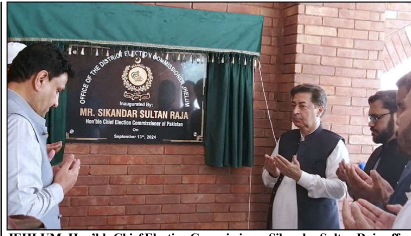
JEHLUM: Hon'ble Chief Election Commissioner Sikandar Sultan Raja offers dua following the curtain-raising and inauguration of the District Election Commission Office in the city.