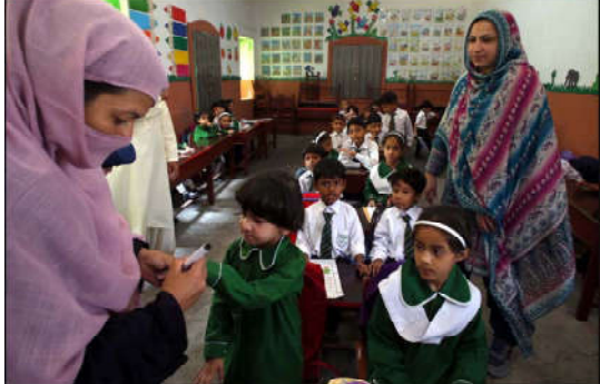
PESHAWAR: A health worker administers polio vaccine drops to a child during anti-polio immunization campaign, at a School in Peshawar.