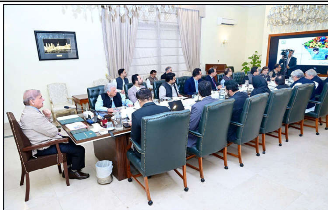
ISLAMABAD: Prime Minister Muhammad Shehbaz Sharif chairs the first session of the steering committee of Small and Medium Enterprises Development Authority (SMEDA).