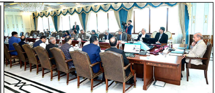
ISLAMABAD: Prime Minister Muhammad Shehbaz Sharif chairs a review meeting regarding Monkey Pox.

He said that in 2018, the estimated construction cost of the Damer Basha Dam was Rs. 479 billion, and Rs. 120 billion had already been spent on land acquisition.