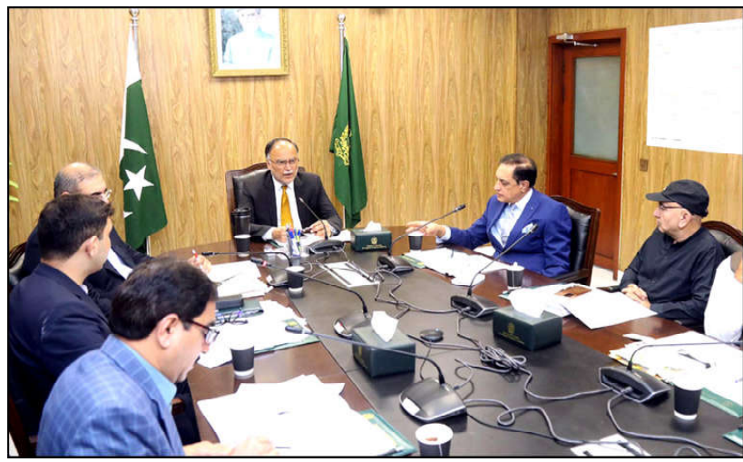
ISLAMABAD: Federal Minister for Planning, Development, and Special Initiatives, Ahsan Iqbal, presides over a review meeting on the progress of the Diamer Basha Dam project.

During the meeting, the Damer Basha Dam is a crucial project for Pakistan's water and food security and must be completed expeditiously in the national interest.