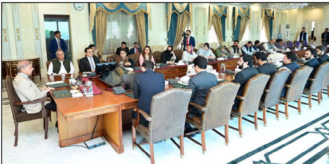
ISLAMABAD: A delegation of young parliamentarians calls on Prime Minister Muhammad Shehbaz Sharif.