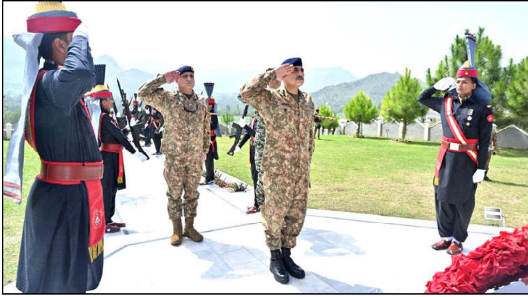
ORAKZAI: Chief of Army Staff General Syed Asim Munir is saluting to pay tribute at Yadgar e Shuhada after laying floral wreath at Yadgar e Shuhada at Orakzai District.

Vol. XIV No. 214 Reg. mails-B / ID-445 Saturday September 14, 2024, Rabi-ul-Awwal 09, 1446 A.H. Ph: 2158688, 2158997 Pages 4: Rs. 12