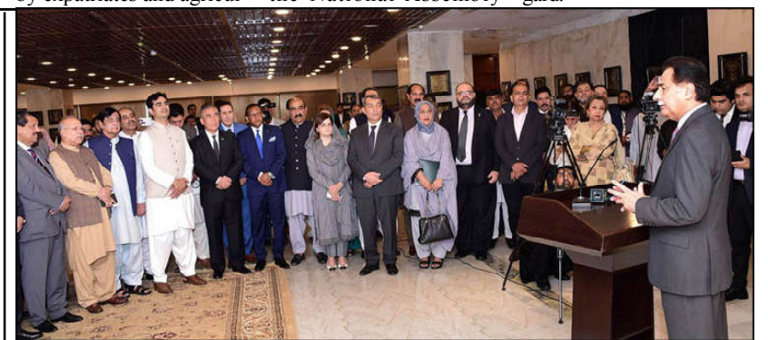
ISLAMABAD: Speaker National Assembly Sardar Ayaz Sadiq addressing the inauguration ceremony of the Calligraphy Exhibition in connection to celebrate the Eid Milad-un-Nabi (SAW) at Parliament House.

noble model and unmatched nobility of the Holy Prophet (pbuh) are a beacon of light for all of us. The Speaker said that success in this world and the hereafter is dependent upon following the excellent deeds of the Prophet (peace and blessings of Allah be upon him). He also underscored that the teachings of the Prophet ? teach us brotherhood, peace, justice, and service to humanity. Ayaz Sadiq said, "In this blessed month, we need to remember the teachings of the Prophet and implement these teachings in our lives."