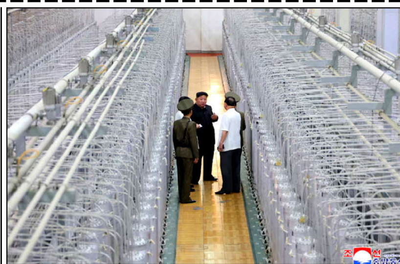
North Korean leader Kim Jong Un tours facilities during a visit to the Nuclear Weapons Institute and the production base of weapon-grade nuclear materials at an undisclosed location in North Korea.

increase the nuclear weapons for self-defense," a goal he has repeatedly stated in recent years. It said Kim ordered officials to push forward the introduction of a new type of centrifuge. Kim said North Korea needs greater defense and preemptive attack capabilities because "anti-(North Korea) nuclear threats perpetrated by the U.S. imperialists-led vassal forces have become more undisguised and crossed the red line," KCNA said. South Korea's Unification Ministry strongly condemned North Korea's push to boost its nuclear capability. A ministry statement said North Korea's "illegal" pursuit of nuclear weapons in defiance of U.N. prohibitions is a serious threat to international peace. It said North Korea must realize it cannot win anything with its nuclear program.