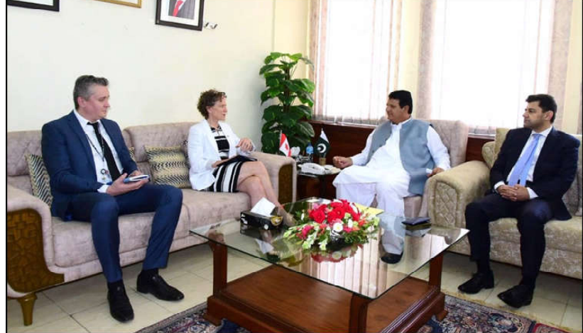
ISLAMABAD: Canadian High Commissioner to Pakistan Leslie Scanlon calls on Federal Minister for States and Frontier Regions Engr Amir Muqam at Ministry.

ISLAMABAD (APP): The Islamabad Capital Territory (ICT) administration has planned to celebrate the Eid Milad-un-Nabi (PBUH) with the series to programmes and decorations in a befitting manner in the Federal Capital. In this regard, Deputy Commissioner (DC) Islamabad, Irfan Nawaz Memon has chaired a key meeting and discussed plans for the upcoming Eid Milad-un-Nabi (PBUH). They also discussed city security, cleanliness arrangements and public participation in the different rallies and seminars. The meeting was attended by the Senior Superintendent of Police (SSP) and the members of District Peace Committee. The officials focused on ensuring the city is well-prepared for the celebrations. Security measures and overall readiness were key points of discussion, with the DC stressing the importance of maintaining order throughout the city. In line with the events, the DC announced that the city would be illuminated with lights to mark the occasion.