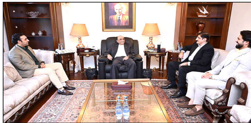
ISLAMABAD: Chief Minister Sindh Syed Murad Ali Shah, calls on President Asif Ali Zardari, at Aiwan-e-Sadr. Chairman Pakistan People's Party and MNA, Bilawal Bhutto Zardari, is also present in the meeting.

ISLAMABAD (APP): Commerce Minister, Jam Kamal Khan chaired the 23rd Meeting of Ministers of the Shanghai Cooperation Organization (SCO) Member States responsible for foreign economy and trade activities on Thursday. Pakistan hosted this gathering in its capacity as the chair of the SCO Council of Heads of Government, the second-highest forum of the organization, said a press release issued here on Thursday. The ministerial meeting was preceded by the 47th Meeting of the Commission of Senior Officials (CSO) of SCO Member States on 10th and 11th September 2024, also held in Islamabad. In his opening remarks, Jam Kamal Khan, welcomed his counterpart Ministers from the SCO fraternity to Pakistan and reiterated Pakistan's commitment to the laudable aims and objective of the SCO to promote peace and prosperity in the region. While acknowledging the global economic challenges facing the region, he emphasized the vital role of the SCO in addressing these issues through cooperation and constructive engagement. To this end, he conveyed Pakistan's strong commitment and readiness to contribute to and collaborate with all Member States to achieve our shared goals.