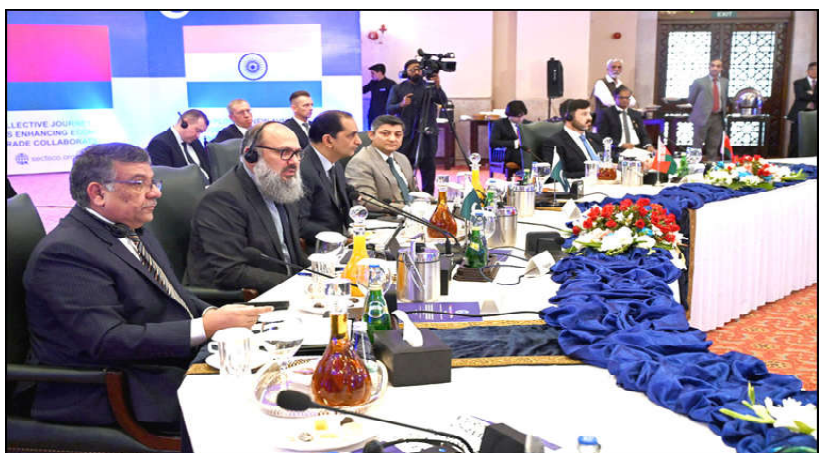
ISLAMABAD: Federal Minister for Commerce, Jam Kamal Khan addresses the 23rd meeting of the Ministers of the Member States of the SCO 'Responsible for Foreign Economic and Trade Activities'.