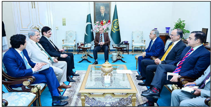
ISLAMABAD: Chief Minister of Sindh Syed Murad Ali Shah and Member of the National Assembly Syed Naveed Qamar call on Prime Minister Muhammad Shehbaz Sharif.