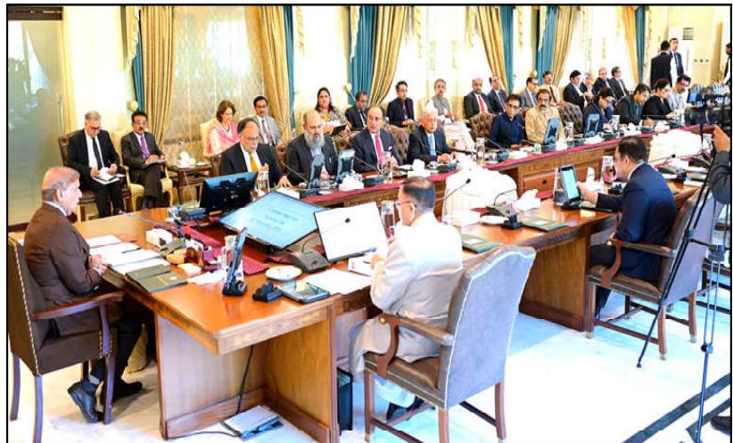
ISLAMABAD: Prime Minister Muhammad Shehbaz Sharif chairs the Federal Cabinet meeting.

Vol. XIV No. 213 Reg. mails-B/ID-445 Friday September 13, 2024, Rabi-ul-Awwal 08, 1446 A.H. Ph: 2158688, 2158997 Pages 4: Rs. 12