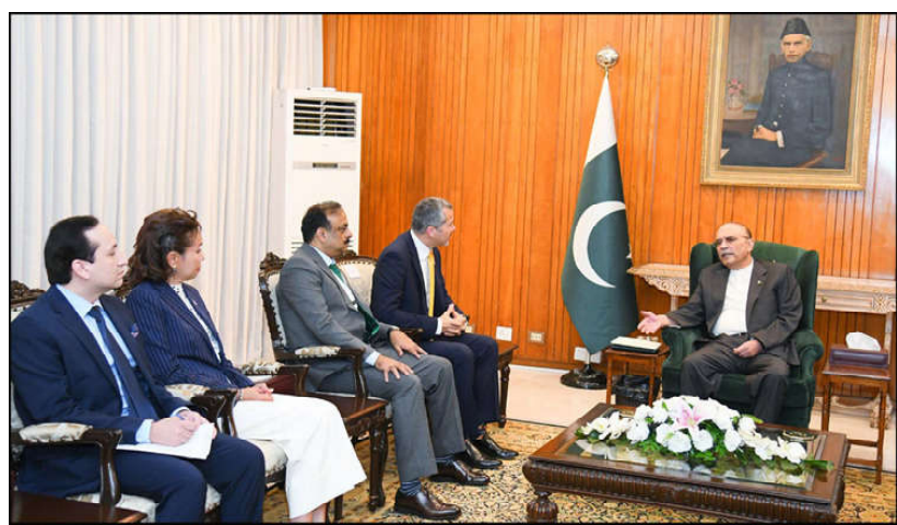
ISLAMABAD: The visiting Secretary General of the International Maritime Organization (IMO), Mr Arsenio Antonio Dominguez Velasco, call on President Asif Ali Zardari, at Aiwan-e-Sadr.