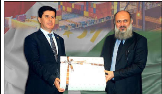
ISLAMABAD: Federal Minister for Commerce Jam Kamal Khan and the Trade Minister of Tajikistan exchange souvenirs during a sideline meeting at the SCO Summit. Discussions focused on enhancing bilateral trade volume and mutual interests.

ISLAMABAD (APP): Pakistan and Russia are set to sign a memorandum of understanding to promote agricultural cooperation aimed at developing the local agriculture sector and enhancing the productivity of agricultural products. Russia will also provide technical assistance for modernizing fertilizer manufacturing plants in Pakistan to boost the output of fertilizers and meet local agricultural input requirements. This consensus was reached during a meeting between Minister for National Food Security and