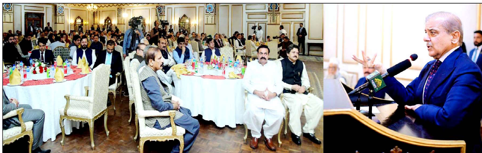
ISLAMABAD: Prime Minister Muhammad Shehbaz Sharif addresses at the dinner hosted in honour of the Parliamentarians of Coalition parties of the government

He urged the need to rise above partisan interests and committedly work for the welfare of the people, adding that he was against the politics of confrontation that harmed the country.