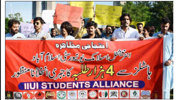
ISLAMABAD: Students of International Islamic University protesting outside NPC against evictions from hostel and administrative incompetence.

Federal Minister Engr Amir Muqam appreciated the briefing given by representatives.