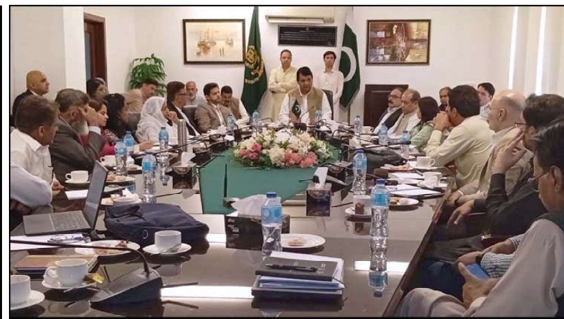
ISLAMABAD: Federal Minister for States and Frontier Regions Engr Amir Muqam chairs a meeting of representatives of different NGOs.

To another question the minister said the Federal Public Private Partnership (PPP) Policy has been approved by the Federal Cabinet in its meeting held on 17th April 2024.