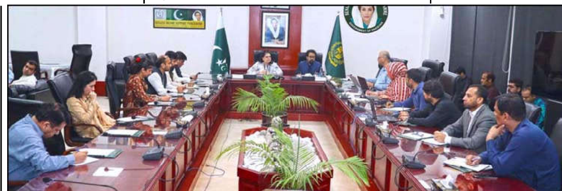
ISLAMABAD: Senator Rubina Khalid, Chairperson of Benazir Income Support Programme (BISP), conducts a live E-Katchery session at BISP Headquarters.

During the preliminary interrogation, the accused confessed to being involved in numerous snatching activities in the premises of Shams Colony police stations, spokesperson said and added several cases have been filed against the suspects at Shams Colony Police Station.