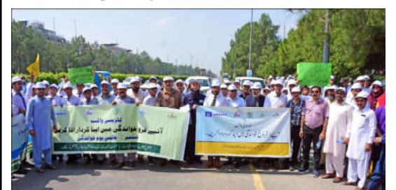
ISLAMABAD: National Commission for Human Development (NCHD) organized a Literacy Day Walk in collaboration with UNESCO in the Federal Capital.

He said that the mission of OPF was to ensure welfare of Overseas Pakistanis and their families and contribute towards their systematic rehabilitation on return, by generating sufficient resources and coordination with the stakeholders.