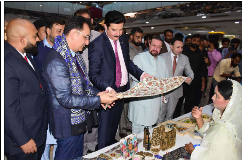
ISLAMABAD: Governor Khyber Pakhtunkhwa Faisal Karim Kundi visiting artisans at work exhibition in the Federal Capital.

He said we have taken various initiatives to further enhance our trade with Germany and German Trade Minister also visited Pakistan.