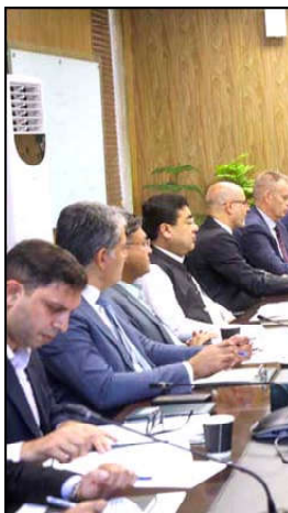
ISLAMABAD: Federal Minister for Planning, Development & Special Initiatives, Ahsan Iqbal, chairing the 4th meeting of the Policy and Strategy Committee (PSC) and the Oversight Board on Post-Flood Reconstruction Activities.