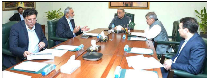
ISLAMABAD: Federal Minister for Communications, Privatization & Board of Investment Abdul Aleem Khan presides over high level meeting on NEA.

The floods claimed over 1,700 lives, with one-third of the victims being children. More than half of the districts in Sindh, Balochistan and Khyber Pakhtunkhwa were declared disaster-stricken.