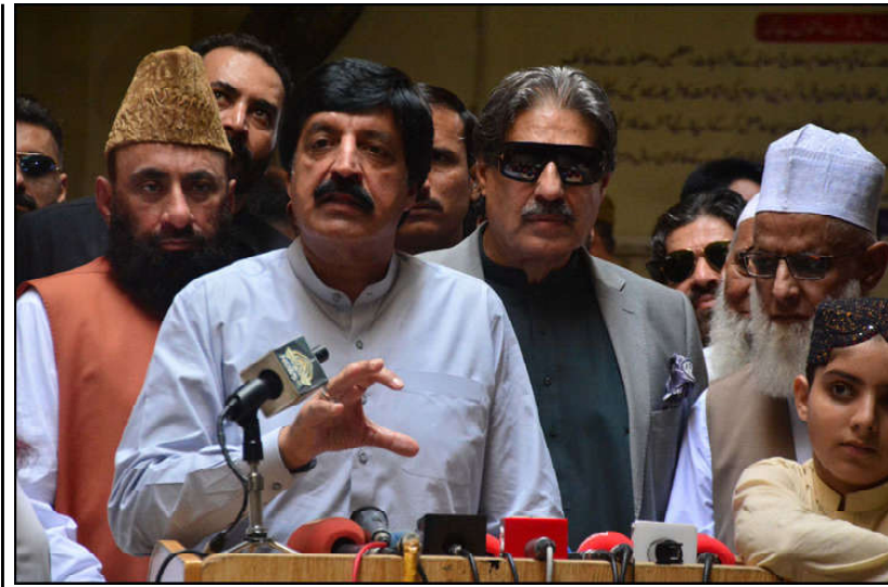
RAWALPINDI: Governor Punjab, Sardar Saleem Haider addressing to the media at Madrasa Taleem ul Qur'an Raja Bazar.

Salim reiterated his commitment to serving the people. Responding to a question, he said that the doors of Governor House are open for CM KPK. "I will ask Ali Amin Gandapur to refrain from spreading unrest", he said adding that politics couldn't be run by aggressive slogans. "Politics can't be run by raising Mola Jutt slogans", he said and asked the KPK CM to avoid irresponsible behavior. The governor condemned Gandapur's statement regarding journalists saying it an 'irresponsible' statement.