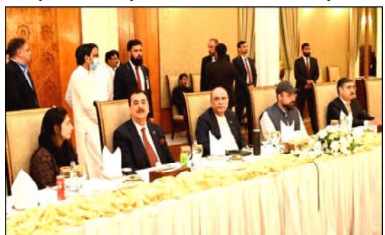
ISLAMABAD: President Asif Ali Zardari attending a dinner held in honour of Parliamentarians belonging to different political parties at President House.

He pointed out that the Pakistan Tehreek-e-Insaf (PTI) had a record of not carrying out even a single quality project in Khyber Pakhtunkhwa during its 12-year tenure.