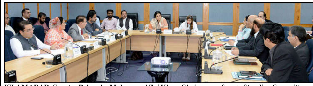
ISLAMABAD: Senator Palwasha Mohammad Zai Khan, Chairperson Senate Standing Committee on Information Technology and Telecommunication presiding over a meeting of the committee at Parliament Lodges.

Faisal Kundi said that the Chief Minister with a two-third majority should take a vote of confidence from the Provincial Assembly. He also called for speedy trial of the May 9 accused and said that there should be no exception for those who do not follow the constitution of the country.