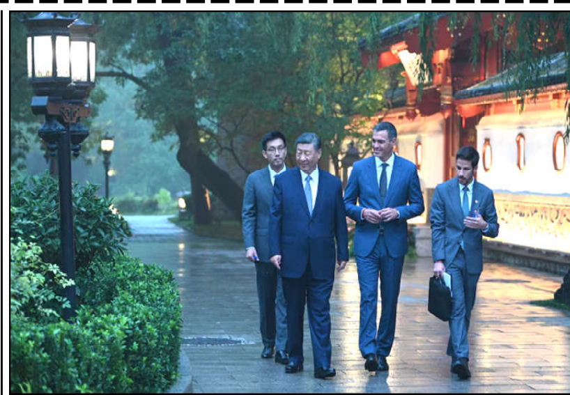
Spain's Prime Minister Pedro Sanchez and China's President Xi Jinping meet at Diaoyutai State Guesthouse in Beijing, China.

events Spain would work for a negotiated consensus to the EV dispute within the World Trade Organization and that a "trade war would benefit no one," a government source said. Spain in 2023 exported $1.5 billion worth of the pork products that China will investigate, Chinese customs data showed, dwarfing the outbound shipments from second- and third-ranking the Netherlands and Denmark. Spain also sold just under $50 million worth of targeted dairy products to China last year. But in a promising sign for Spain's pork producers, a separate source with direct access to Xi's meeting with Sanchez said the two leaders had "found harmony and understanding," when asked about possible curbs on Spain's outbound pork shipments.