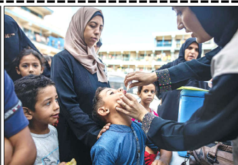
GAZASTRIP: A child receives vaccination drops at a makeshift camp in a school at Khan Yunis for people displaced by the Israeli aggression.