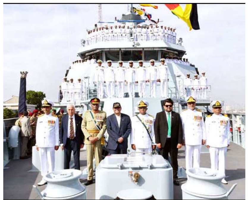
KARACHI: President Asif Ali Zardari in a group photo with senior military officials and crew of Pakistan Navy Ship Hunain during its induction ceremony.

The army chief reiterated that the motto of the Pakistan Army—"Faith, Piety, and Jihad"—remains its greatest strength, enabling the military to counter any threats from enemies. He praised the unmatched bravery and professionalism of Pakistan's armed forces, not just in conventional warfare but also in countering the scourge of terrorism. General Munir spoke about the ongoing fight against terrorism, noting that Pakistan's forces have achieved remarkable success in controlling the threat, which has no parallel globally. "The army of any other country has not been able to achieve the success with which our forces have contained the menace of terrorism," he stated, adding that thanks to the efforts of the security forces and law enforcement agencies, today Pakistan stands safe from instability. However, the COAS also highlighted new and emerging challenges such as "digital terrorism" and the so-called 5th-generation warfare. He warned that these forms of terrorism, driven by the collaboration of foreign and anti-national elements, are more dangerous and complex than traditional terrorism.