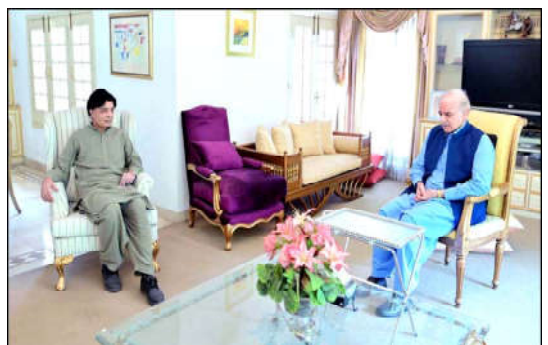
ISLAMABAD: Prime Minister Muhammad Shehbaz Sharif offering condolences to Chaudhary Nisar Ali Khan on the demise of his sister.