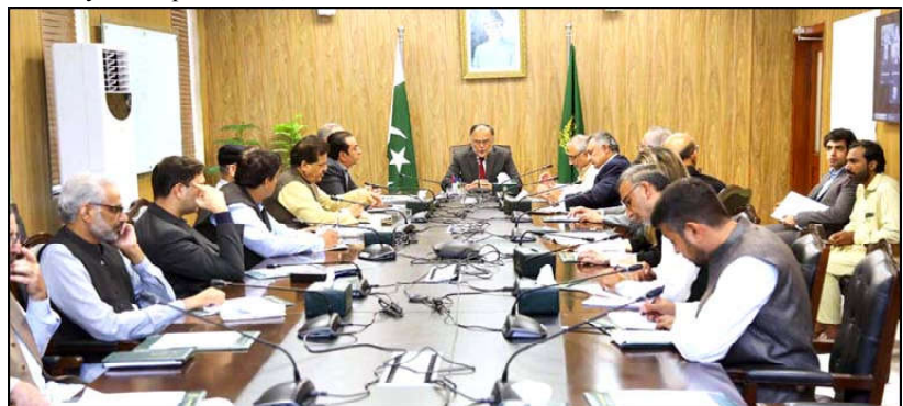
RAWALPINDI: Federal Minister for Planning, Development, and Special Initiatives Ahsan Iqbal chairs the first meeting of the Planning Commission's Policy Board.

Despite their numerical advantage, the prime minister said the enemy designs were thwarted by the valiant Armed Forces and were handed an unforgettable defeat, on all fronts. He saluted the families of Shuhada, whose immense resilience and strength continued to inspire the nation. The prime minister emphasized that divisions within the nation posed threat to the country's integrity and any movement in the country aimed at weakening the state will not be tolerated at any cost. "Abuse or bullets are not solution to the issues," he said stressing the need of unity among the nation. The prime minister said all Pakistanis were responsible to ensure development, peace and stability in the country. "We might be in different fields but our goal is only one that is development, integrity and security of Pakistan."