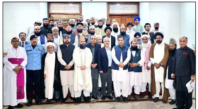
ISLAMABAD: Interior Minister Mohsin Naqvi and Federal Minister for Religious Affairs Chaudhry Salik Hussain in a group photo with a delegation of scholars and religious leaders.

from being misled into terrorism. Mohsin Naqvi clarified that anyone who takes up arms against the state is a terrorist, and our religion and constitution also clearly state that anyone who takes up arms against the state is a terrorist. He said that Islam and our country's law do not allow anyone to be killed without reason. We need to unite against the curse of terrorism for the sake of our country. He said, "We will visit every province, meet chief ministers and scholars, and convey the same message. We will also convey this message to the federal Government, which is working day and night for this purpose." Interior minister emphasized that we need to stop the misuse of Islam's name, and the true leaders of the religion are scholars and spiritual leaders, not those who take up arms against the state.