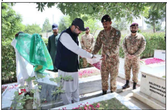
RAWALPINDI: Federal Minister for Overseas Pakistanis and Human Resource Development Chaudhry Salik Hussain visited Army Graveyard to pay tribute to the unwavering bravery and ultimate sacrifices of armed forces in Racecourse.