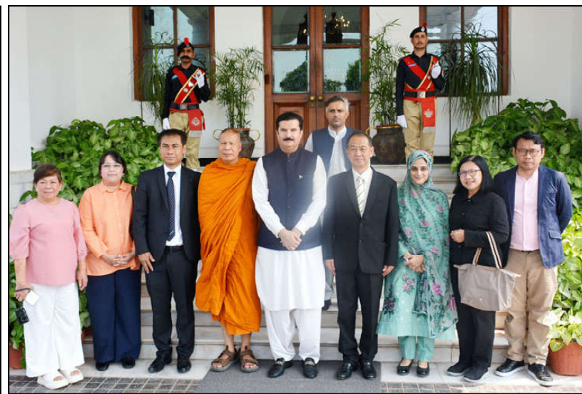
PESHAWAR: Governor Khyber Pakhtunkhwa Faisal Karim Kundi in a group photo with Thai delegation at Governor House.

Gandhara Buddhist exhibition and symposium will be held in Peshawar and Swat. Governor Kundi advocated for art and culture exchanges between Thailand and Khyber Pakhtunkhwa, particularly focusing on Buddhist civilization. The Thai delegation shared gifts and assured fully support for cultural exchange. They said that Pakistan is rich of Buddhism civilization. There is good diplomatic relations between the two countries and we want to develop it more. Meanwhile, Farrukh Toirov, Deputy Representative of the Food and Agriculture Organization (FAO) in Pakistan called on the Governor.