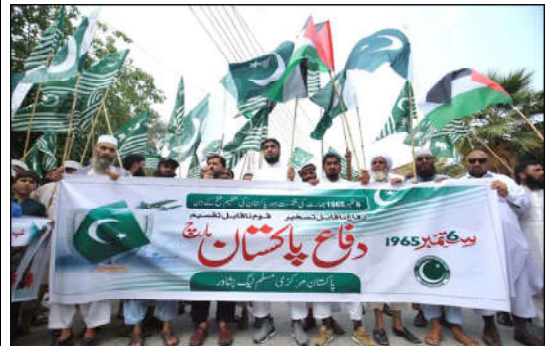
PESHAWAR: Pakistan Markazi Muslim League workers held a rally in connection with Pakistan Defence Day in front of the Press Club.