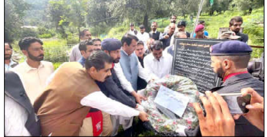
HAVELI KAHUTA: Federal Minister for Kashmir Affairs and Gilgit-Baltistan Engr. Amir Muqam laying floral wreath at the graves of martyred on the occasion of Pakistan Defence Day.

military demonstrated against the Indian troops. Rana paid rich tributes to the brave soldiers who thwarted the enemy's attempts to harm Pakistan, adding "The day reflects our nation's strong commitment to defending its sovereignty". Recognizing the patriotism, determination, and courage of the country's soldiers, he reaffirmed the nation's firm support for its armed forces in fulfilling their duty to protect Pakistan.