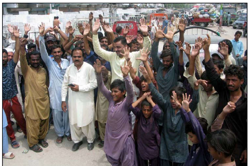
HYDERABAD: Members of All Pakistan Marble Association block road as they are holding protest demonstration against prolong electricity load shedding and change the electric transformer in their area, at Maki Shah road in Hyderabad.