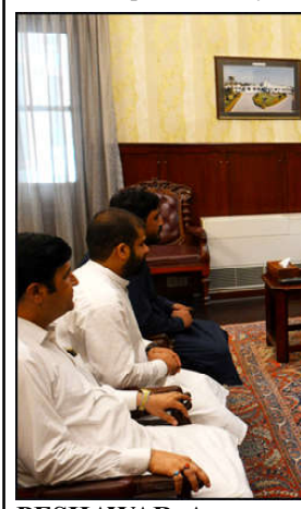
PESHAWAR: A representative delegation of Clearing Agent Association led by Ziaulla Afridi called on Governor Khyber Pakhtunkhwa Faisal Karim Kundi at Governor House.

ISLAMABAD (APP): The 100-Index of the Pakistan Stock Exchange (PSX) gained 73.02 points on Tuesday, showing a positive change of 0.09 percent, closing at 78,356.32 points against 78,283.30 points on the last working day. A total of 436,672,976 shares were traded during the day as compared to 457,280,204 shares the previous day.