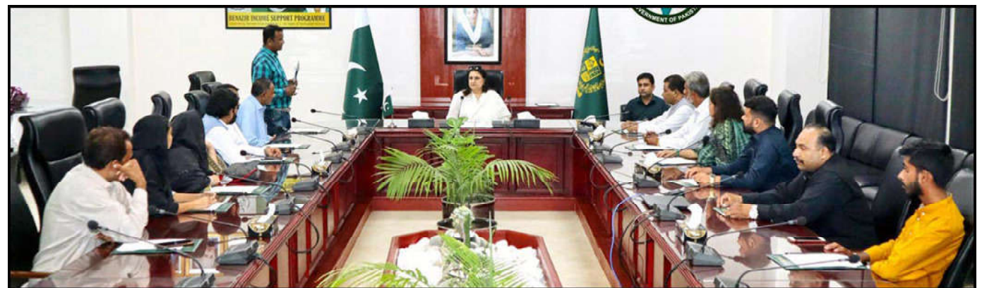
ISLAMABAD: Chairperson Benazir Income Support Programme (BISP), Senator Rubina Khalid chairs a meeting with delegation from the Pakistan People's Party Minority Wing, Khyber Pakhtunkhwa, at BISP headquarters.

Commenting NAVTTTC's, TEVTA and TANG's ongoing efforts in cultivating a skilled workforce, he emphasized the pivotal role of skill education in national development.