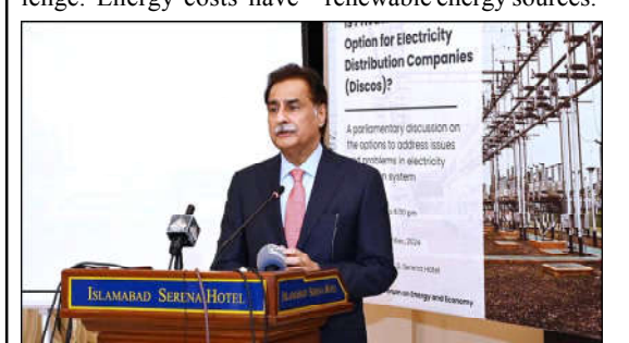
ISLAMABAD: Speaker of National Assembly Sardar Ayaz Sadiq addressing the participants of the Seminar on "Parliamentary consultation on strategic options for electricity distribution system in Pakistan."

Ayaz Sadiq said that energy cost is a global challenge. Energy costs have