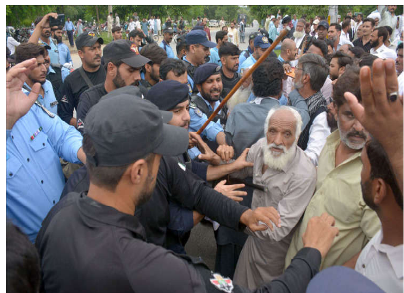
ISLAMABAD: Policemen arresting protesters during PWD employees protest in favor of their demands at Srinagar Highway in the Federal Capital.