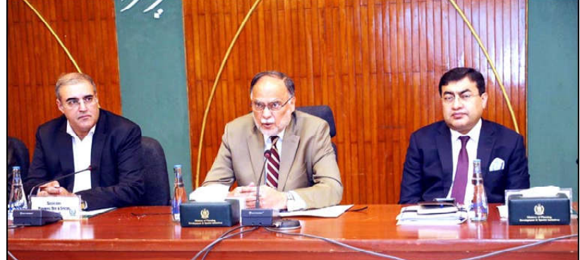
ISLAMABAD: The Central Development Working Party (CDWP) has approved 8 development projects worth of Rs. 144.3 billion during its meeting chaired by Minister PDSI & Deputy Chairman Planning Commission Ahsan Iqbal.