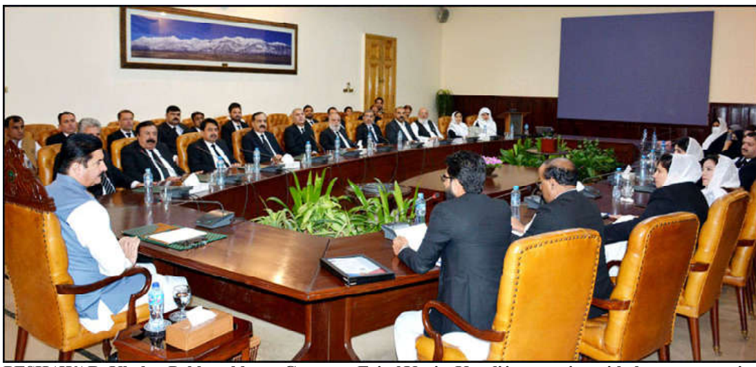
PESHAWAR: Khyber Pakhtunkhwa Governor Faisal Karim Kundi in a meeting with the representative of delegation of International Lawyers Association at Governor House.