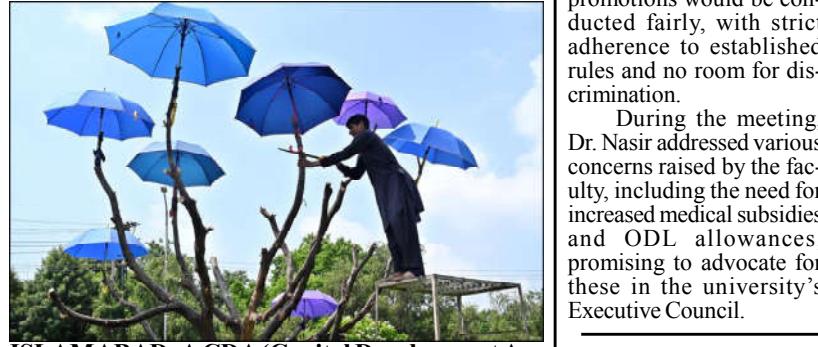
ISLAMABAD: A CDA (Capital Development Authority) worker is busy installing umbrellas on a tree at the Kashmir Chowk for beautification of Federal Capital.