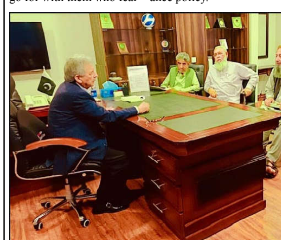
A delegation of the Utility Store Corporation meets with Federal Minister for Industries and Production, Rana Tanveer Hussain in Islamabad.

When they hear about talks then they start crying for May 9, he said adding May 9 is their insurance policy.