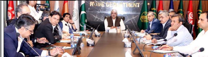
LAHORE: Provincial Health Minister and Chairman of the Cabinet Committee for Law and Order Khawaja Salman Rafique chairs 12 th Law and Order meeting at Home Department.

Rafique emphasized that foolproof security measures will be implemented for the by-elections scheduled for September 12 in Rahim Yar Khan. "Approval has been granted to deploy three companies of the Army and Rangers in the area. Additionally, extraordinary security preparations are in place for the cricket series with Bangladesh. Efforts will be relentless in maintaining peace and order in Punjab. Those disrupting public order will be dealt with firmly, and operations will persist until the last terrorist in the Kacha area is eliminated."