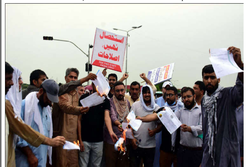
ISLAMABAD: Employees of PWD burning their professional degrees during a sit-in protest (Dharna) in favor of their demands at Srinagar Highway in the Federal Capital.