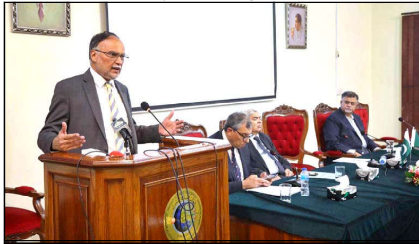
ISLAMABAD: Federal Minister for Planning, Development and Special Initiatives, Prof. Ahsan Iqbal, addressing a symposium on "Climate Change and Health Development Consequences in Pakistan at the Pakistan Academy of Sciences."