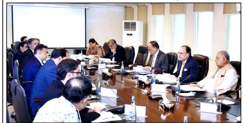
ISLAMABAD: Federal Minister for Finance and Revenue, Senator Muhammad Aurangzeb chairing a meeting of CCoSOEs at the Finance Division.

To another question, he said that proper survey was being carried out before construction of any road adding that it was need of the hour to construct 10th Avenue. After traffic count, it was decided whether the road would be constructed or not, he added.