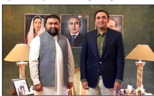
ISLAMABAD: Chief Minister Balochistan Mir Sarfaraz Ahmed Bugti photographed with Chairman PPP Bilawal Bhutto Zardari.

The resolution stated: "The Senate of Pakistan congratulates Arshad Nadeem on his remarkable achievement of winning the Gold medal in the Javelin throw at the Paris Olympics.