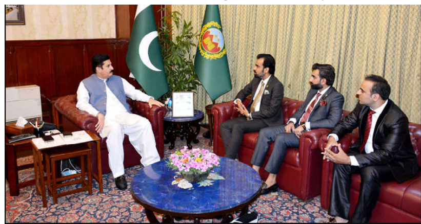
PESHAWAR: Governor Khyber Pakhtunkhwa Faisal Karim Kundi is called on by representative delegation of UK-Pakistan Trade & Investment Board at Governor House.