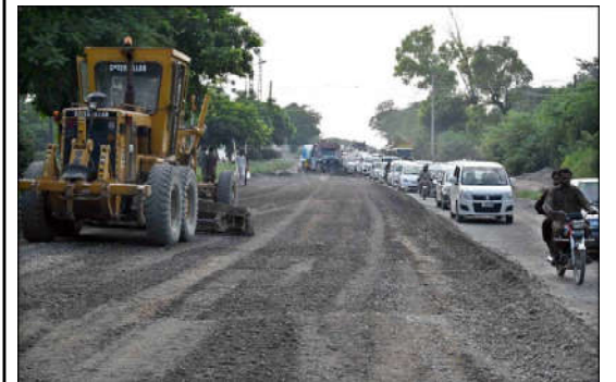
ISLAMABAD: Heavy machinery is being used as construction work on Club Road is underway during development work in the Federal Capital.

Urban areas in the country already see many girls riding scooters due to their hectic routines, creating a demand for independent transportation, she added.