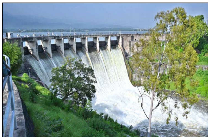
ISLAMABAD: Rawal Dam authorities open spillway of the reservoir after dam water level rose to alarming level due to heavy rain.

Romina said allocation of 1.5 per cent of revenue generated from recreational spots in margalla hills under MHF would be ensured to protect and conserve natural resources of the Margalla Hills National Park. The PM's aide urged the administration of other cities to follow Islamabad's model for climate action in the cities, prioritising use of renewable energy, adoption of electric vehicles.