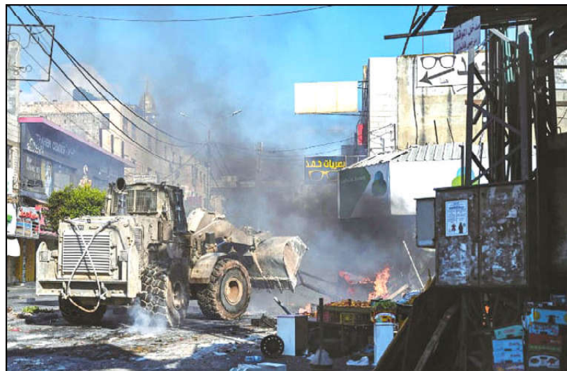
OCCUPIED WEST BANK: An Israeli bulldozer drives as a fire breaks out in a fruit market in the city of Jenin amid ongoing Israeli raids.

of Gaza, medicines said. The Israeli military said it continued to operate in the central and southern Gaza Strip. In Khan Yunis, however, families returned to their areas after the army ended a 22-day offensive it said was aimed at preventing Hamas from regrouping. Medics said they recovered at least nine bodies from the area where the army operated. Footage showed large areas were flattened, and buildings and infrastructure destroyed. Over the last 11 months, Israel's assault on the Hamas-governed enclave has killed more than 40,600 Palestinians, according to the local health ministry. Nearly the entire Gaza population of 2.3 million has been displaced and the enclave has a hunger crisis. Israel faces genocide allegations according to the International Court of Justice ruling.