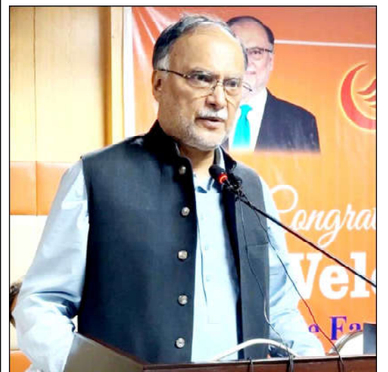
NAROWAL: Federal Minister Ahsan Iqbal addressing faculty members of Narowal Medical College

LAHORE (APP): Planning Minister Ahsan Iqbal on Sunday said that government has planned to train youths in the IT sector through Chinese cooperation. In a statement issued here, he highlighted the contribution made by the Pakistan Muslim League-Nawaz's (PML-N) government, asserting, "The PML-N led governments have distributed 1 million laptops among students." "One million youngsters will get IT education every year," he added. The minister said that that the incumbent government was creating opportunities to provide digital education to people, stressing the need for increasing literacy. "We will have to boost literacy by up to 90 percent in a bid to steer the country towards prosperity," he added. The minister announced the release of the district education index report. "Schools from 124 districts of the country have scored 53 percent. The prime minister has established a task force in connection with the educational emergency," he added.