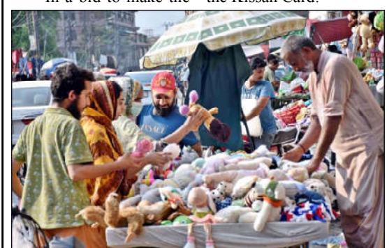
LAHORE: People selecting and purchasing second hand toys from roadside vendor in Provincial Capital.

To ensure a hassle-free experience for farmers, the authorities have implemented a smooth registration procedure for the Kissan Card.