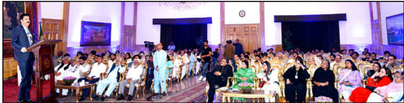
PESHAWAR: Khyber Pakhtunkhwa Governor Faisal Karim Kundi addressing National Dialogue session organized by Oxford Alumni Community of Pakistan in Governor House.

Assembly, Rana Afzal Hussain. Governor Punjab also offered his heartfelt condolences to Rana Ahmed Atiq Anwar, Member of National Assembly and other members of his family. He said that he equally shares the grief of the bereaved family in this time of sorrow, trouble and difficulty. On this occasion, Member National Assembly of Muslim League-N, Shaista Pervez Malik, Ali Pervez Malik, Sardar Irfan Dogar, Mohsen Shah Nawaz Ranjha, Pir Ashraf Rasool, Leader of People's Party Haji Azizur Rahman Chan, Allama Yusuf Awan and