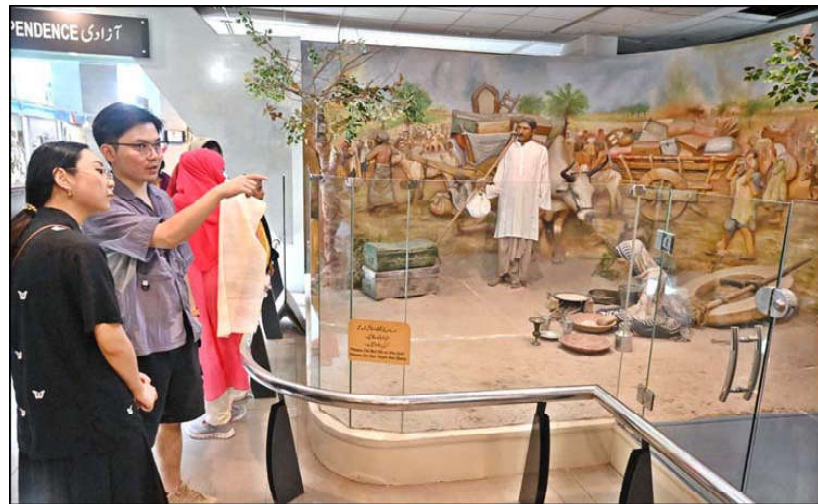
ISLAMABAD: Foreigners visits Pakistan Monument Museum.