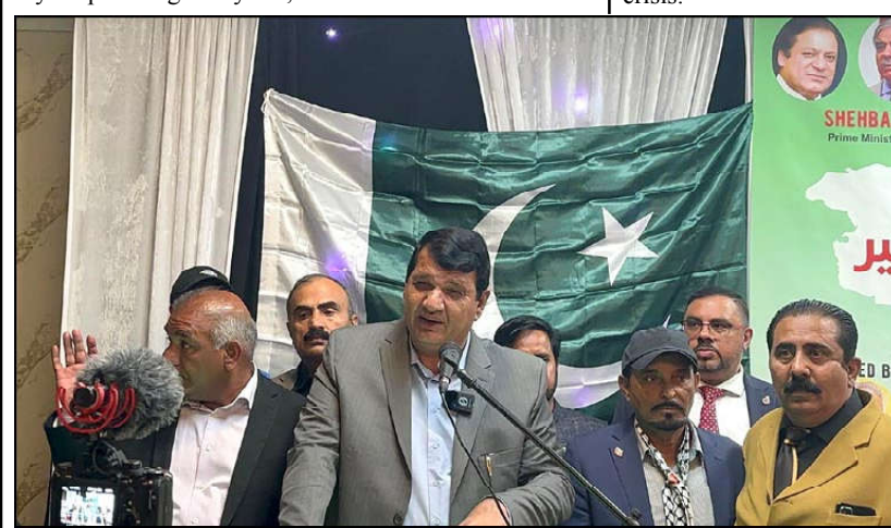
Federal Minister for Kashmir Affairs & Gilgit Baltistan and SAFRON, Engr. Amir Muqam addressing the Kashmiri diaspora in Toronto, Canada.