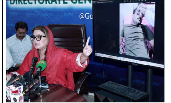
LAHORE: Punjab Information Minister Azma Bukhari talking to media persons at DGPR.

LAHORE (APP): Punjab Chief Minister Maryam Nawaz Sharif said on Sunday that reducing food waste was a religious and moral duty of all Pakistanis. In a message on the International Day of Awareness of Food Loss and Waste, she said: "Food waste is a global problem, which damages the economy and environment alike." She added, "It is depressing to note that millions of people around the world are suffering from hunger, while millions of tonnes of food is wasted globally." The chief minister said, "Pakistan is also suffering from food waste and shortage to some extent. Planning is needed to save resources from being wasted." Maryam Nawaz said, "Help the hungry people by reducing food waste" adding that "An effective awareness campaign is necessary to prevent food waste." She noted, "School nutrition programme in Punjab is a historic initiative to address malnutrition in children." The CM said, "Proportionate consumption of food is inevitable, highlight the value of food in your community." She hoped, "Together we can save the natural resources of Pakistan." The chief minister declared that reducing food waste was not only a moral and religious obligation but also essential for effective resource management.