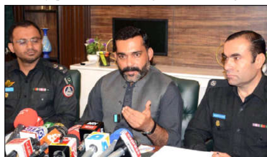
QUETTA: SSP Serious Crimes Investigation Wing, Zuhair Muhsin addressing a press conference.

MULTAN (INP): In a recent interview with a private TV Channel, Shahid Khaqan Abbasi, Chief of the Awam Pakistan Party, expressed serious concerns regarding the proposed constitutional amendment, revealing that none of the 450 members of parliament have read the draft. Abbasi highlighted the alarming trend of legislation being passed without thorough examination, questioning, "Show me a country where laws are passed without reading them?" Abbasi pointed out that the integrity of constitutional courts is at stake, urging transparency in the amendment process. "Why are you afraid of putting the constitutional amendment in front of the people?" he asked, emphasizing the need for public engagement in significant legal changes. During a party event, Abbasi reiterated his commitment to addressing pressing issues, including women's rights. He remarked, "Women constitute fifty percent of the