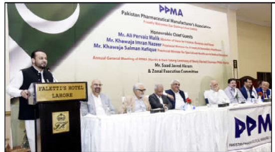
LAHORE: Punjab Minister for Health Imran Nazir addressing the oath taking ceremony of PPMA North Zone.