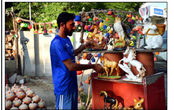
LAHORE: A vendor arranging and displaying the different kinds of clay made decoration items to attract the customers at his roadside setup.