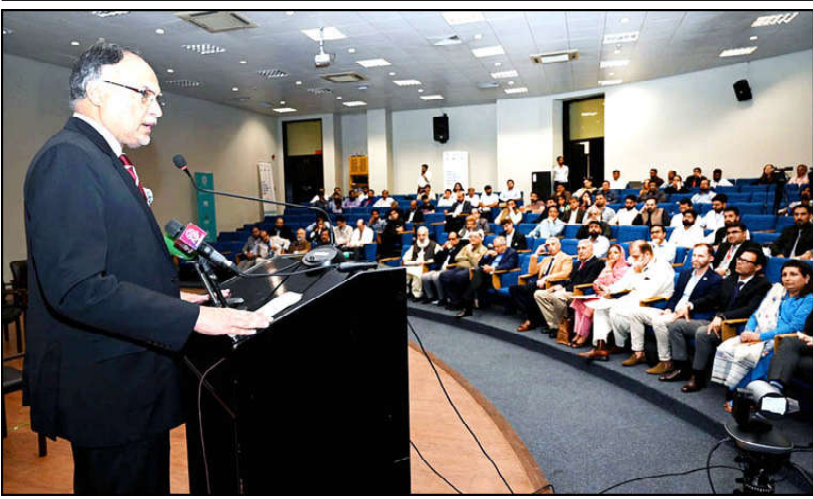
LAHORE: The Federal Minister for Planning, Development & Special Initiatives, Ahsan Iqbal Addressing to Asia's Energy Transition Summit at LUMS University.