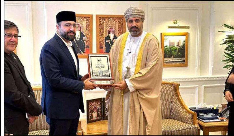
OMAN: Federal Minister for Overseas Pakistanis and Human Resource Development, Chaudhry Salik Hussain, receiving a souvenir from Oman's Minister of Labour, Dr Mahad bin Said bin Ali.