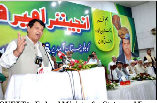
QUETTA: Federal Minister for States and Fron tier Regions (SAFRON) Amir Muqam addresses a ceremony in honoring the hard work and dedication of coal mine workers.

"China's success has shown that modernization does not have to come at the cost of losing one's cultural roots," he remarked