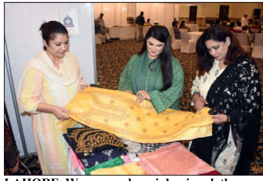
LAHORE: Women are busy is buying clothes on a stall at a local hotel, in the Provincial Capital.

to address challenges in the Acknowledging the tourism sector and explore opportunities in this avenues for exponential