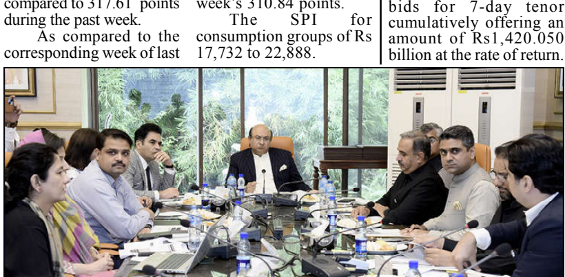
LAHORE: Punjab Finance Minister Mujtaba Shuja-ur-Rehman presides over the 8th meeting of Punjab Public Finance Management Reforms Steering Committee.

ARACHI (APP): The tate Bank of Pakistan (SBP) injected Rs1,589.5 billion in the market through reverse repo purchase Open Market Operation (OMO) on Friday. According to OMO results issued here, the SBP conducted Open Market Operation, Reverse Repo Purchase (Injection) on September 27, 2024 for 7-day and 28-day tenors and accepted 20 bids cumulatively amounting to Rs1,589.5 billion. The central bank received 14 bids for 7-day tenor