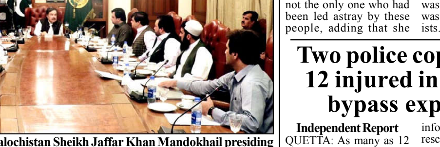
OUETTA: Governor Balochistan Sheikh Jaffar Khan Mandokhail presiding over annual meeting of Pakistan Red Crescent Society Balochistan

entire judiciary Imran Khan further commented that to cover up election fraud, they