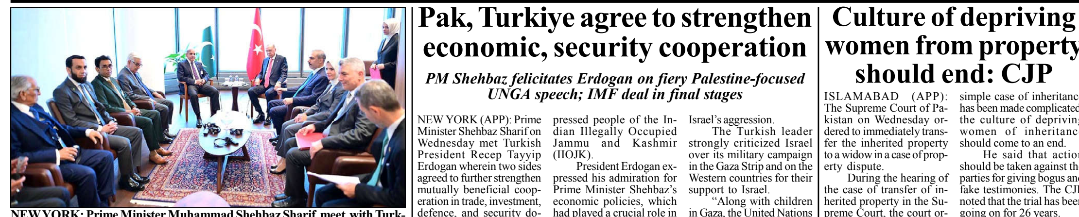
NEW YORK: Prime Minister Muhammad Shehbaz Sharif meet with Turkish President Recep Tayyip Erdogan on the sidelines of the 79th United Nations General Assembly Session.