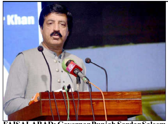
FAISALABAD: Governor Punjab Sardar Saleem Haidar Khan addresses during annual prize distribution ceremony of Aziz Fatima Medical & Dental College at a local hotel.