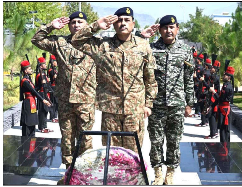
SOUTH WAZIRISTAN: Chief of Army Staff (COAS), General Asim Munir laying floral wreath at the Shuhada Monument during his visit to Wana in South Waziristan.