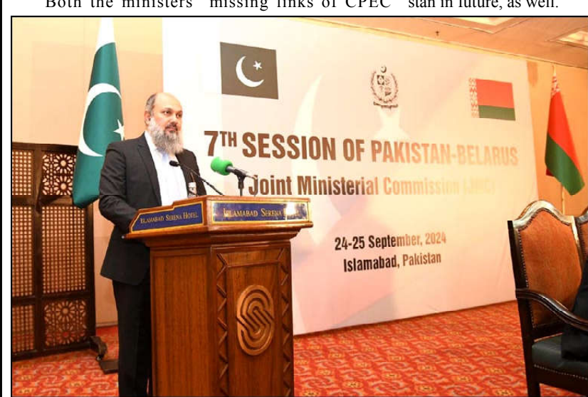
ISLAMABAD: Federal Minister for Commerce Jam Kamal Khan addressing to the 7th Session of Joint Ministerial Commission between Pakistan and Belarus.

projects will be completed which include Motorway from Sukkhar to Haider Abad and Karachi. Similarly, railway project of ML-1 Seaport to Multan and to Lahore, Karakrum Highway Thakot to Raikot and Highway of Kaghan Naran, Jhal Khand and Babusar Top will also be constructed. Abdul Aleem Khan thanked China for its cooperation and expressed hope that this International Conference on Transport will merge more benefits and development for Pakistan. Transport Minister of China Mr. Li Xiapeng assured full cooperation from his Department for Pakistan in future, as well.