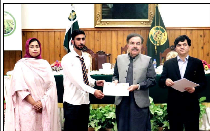
QUETTA: Governor Balochistan, Sheikh Jaffar Khan Mandokhail distributing certificates during a ceremony held under the auspices of Pakistan Oil Seed Department in end of the agri-based training

Means, why don't we opt such crops and orchards which require least water for cultivation or at least we can earn more money in less time.