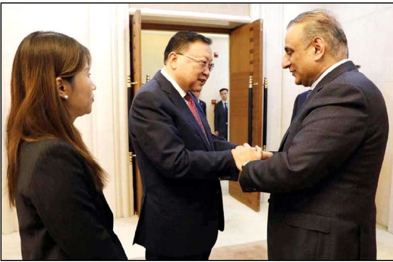
Federal Minister for Communications, Abdul Aleem Khan being received by Chinese Transport Minister Li Xiapeng in Beijing.