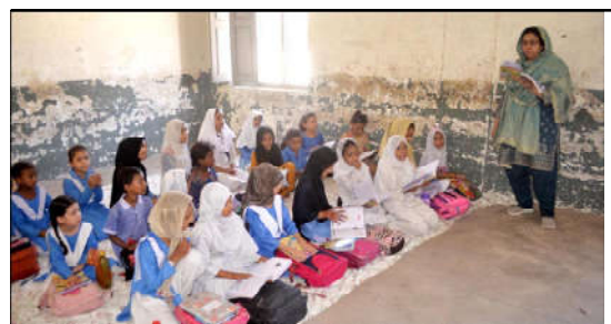
HYDERABAD: Student of Government Girls Urdu Primary School Hali road studying on the floor due to furniture not available.