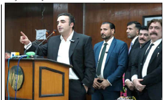
KARACHI: Peoples Party (PPP) Chairman, Bilawal Bhutto Zardari addresses to lawyers during ceremony organized by Sindh High Court Bar Association, held in Karachi.