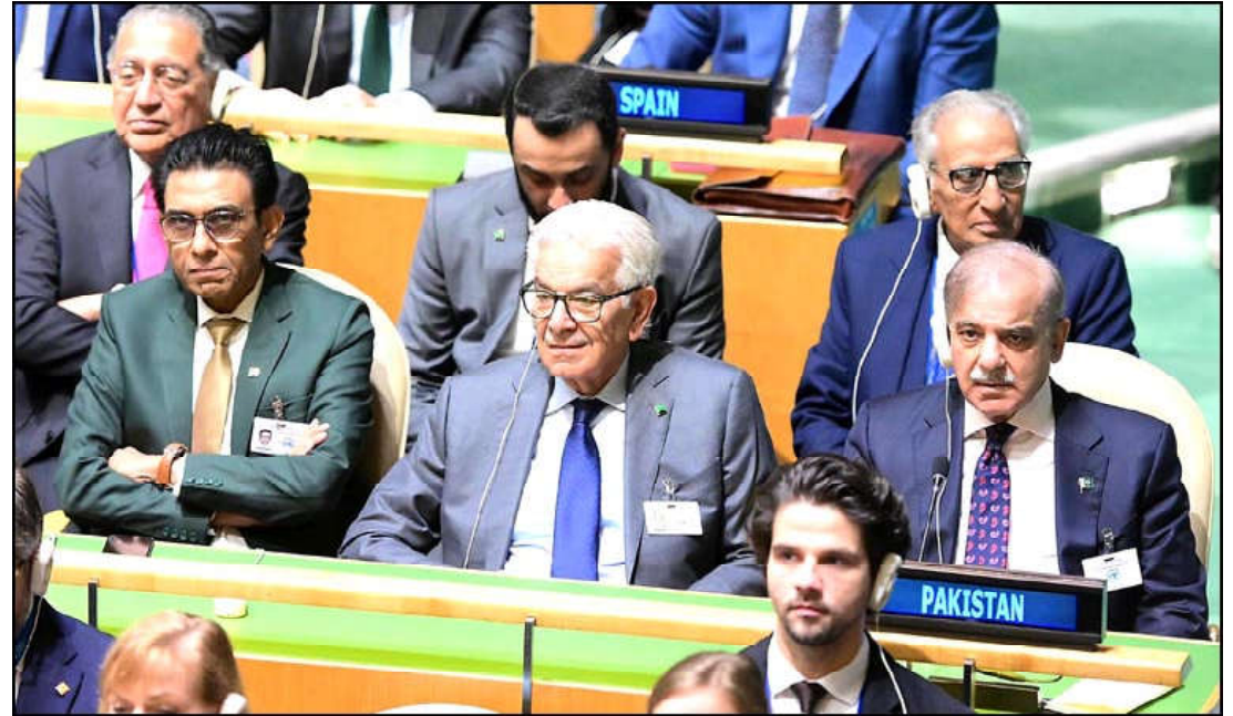
NEW YORK: Prime Minister Muhammad Shehbaz Sharif attending the inaugural session of United Nations General Assembly. New York.

Upon arrival, the COAS honoured the martyred by laying wreath at the Shuhada Monument. The COAS was warmly received at Wana by Commander Peshawar Corps.