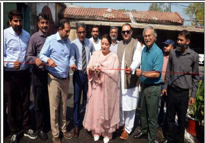
RAWALPINDI: Coordinator to Prime Minister on Climate Change, Romina Khurshid Alam inaugurating a solar energy project of a beverage company.

The minister highlighted the tremendous op