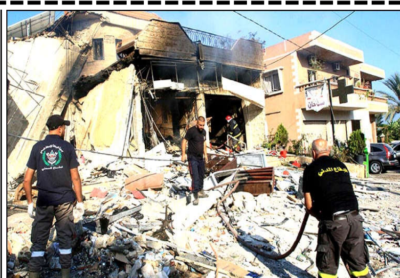
Rescuers inspect the debris at the site of an overnight Israeli strike on a pharmacy in the southern Lebanese village of Akbiyeh.

MEXICO CITY: Tropical Storm John unleashed heavy rains along Mexico's southern Pacific coast as it moved inland on Tuesday morning, threatening dangerous flooding and causing at least two deaths in a mudslide. Stretching across several Mexican states, the storm uprooted trees and electrical posts and damaged roofs, officials told reporters at a briefing on Tuesday. The affected area is home to both cargo ports and some of the country's top beach resorts. Around two-thirds of local power users were without electricity and phone service was also hit, officials said. Video posted on social media showed sheets of rain pummeling empty streets overnight near the large Lazaro Cardenas port.