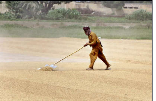
MULTAN: Labourer is busy spreading raw rice for drying in the field.