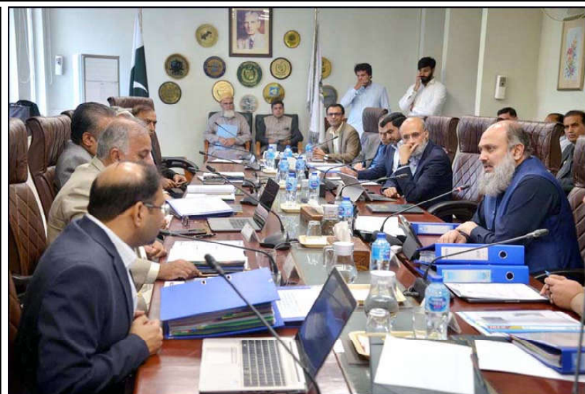
ISLAMABAD: Commerce Minister Jam Kamal Khan chairs the 85th EDF Board meeting, approving Rs. 8.5 billion for initiatives aimed at boosting Pakistan's textile, agriculture and global branding efforts.