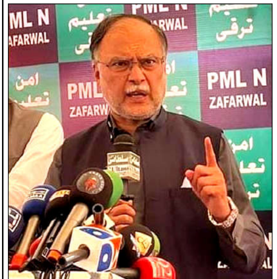
NAROWAL: Federal Minister for Planning and Development Ahsan Iqbal talking to media persons.

ISLAMABAD (INP): Pakistan's Oil and Gas Development Company has signed a Memorandum of Understanding with Chinese company CCDC for exploration of shale and tight gas potential in Pakistan. Minister for Petroleum Dr Musadik Malik, in Xi'an, Shaanxi Province, China, witnessed the MoU signing ceremony during the ongoing 8th Silk Road International Expo for Investment and Trade, according to a news release received here. The MoU highlights the commitment of both countries to developing Pakistan's shale and tight gas potential, aiming to address the country's energy needs through indigenous resources. The MoU underscores commitment of both the brotherly countries for the development of Shale and tight gas potential of