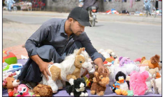
QUETTA: A vendor displaying stuffed toys to attract the customers at roadside near Sunday Bazaar at Joint road.

view that these IPPs have earned hundreds of times their profit, so the contracts should be reviewed. According to the sources, IPPs installed wind plants of the same capacity in Pakistan four times more expensive than in Bangladesh and Vietnam, and committed an over invoicing. Despite coal reserves in Pakistan, IPPs are dependent on imported fuels such as high-speed diesel and imported coal for power generation. Costly electricity is being generated due to these initiatives of IPPs. According to sources, IPPs did not generate as much electricity as they imported fuel and also received billions of rupees subsidy from the government.