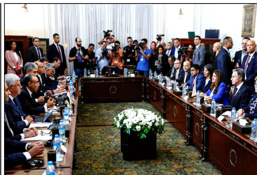
U.S. Secretary of State Antony Blinken attends a U.S.-Egypt strategic dialogue with Egypt's Foreign Minister Badr Abdelatty in Tahrir Palace in Cairo, Egypt.

had been agreed by all sides. Making progress involved long waits for messages to be passed between the parties that left time for incidents to disrupt the talks, Blinken said. "We've seen that in the intervening time, you might have an event, an incident - something that makes the process more difficult, that threatens to slow it, stop it, derail it - and anything of that nature, by definition, is probably not good in terms of achieving the result that we want, which is the ceasefire," Blinken said. He cited Hamas' execution of six Israeli hostages last month. He did not name Israel, which is believed to have targeted members of groups aligned against it in Lebanon, Syria and Iran that have set back the talks.