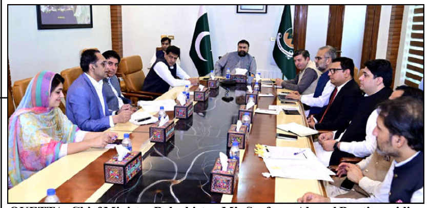
QUETTA: Chief Minister Balochistan Mir Sarfaraz Ahmed Bugti presiding over meeting regarding establishment of Private Special Economic Zone Turbat

Independent Report QUETTA: The Governor Balochistan, Jaffar Khan Mandokhail has stated that democracy is the most accepted and prioritized system at the international level despite the geographic and national limitations. He said that concept of democracy is deep rooted in implementation of the rights and authorities. In a statement issued here on Wednesday, the Governor said that there is priority of effective participation of all citizens, freedom of basic rights, freedom of expression and following the social justice in democracy. Therefore it is necessary to know that we can resolve the issues of people at local level by strengthening democratic system