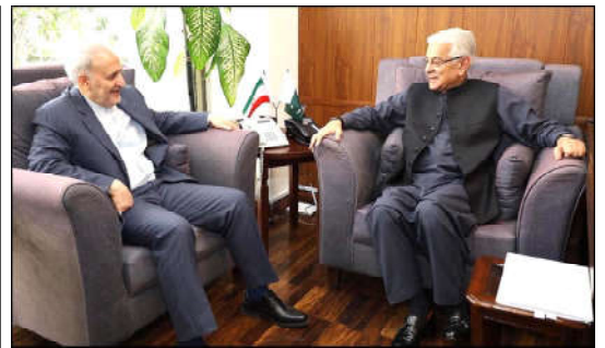
ISLAMABAD: Iranian Ambassador to Pakistan Dr. Reza Amiri Moghadam called on Federal Minister for Defence, Defence Production, and Aviation Khawaja Muhammad Asif.

He urged the nation to follow the teachings of Holy Prophet Muhammad (PBUH), emphasizing support for the vulnerable, prioritizing those struggling with poverty and hunger.