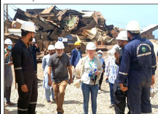
GADDANI: Team of IMO visiting Gaddani Ship Breaking Yard

ISLAMABAD: Jamiat Ulema-e-Islam Fazl (JUI-F) Chief Maulana Fazlur Rehman, who took the centre stage as both the government and the opposition sought his support, has completely rejected the draft of the "controversial" constitutional package, aimed at making changes to Pakistan's judicial and parliamentary systems. "The draft we were given was reviewed, and it was in no way acceptable," the veteran politician said while talking to journalists after attending a luncheon at Pakistan Tehreek-e-Insaf (PTI) leader Asad Qaiser's residence on Wednesday.