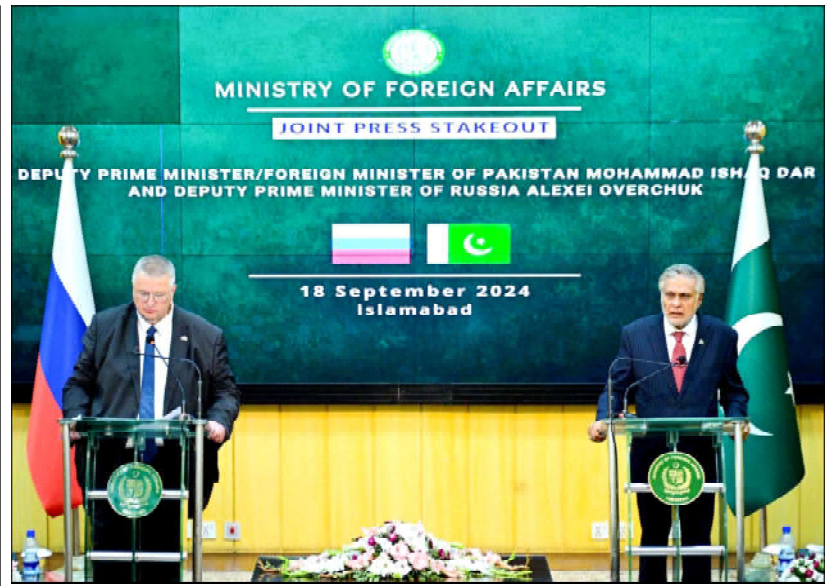
Deputy Prime Minister and Foreign Minister Senator Mohammad Ishaq Dar along with Deputy Prime Minister of Russia Alexei Overchuk addresses a joint press stakeout at the Ministry of Foreign Affairs, Islamabad

ernment would be asked to enhance subsistence allowance as well as provide other relief measures to the Kashmiri refugees. He further assured that Pakistan's social safety net would be extended to include 8,000 migrant families under the Benazir Income Support Programme. The delegation thanked the president for Pakistan's continued moral, political and diplomatic support for the Kashmiri people. They also commended the efforts and role of Pakistan Peoples Party Chairman Bilawal Bhutto, who strongly advocated the cause of the people of IIOJK at various fora during his tenure as the Foreign Minister of Pakistan.