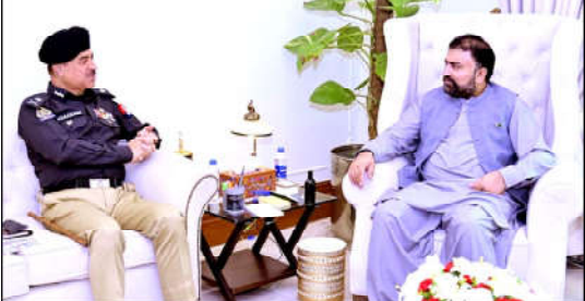
QUETTA: Inspector General of Police Balochistan Moazzam Jah Ansari meeting with Chief Minister Balochistan Mir Sarfaraz Ahmed Bugti

The ICJ advisory opinion is not binding but carries weight under international law and may weaken support for Israel. A General Assembly resolution also is not binding, but carries political weight. There is no veto power in the assembly.