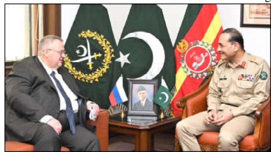
ISLAMABAD: Chief of Army Staff Syed Asim Munir has reiterated Pakistan's commitment to fostering

RAWALPINDI (APP): Chief of Army Staff Syed Asim Munir has reiterated Pakistan's commitment to fostering