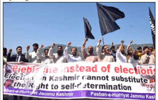
MUZAFFARABAD: Kashmiris shouting slogans at Azadi Chowk against the elections in Occupied Kashmir and demanding referendum.

Member KP inquired if even now too we don't accept PTI intra party election then we have powers to do what.