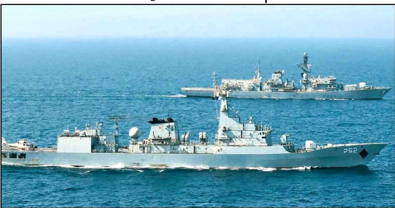
Pakistan Navy ship SHAMSHEER conducted passage exercise (PASSEX) with HMS LANCASTER during Regional Maritime Security Patrol.