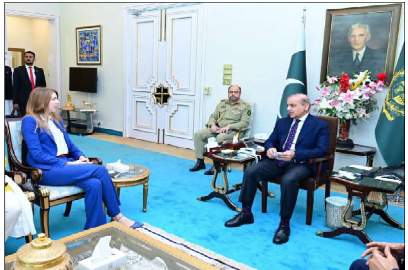
ISLAMABAD: British High Commissioner Jane Marriott meeting with Prime Minister Muhammad Shahbaz Sharif

foreign policy. Ishaq Dar noted that Pak-Russia relations have advanced significantly, with a strong desire to forge cooperation between the two countries. A step-by-step approach based on trust and mutual respect has placed the relationship on a positive trajectory. Both delegations engaged in in-depth discussions focused on bilateral relations, identifying potential areas for economic expansion. Specific areas of mutual interest were outlined, including trade, economic collaboration, cultural relations, and people-to-people contacts.