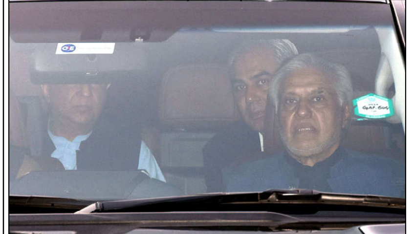
ISLAMABAD: Deputy Prime Minister Ishaq Dar, Interior Minister Mohsin Naqvi leaving Mulana Fazulrehman residence after the meeting with JUI(F) chief Mulana Fazul Rehman

This collaboration reflects a shared vision between the federal and provincial governments to uplift educational opportunities and streamline examination systems, ultimately benefiting the youth of Balochistan.