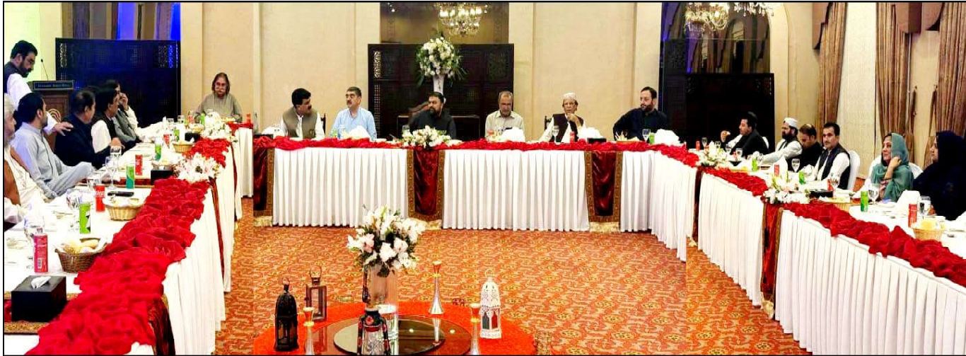
ISLAMABAD: MNAs, MPAs and Senators belong to Balochistan attending a dinner hosted by Chief Minister Balochistan Mir Sarfaraz Ahmed Bugti

Ph: 2841470/2841473 Vol: XIX No. 202, Rabi-ul-Awwal 11, 1446 AH Monday September 16, Pages 04, Price Rs.15