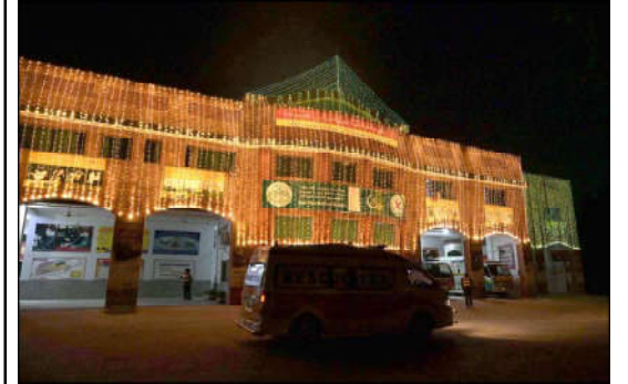
SARGODHA: A beautifully decorated Rescue 1122 building in celebration of 12th Rabi-ul-Awwal.