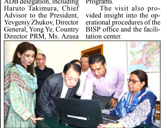
BISP's Director General acknowledged the role of international partners, including the ADB, in supporting various social protection programs in Pakistan.

At the Tehsil office, Taxila and Nasonuma Facilitation Center in Wah General Hospital, the ADB delegation interacted with beneficiaries and observed the registration process for the National Socio Economic Registry, the Taleemi Wazaif and Nasonuma Programs. The visit also provided insight into the operational procedures of the BISP office and the facilitation center.