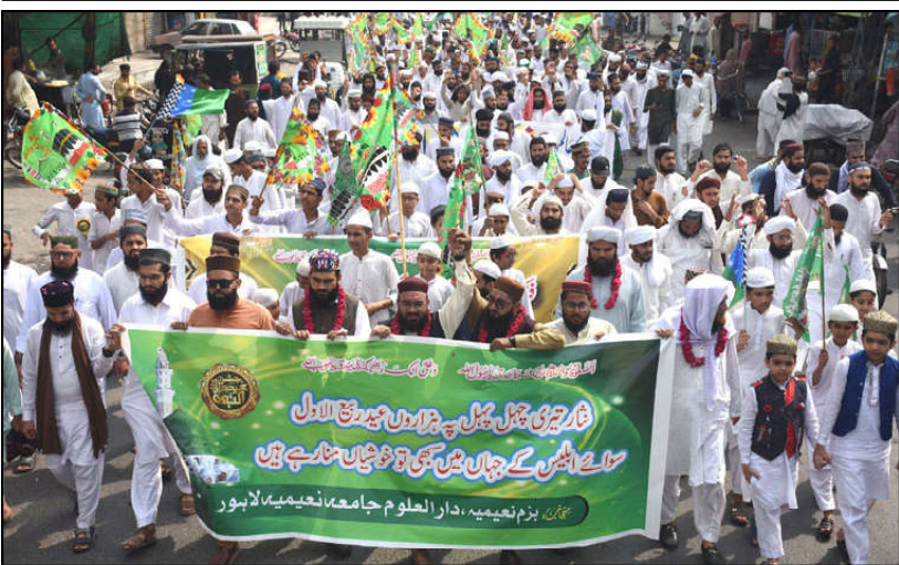
LAHORE: Participants of the Eid Milad-ul-Nabi rally passing through Queen Mary Road.