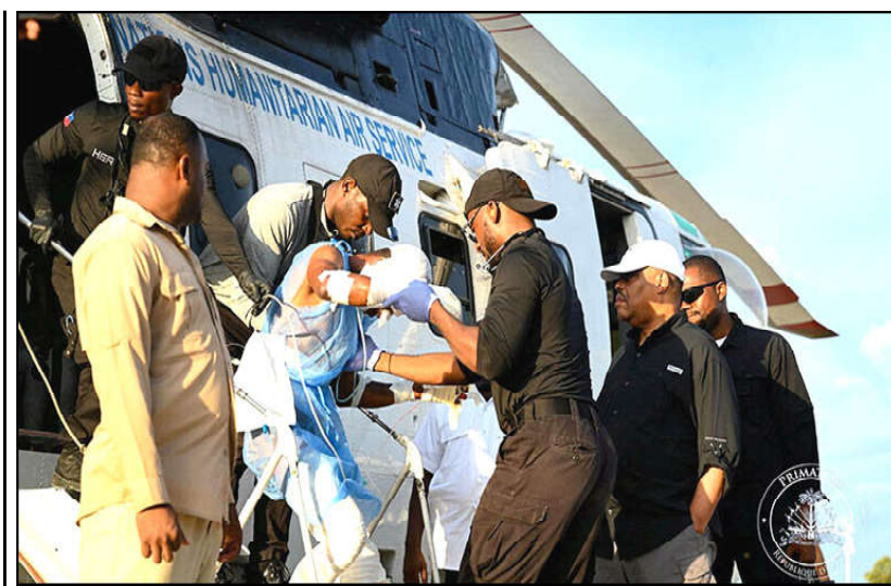
Haiti Prime Minister Garry Conille looks on, as an injured victim who was evacuated to receive medical care following a fuel truck explosion exits a helicopter, in Port-au-Prince, Haiti.

"And that would be it. A giant, grey, melted spot instead of 'the mother of Russian cities,'" he wrote on the Telegram messaging app, referring to Kyiv.