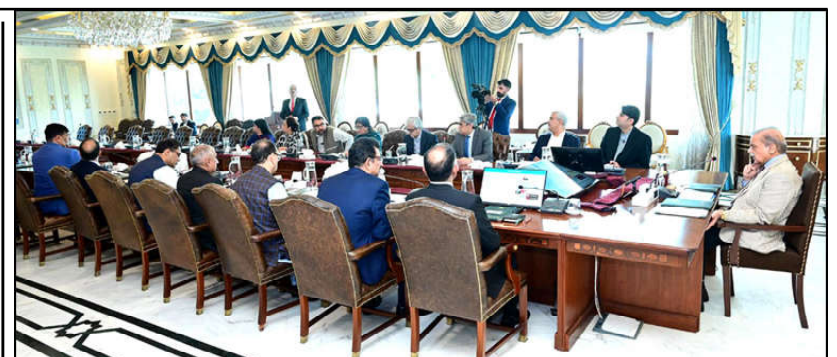
ISLAMABAD: Prime Minister Muhammad Shehbaz Sharif chairs a review meeting regarding Monkey Pox.

ISLAMABAD (APP): Minister for Information, Broadcasting, National Heritage and Culture Attaullah Tarar on Friday said the Federal Investigation Agency would probe into the handling of the PTI founder's social media accounts which were being used to create chaos and anarchy in the country, and undermining the national security. "He (the PTI founder) should be ashamed of undermining the national security, inciting people for anarchy and committing the sedition," said the minister while talking to the media. Tarar said the FIA had decided to investigate into the handling of the social media accounts of the jailed PTI founder. It would be ascertained that who is the handler of his social media accounts, and whether such posts were being made on his behalf or it was done on directives of someone else, he added. He said a botch attempt had been made to conspire against the sitting chief justice and heads of other institutions. Through these posts, he tried to mobilize the people against two major state institutions which is highly condemnable. The minister said this conspiracy is destined to fail as his accusations against the interior minister and others had nothing to do with the reality. The PTI founder had all the facilities like a presidential suit in the jail, but yet he still resorted to attack the state institutions, he said, adding nobody would be allowed to do so at any cost.