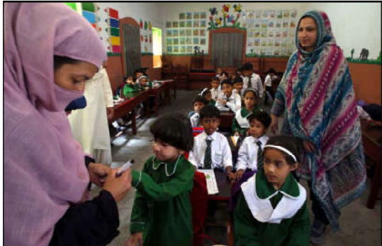
PESHAWAR: A health worker administers polio vaccine drops to a child during anti-polio immunization campaign, at a School in Peshawar.