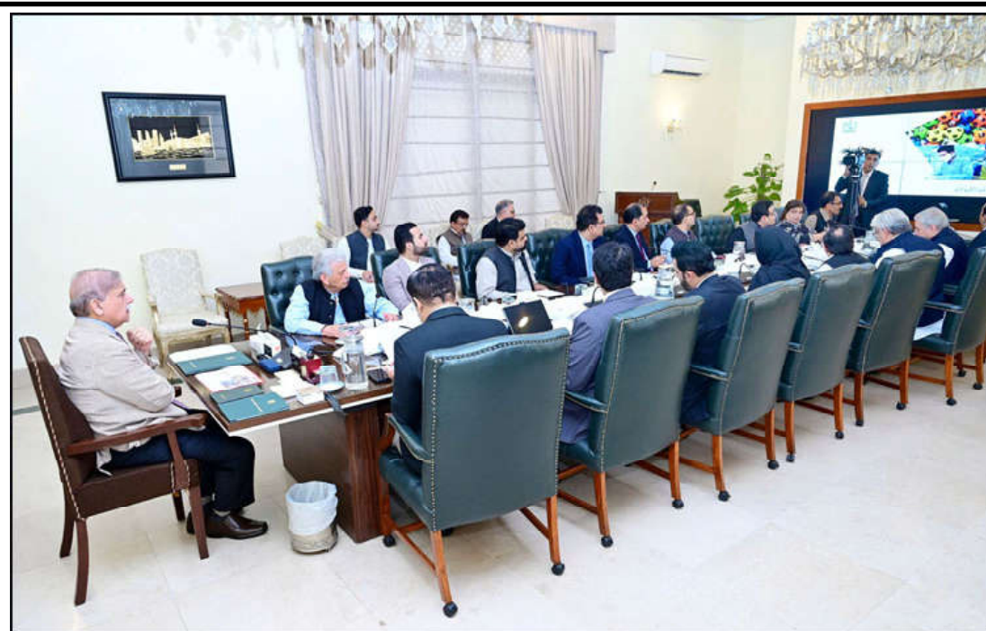
ISLAMABAD: Prime Minister Muhammad Shehbaz Sharif chairs the first session of the steering committee of Small and Medium Enterprises Development Authority (SMEDA).