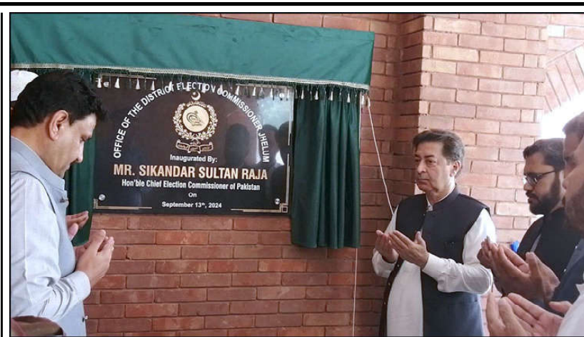
JEHLUM: Hon'ble Chief Election Commissioner Sikandar Sultan Raja offers dua following the curtain-raising and inauguration of the District Election Commission Office in the city.