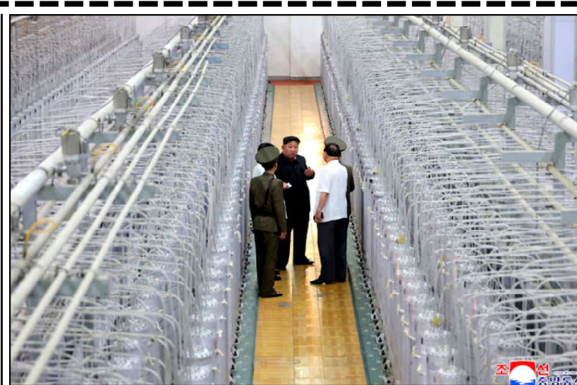
North Korean leader Kim Jong Un tours facilities during a visit to the Nuclear Weapons Institute and the production base of weapon-grade nuclear materials at an undisclosed location in North Korea.

increase the nuclear weapons for self-defense," a goal he has repeatedly stated in recent years. It said Kim ordered officials to push forward the introduction of a new type of centrifuge. Kim said North Korea needs greater defense and preemptive attack capabilities because "anti-(North Korea) nuclear threats perpetrated by the U.S. imperialists-led vassal forces have become more undisguised and crossed the red line," KCNA said. South Korea's Unification Ministry strongly condemned North Korea's push to boost its nuclear capability. A ministry statement said North Korea's "illegal" pursuit of nuclear weapons in defiance of U.N. prohibitions is a serious threat to international peace. It said North Korea must realize it cannot win anything with its nuclear program.