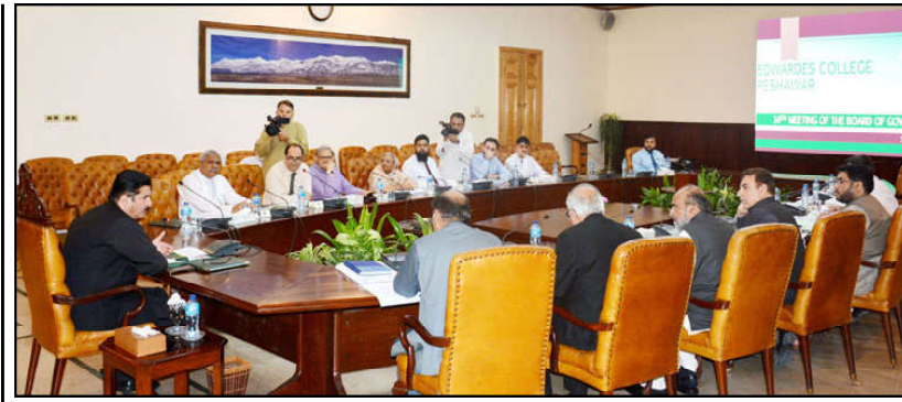
PESHAWAR: Governor Khyber Pakhtunkhwa Faisal Karim Kundi presides over the 14th BoGs meeting of Edwards College at Governor House.

offers loans for home construction. She also mentioned relief measures in electricity bills and the launch of Minority Cards. The CM stressed the importance of fieldwork to address public issues and the ongoing improvement in bureaucratic performance through a new KPI (key performance indicator) system. She urged her team to embrace their responsibilities in public service and announced plans to distribute sweets for Eid Milad-un-Nabi (Peace Be Upon Him). Senior Provincial Minister Murrum Aurangzeb, Information & Culture Minister Azma Zahid Bukhari, Provincial Ministers and Parliamentary Secretaries attended the meeting. Provincial Secretaries and other relevant officers were also present.