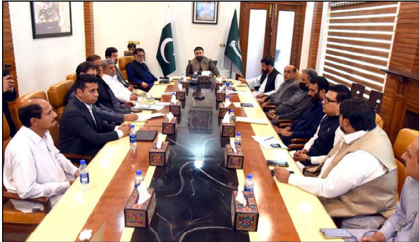
QUETTA: Balochistan Chief Minister Mir Sarfaraz Ahmed Bugti presiding over a meeting about the damages caused due to the recent monsoon rains in Naseerabad Division

Ph: 2841470/2841473 Vol: XIX No. 198, Rabi-ul-Awwal 06, 1446 AH Wednesday September 11, Pages 04, Price Rs. 15