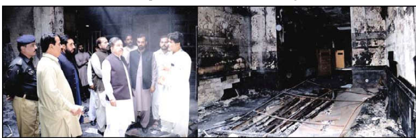
QUETTA: Governor Balochistan Sheikh Jaffar Khan Mandokhail visiting fire-hit Government Science College