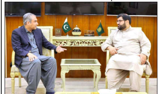
ISLAMABAD: Interior Minister Mohsin Naqvi in a meeting with President Awami National Party Senator Aimal Wali Khan.

Earlier, he expressed condolence over the death of uncle of Member Provincial Assembly, Asghar Khan Tareen and offered fateha for the departed soul.