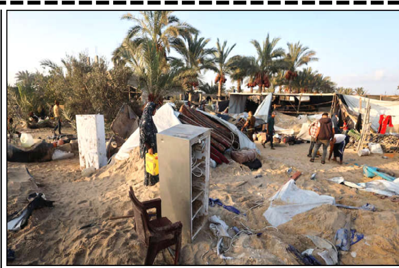
Palestinians inspect the site following Israeli strikes on a tent camp sheltering displaced people, amid the Israel-Hamas conflict, at the Al-Mawasi area in Khan Younis, in the southern Gaza Strip.

tion as we are seeing in Gaza in the last few months." The war has killed over 40,900 Palestinians, according to Gaza's Health Ministry. The ministry, part of Gaza's Hamas government, does not differentiate between fighters and civilians in its count though it says about half of the dead have been women and children. Israel says at least 17,000 militants are among the dead. The war has caused vast destruction and displaced around 90% of Gaza's population of 2.3 million people, often multiple times. Israel's U.N. Ambassador Danny Danon reacted to Guterres' comments saying, "It is disappointing to see the U.N. advocate for a cease-fire without mentioning the hostages and without condemning Hamas."