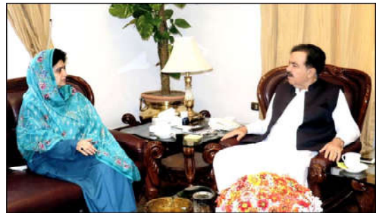
QUETTA: Provincial Education Minister Raheela Hameed Khan Durrani meeting with Governor Balochistan Sheikh Jaffar Khan Mandokhail