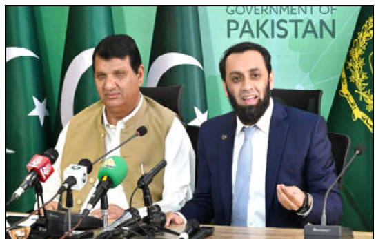
ISLAMABAD: Federal Minister for Information Ataulah Tarar along with Federal Minister for Kashmir Affairs and Saffron, Engineer Amir Maqam addresses important press conference at PTV Headquarters.