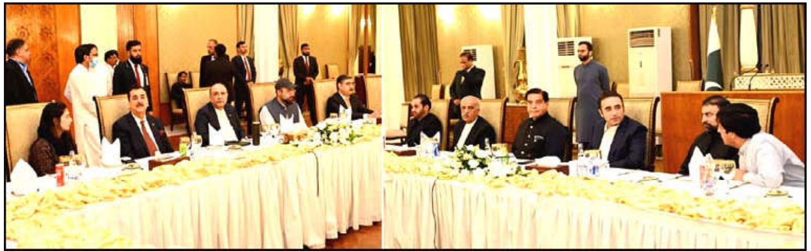
President Asif Ali Zardari hosted a dinner in honour of Parliamentarians belonging to Pakistan People's Party Parliamentarians (PPP), Awami National Party (ANP), Pakistan Muslim League-Q (PMLQ), and Istehkham-e-Pakistan Party (IPP), at Aiwan-e-Sadr

He urged the need to rise above partisan interests and committedly work for the welfare of the people, adding that he was against the politics of confrontation that harmed the country.