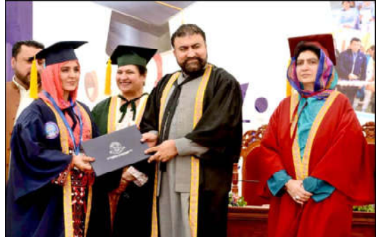
QUETTA: Balochistan Chief Minister Mir Sarfraz Ahmed Bugti and Education Minister Raheela Hameed Khan Durrani distributing certificates to girls during the 1st Convocation 2024 at Govt Girls Post Graduate College Quetta.

Taking a jibe at Gandapur, he said that the person, who had challenged a woman political leader (