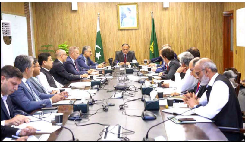
ISLAMABAD: Federal Minister for Planning, Development & Special Initiatives, Ahsan Iqbal, chairing the 4th meeting of the Policy and Strategy Committee (PSC) and the Oversight Board on Post-Flood Reconstruction Activities.