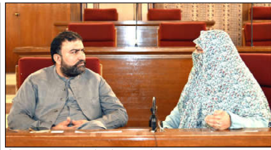
QUETTA: Provincial Advisor Dr. Rubaba Khan Buledi talking with Chief Minister Balochistan Mir Sarfaraz Bugti during Assembly session

the districts in Sindh, Balochistan and Khyber Pakhtunkhwa were declared disaster-stricken. The 2022 floods also exposed Pakistan's extreme vulnerability to climate change, despite the country contributing less than 1 percent of global greenhouse gas emissions in 2018, and consistently ranking among the top 10 countries most affected by climate change. In response to the 2022 floods, the Ministry of Planning developed the Pakistan's strategic policy, known as the Resilient, Rehabilitation, and Reconstruction Framework (4RF). This framework is designed to guide the country's recovery, rehabilitation, and reconstruction efforts. The 4RF outlines four key objectives: enhancing governance and institutional capacity to restore lives and livelihoods, reviving economic opportunities,