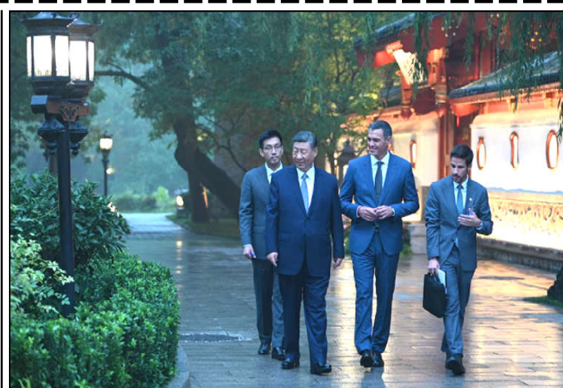
Spain's Prime Minister Pedro Sanchez and China's President Xi Jinping meet at Diaoyutai State Guesthouse in Beijing, China.

events Spain would work for a negotiated consensus to the EV dispute within the World Trade Organization and that a "trade war would benefit no one," a government source said. Spain in 2023 exported $1.5 billion worth of the pork products that China will investigate, Chinese customs data showed, dwarfing the outbound shipments from second- and third-ranking the Netherlands and Denmark. Spain also sold just under $50 million worth of targeted dairy products to China last year. But in a promising sign for Spain's pork producers, a separate source with direct access to Xi's meeting with Sanchez said the two leaders had "found harmony and understanding," when asked about possible curbs on Spain's outbound pork shipments.