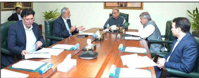
ISLAMABAD: Federal Minister for Communications, Privatization & Board of Investment Abdul Aleem Khan presides over high level meeting on NA.

the the State is committed to the protection, empowerment and development of under-represented communities including religious minorities to ensure their participation in economic, political and public representation. Sanjay Kumar said that the federal and provincial governments have allocated 5% quota for minorities in the jobs of all government and non-government organizations but the 5 percent quota reserved for the minorities in the provincial departments was not being implemented due to which the minorities were being deeply worried. Therefore, this house recommends the government to take steps to implement the quota allocated for minorities, he said. Later, the joint resolution was unanimously approved by law makers.