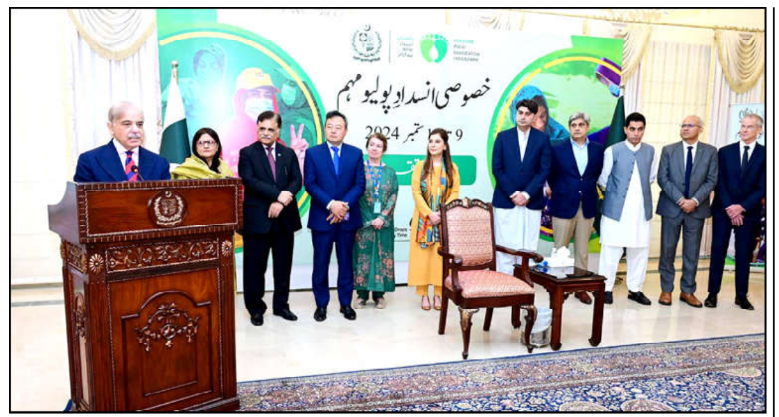
ISLAMABAD: Prime Minister Muhammad Shehbaz Sharif addressing the inaugural ceremony of countrywide Special Anti-Polio Campaign.

Ph: 2841470/2841473 Vol: XIX No. 196, Rabi-ul-Awwal 04, 1446 AH Monday September 09, Pages 04, Price Rs.15