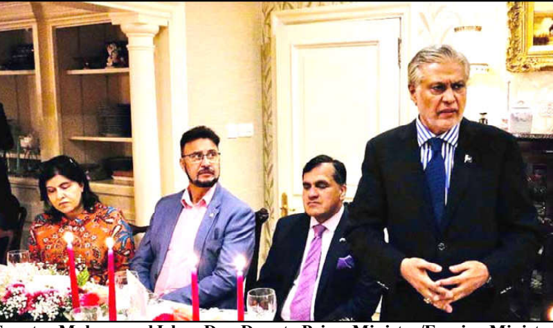
Senator Mohammad Ishaq Dar, Deputy Prime Minister/Foreign Minister interacts with British Parliamentarians of Pakistani origin in London.

The prime minister assured that the polio eradication campaign is in capable hands, being led by expert teams, and expressed optimism that the federal government's joint efforts with the provinces will ultimately lead to the disease's eradication.