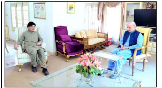
ISLAMABAD: Prime Minister Muhammad Shehbaz Sharif offering condolences to Chaudhary Nisar Ali Khan on the demise of his sister.

He said that protection of every Pakistani's life and property is the responsibility of the state. He further said that the scholars and spiritual leaders should guide the people and raise their voices against those who take up arms against the state.