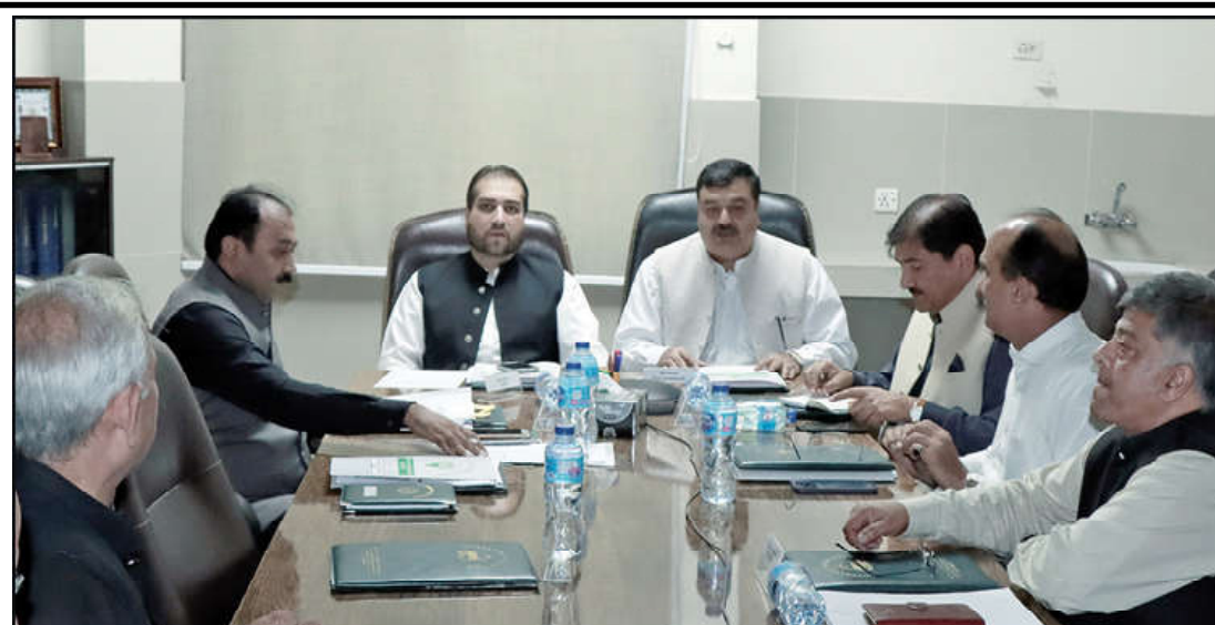
LAHORE: Punjab Minister for Livestock and Agriculture Syed Ashiq Hussain Kirmani presides over the meeting to review initiative taken for development of Livestock sector.

in key areas. In line with its mandate to fight poverty and improve lives and livelihoods, ADB will deepen its focus on five of the region's most pressing development issues: climate action, private sector development, regional cooperation and public goods, digital transformation, and resilience and empowerment. This enhanced focus will guide the allocation of staff and resources for greatest impact.