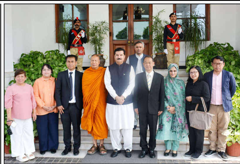
PESHAWAR: Governor Khyber Pakhtunkhwa Faisal Karim Kundi in a group photo with Thai delegation at Governor House.

Gandhara Buddhist exhibition and symposium will be held in Peshawar and Swat. Governor Kundi advocated for art and culture exchanges between Thailand and Khyber Pakhtunkhwa, particularly focusing on Buddhist civilization. The Thai delegation shared gifts and assured fully support for cultural exchange. They said that Pakistan is rich of Buddhism civilization. There is good diplomatic relations between the two countries and we want to develop it more. Meanwhile, Farrukh Toirov, Deputy Representative of the Food and Agriculture Organization (FAO) in Pakistan called on the Governor.