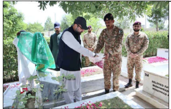
RAWALPINDI: Federal Minister for Overseas Pakistanis and Human Resource Development Chaudhry Salik Hussain visited Army Graveyard to pay tribute to the unwavering bravery and ultimate sacrifices of armed forces in Racecourse.