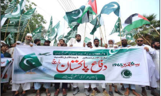
PESHAWAR: Pakistan Markazi Muslim League workers held a rally in connection with Pakistan Defence Day in front of the Press Club.