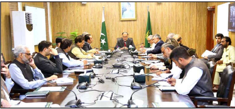
RAWALPINDI: Federal Minister for Planning, Development, and Special Initiatives Ahsan Iqbal chairs the first meeting of the Planning Commission's Policy Board.