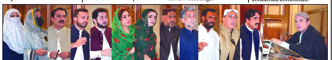
QUETTA: Provincial Ministers, Parliamentary Secretaries and MPs expressing their views on point of order during Balochistan Assembly session