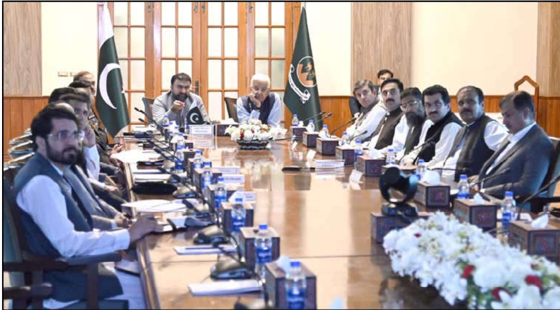
QUETTA: Federal Defense Minister Khawaja Asif and Chief Minister Balochistan Mir Sarfaraz Ahmed Bugti presiding over a meeting regarding law and order

Ph: 2841470/2841473 Vol: XIX No. 195, Rabi-ul-Awwal 02, 1446 AH Saturday September 07, Pages 04, Price Rs.15