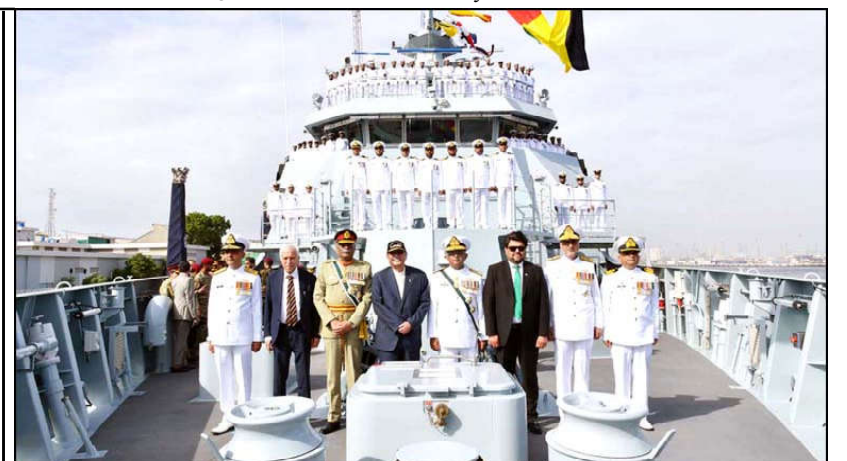
KARACHI: President Asif Ali Zardari in a group photo with senior military officials and crew of Pakistan Navy Ship Hunain during its induction ceremony.