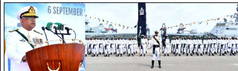
Chief of the Naval Staff Admiral Naveed Ashraf addressing the audience at the Induction Ceremony of PNS BABUR and PNS HUNAIN held at PN Dockyard, Karachi.

He said that if government members didn't turn up in the session next time, then we would pinpoint towards quorum.