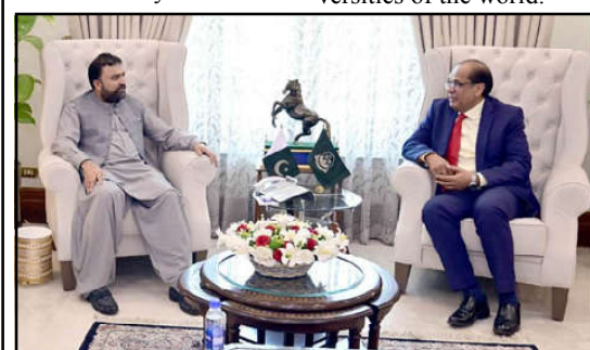
QUETTA: Deputy Chairman NAB Sohail Nasir meeting with Chief Minister Balochistan Mir Sarfaraz Ahmed Bugti

ISLAMABAD (APP): The National Assembly on Friday passed the amendment in the Elections Act, 2017 [The Elections (Amendment) Bill, 2024]. The bill was moved by the Federal Minister for Parliamentary Affairs Azam Nazeer Tarar. The bill had already been passed by the Senate. While briefing the lawmakers, he said, the Election Commission of Pakistan (ECP) had requested to amend Section 232 of the Elections Act, 2017, and to remove the acronym FATA, following the merger of FATA into Khyber Pakhtunkhwa.