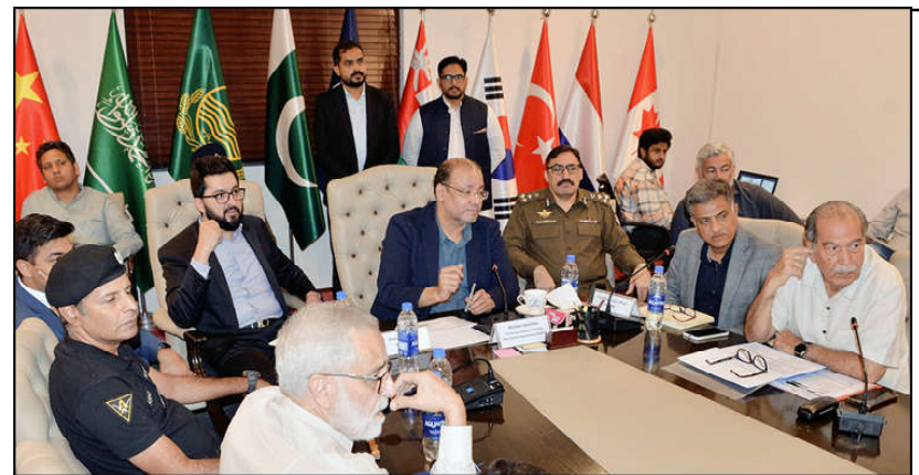
LAHORE: Punjab Minister for Industries and Commerce Chaudhary Shafay Hussain presides over the meeting of Industrialists.