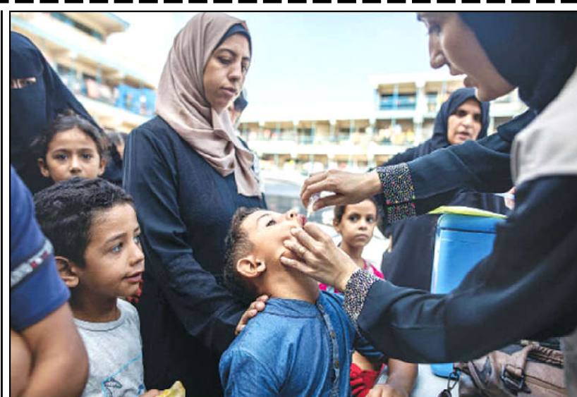
GAZASTRIP: A child receives vaccination drops at a makeshift camp in a school at Khan Yunis for people displaced by the Israeli aggression.