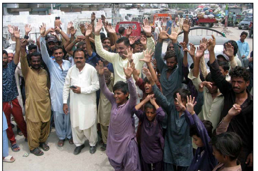
HYDERABAD: Members of All Pakistan Marble Association block road as they are holding protest demonstration against prolong electricity load shedding and change the electric transformer in their area, at Maki Shah road in Hyderabad.