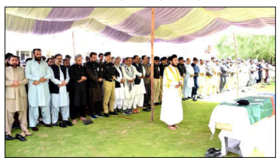
QUETTA: Inspector General of Police, Balochistan is Moazzam Jah Ansari, and other offering funeral prayer of Sub-inspector who lost their life in last high firing incident.

Government, also expressed resolve to right-size different ministries and autonomous bodies to bring down the size of federal government. He said six ministries have been given two weeks to prepare implementation plan for rightsizing, keeping in view their employees, resources, properties and litigation matters. "Once the programme is executed, other ministries would be taken for the same process." He said, ministries and autonomous bodies were given opportunity to share their performance and justify what they have contributed in national economy. He said, the government would need to bring legislative changes in Civil Servant Act 1973 with the help of coalition partners.