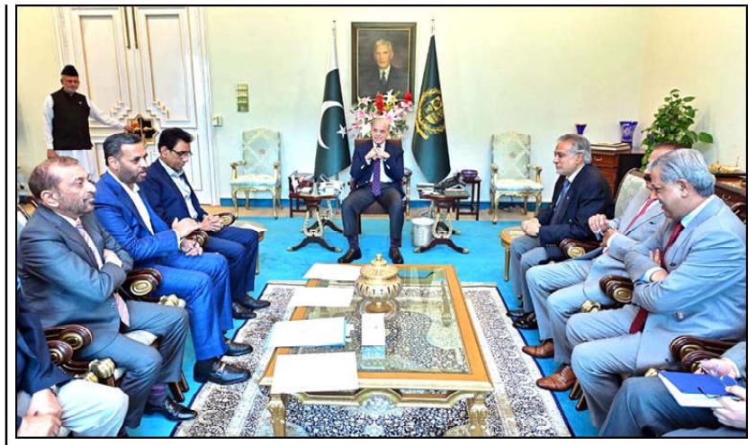
ISLAMABAD: A delegation of MQM (P) call on Prime Minister Muhammad Shehbaz Sharif.

He highlighted the significance of the forum in