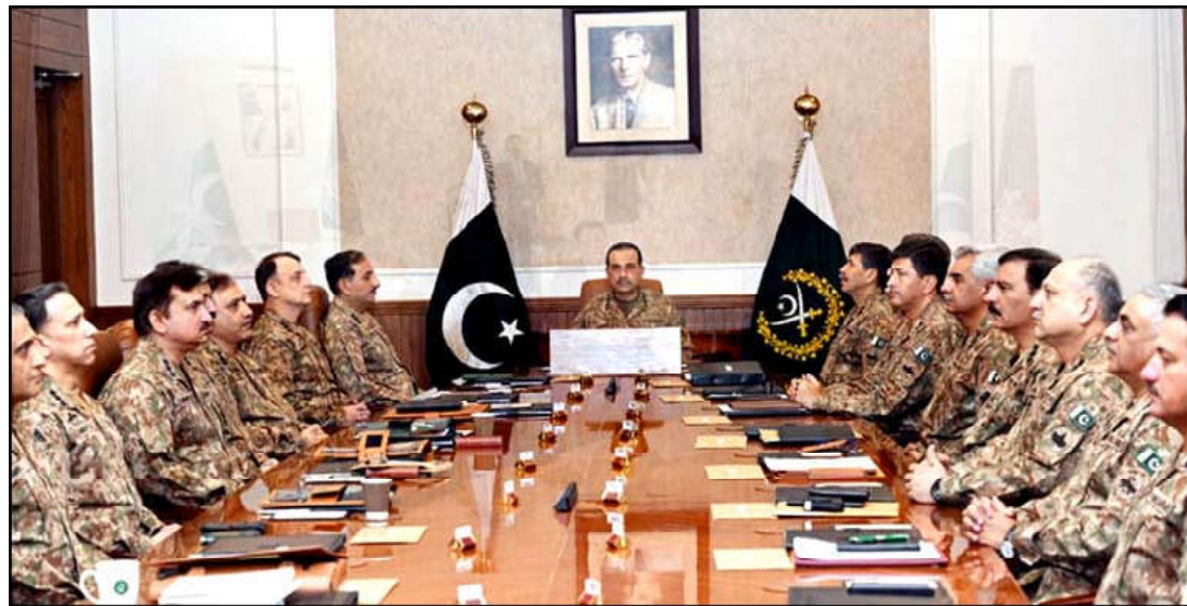
RAWALPINDI: Chief of the Army Staff General Syed Asim Munir presiding over Corps Commanders' Conference.

He said that if restaurants are built everywhere in the National Park area, then Islamabad may be affected by landslides.