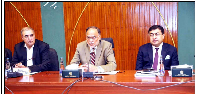
ISLAMABAD: The Central Development Working Party (CDWP) has approved 8 development projects worth of Rs. 144.3 billion during its meeting chaired by Minister PDSI & Deputy Chairman Planning Commission Ahsan Iqbal.

He assured the delegation that the resolution of the issues confronting Karachi city was among the government's priorities for it being the most important one and a backbone of the national economy.