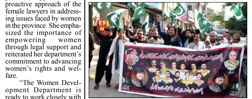
QUETTA: Leaders and members of Pakistan Peace Forces are holding protest demonstration to express solidarity with Pakistan Army armed forces and to condemn Terrorism in Balochistan, held at Quetta press club.

The PDMA official confirmed that 11 Balochistan districts have been declared calamity-hit as of yet, where the authority's aid efforts were under way. Mengal further said that in view of alerts by the Pakistan Meteorological Department (PMD), holidays of PDMA and other government employees.