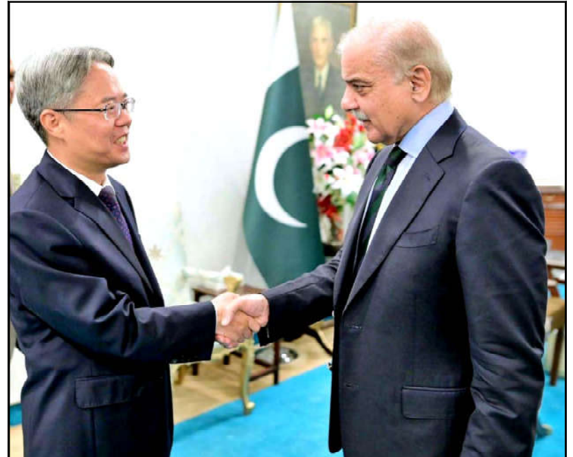
ISLAMABAD: Chinese Ambassador to Pakistan H.E. Jiang Zaidong calls on Prime Minister Muhammad Shehbaz Sharif.

He credited the economic team for achieving the lowest inflation rate in the last three years, said a press release issued by Prime Minister's Office.