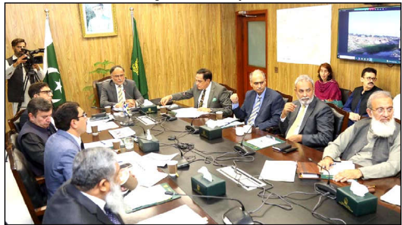
ISLAMABAD: Federal Minister for Planning Development & Special Initiatives Prof. Ahsan Iqbal chairing a meeting to review the progress of Public Sector Development Programme (PSDP) projects in Balochistan.

I have never heard any one else than Khawaja Asif for chiding army, If May 9 has to be investigated then judicial commission be constituted.