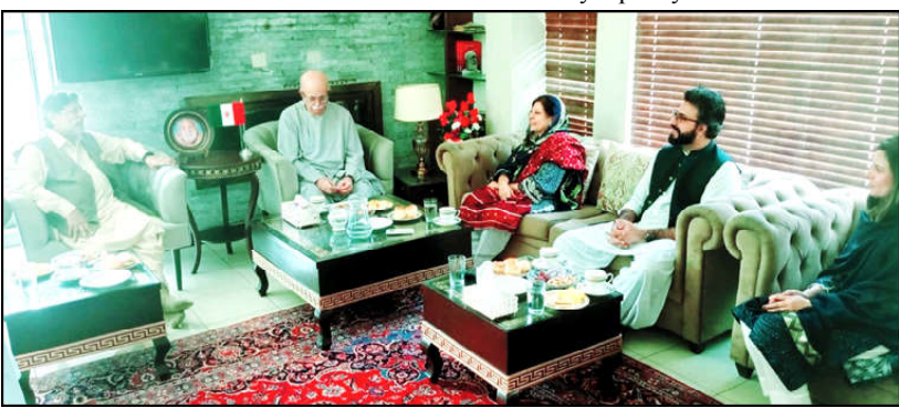
ISLAMABAD: Former caretaker Prime Minister Mian Muhammad Soomro along with his family meeting with Chairman PkMAP and Chairman Tehreek Tahafuz-e-Ain Pakistan Mahmood Khan Achakzai