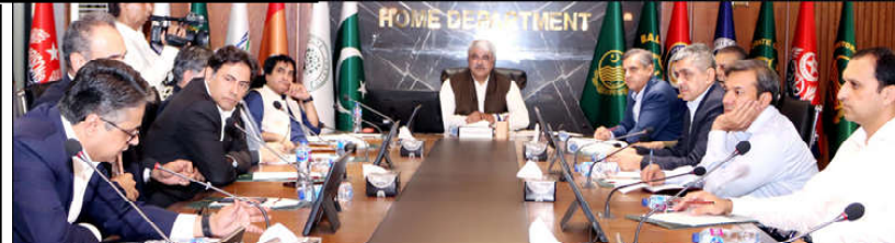
LAHORE: Provincial Health Minister and Chairman of the Cabinet Committee for Law and Order Khawaja Salman Rafique chairs 12 th Law and Order meeting at Home Department.

Rafique emphasized that foolproof security measures will be implemented for the by-elections scheduled for September 12 in Rahim Yar Khan. "Approval has been granted to deploy three companies of the Army and Rangers in the area. Additionally, extraordinary security preparations are in place for the cricket series with Bangladesh. Efforts will be relentless in maintaining peace and order in Punjab. Those disrupting public order will be dealt with firmly, and operations will persist until the last terrorist in the Kacha area is eliminated."