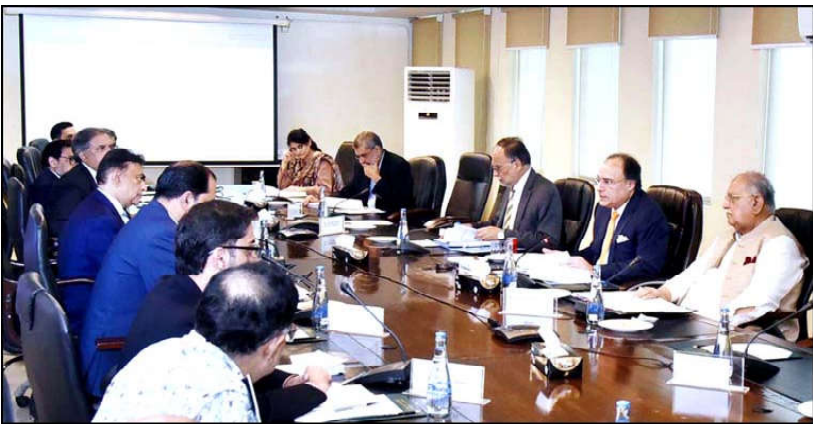
ISLAMABAD: Federal Minister for Finance and Revenue, Senator Muhammad Aurangzeb chairing a meeting of CCoSOEs at the Finance Division.