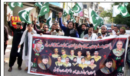
QUETTA: Leaders and members of Pakistan Peace Forces are holding protest demonstration to express solidarity with Pakistan Army armed forces and to condemn Terrorism in Balochistan, held at Quetta press club.

The deceased include 19 children, five of whom died in three separate incidents on Monday, Mengal said. The PDMA official said a new spell of rain entered Balochistan a day ago and was expected to continue till tonight in 22 districts. Relief and rescue efforts were under way in the province, he added.