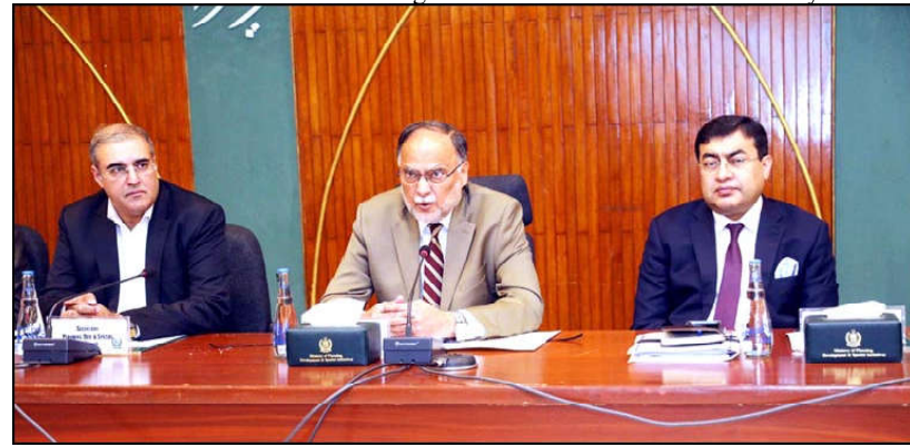
ISLAMABAD: The Central Development Working Party (CDWP) has approved 8 development projects worth of Rs. 144.3 billion during its meeting chaired by Minister PDSI & Deputy Chairman Planning Commission Ahsan Iqbal.