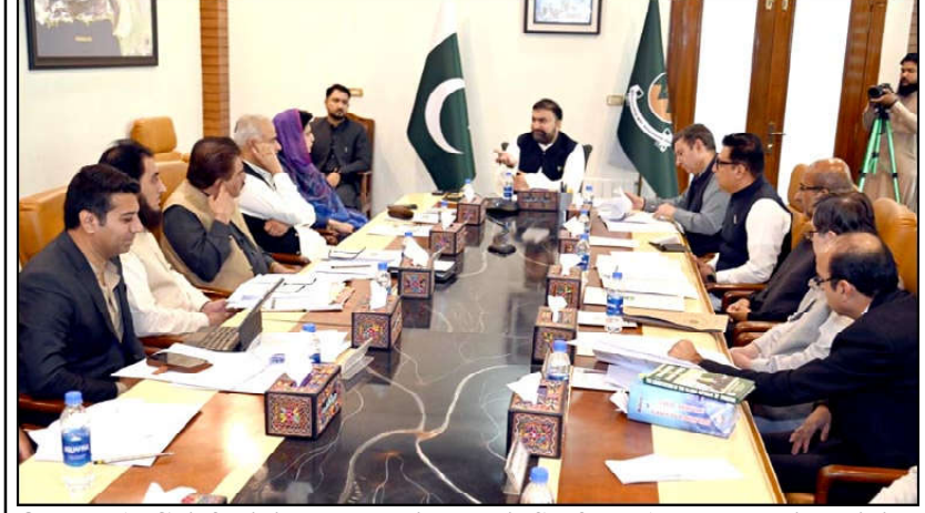
QUETTA: Chief Minister Balochistan Mir Sarfaraz Ahmed Bugti presiding over a meeting regarding appointment of teachers and reforms in Education Department

They forum also okayed four projects titled "Establishment of National Center of Artificial Intelligence (Revisited)" worth Rs1854.446 million.