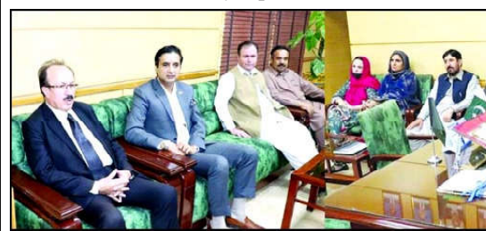
QUETTA: Commissioner Quetta Division Hamza Shafqaat meeting with Provincial Ombudsman Balochistan Nazam Muhammad Baloch

The IMF has emphasized that subsidies in the energy sector, including electricity and gas, are not permissible under the current agreement with Pakistan. The financial institution has demanded that all such subsidies be withdrawn by September.