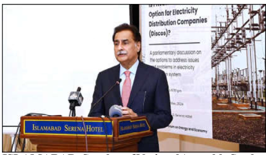
ISLAMABAD: Speaker of National Assembly Sardar Ayaz Sadiq addressing the participants of the Seminar on "Parliamentary consultation on strategic options for electricity distribution system in Pakistan."

He said that if restaurants are built everywhere in the National Park area, then Islamabad may be affected by landslides.