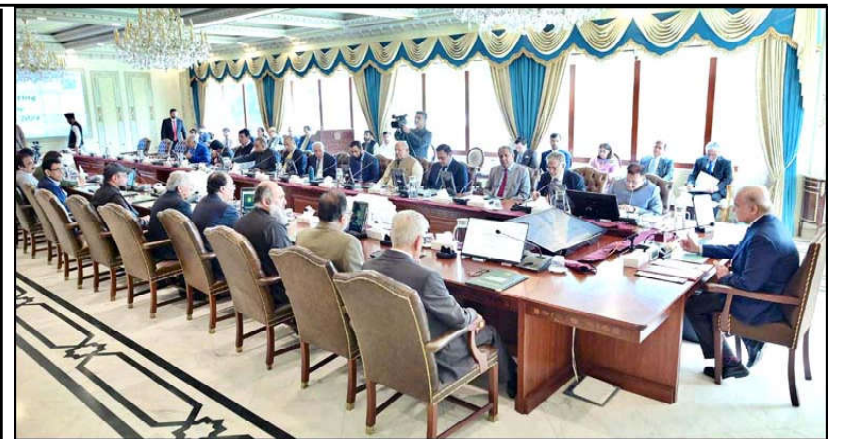
ISLAMABAD: Prime Minister Muhammad Shehbaz Sharif chairs a meeting of the Federal Cabinet.

65000 voters will become displeased with me. But I apologize.