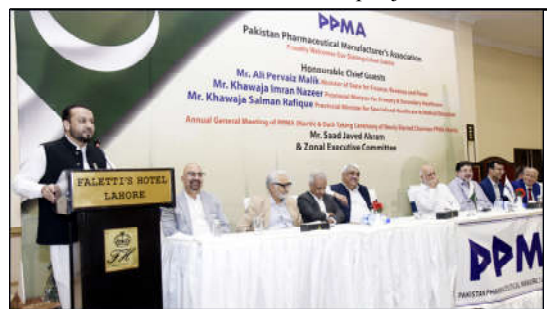
LAHORE: Punjab Minister for Health Imran Nazir addressing the oath taking ceremony of PPMA North Zone.