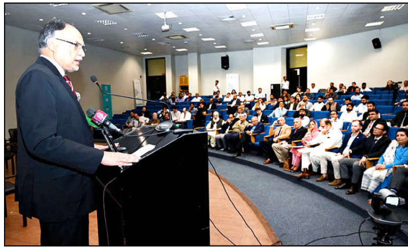
LAHORE: The Federal Minister for Planning, Development & Special Initiatives, Ahsan Iqbal Addressing to Asia's Energy Transition Summit at LUMS University.