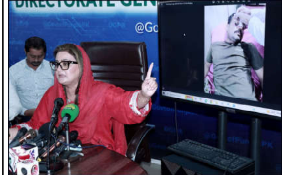
LAHORE: Punjab Information Minister Azma Bukhari talking to media persons at DGPR.

LAHORE (APP): Punjab Chief Minister Maryam Nawaz Sharif said on Sunday that reducing food waste was a religious and moral duty of all Pakistanis. In a message on the International Day of Awareness of Food Loss and Waste, she said: "Food waste is a global problem, which damages the economy and environment alike." She added, "It is depressing to note that millions of people around the world are suffering from hunger, while millions of tonnes of food is wasted globally." The chief minister said, "Pakistan is also suffering from food waste and shortage to some extent. Planning is needed to save resources from being wasted."