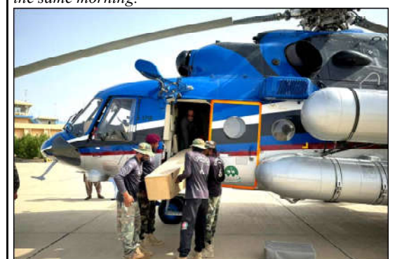
It may be mentioned here that seven labourers were gunned down by unknown armed assailants in a house located in Khudabadan area of Panjgur.