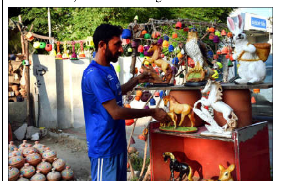
LAHORE: A vendor arranging and displaying the different kinds of clay made decoration items to attract the customers at his roadside setup.