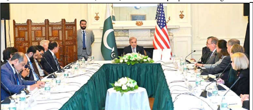
NEW YORK: Prime Minister Muhammad Shehbaz Sharif meets with a delegation of the US-Pakistan Business Council on the sidelines of 79th session of the United Nations General Assembly.

The IMF's Executive Board on Wednesday approved a new $7 billion, 37-month loan agreement for Pakistan that requires "sound policies and reforms" to strengthen macroeconomic stability. The approval releases an immediate $1 billion disbursement to Islamabad. The crisis-wracked South Asian country has had 22 previous IMF bailout programs since 1958. Porter said Pakistan has staged a "really remarkable" economic turnaround since mid-2023, with inflation down dramatically, stable exchange rates and foreign reserves that have more than doubled. "So what we've seen is the benefits of undertaking good policies," Porter said, adding that the challenge now was to build stronger growth.