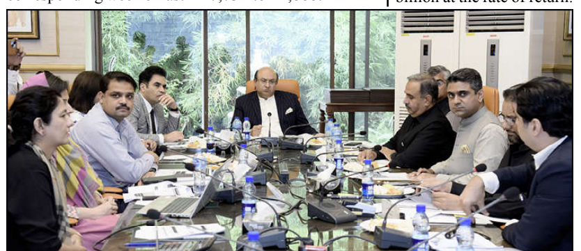
LAHORE: Punjab Finance Minister Mujtaba Shuja-ur-Rehman presides over the 8th meeting of Punjab Public Finance Management Reforms Steering Committee.

KARACHI (APP): The State Bank of Pakistan (SBP) injected Rs1,589.5 billion in the market through reverse repo purchase Open Market Operation (OMO) on Friday. According to OMO results issued here, the SBP conducted Open Market Operation, Reverse Repo Purchase (Injection) on September 27, 2024 for 7-day and 28-day tenors and accepted 20 bids cumulatively amounting to Rs1,589.5 billion. The central bank received 14 bids for 7-day tenor cumulatively offering an amount of Rs1,420.05 billion at the rate of return.