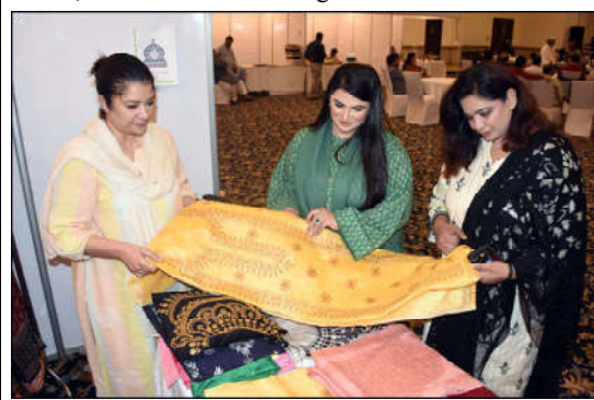
LAHORE: Women are busy buying clothes on a stall at a local hotel, in the Provincial Capital.

The gathering sought to address challenges in the tourism sector and explore avenues for exponential growth.