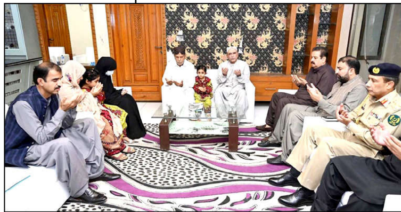
KARACHI: President Asif Ali Zardari offering condolences to the family members of Deputy Commissioner Zakir Baloch Shaheed. Chief Minister of Balochistan Mir Sarfaraz Ahmed Bugti is also present

Independent Report QUETTA: The Governor Balochistan, Sheikh Jaffar Khan Mandokhail has emphasized that the support and guidance of federal government is necessary to strengthen the basic infrastructure and cope with the present challenges in the province. The Governor was speaking to the Federal Minister for States and Frontier Regions (SAFRON and Kashmir