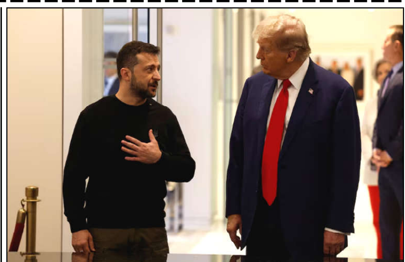
Republican presidential nominee and former U.S. President Donald Trump and Ukraine's President Volodymyr Zelenskiy meet at Trump Tower in New York City, U.S.

non-starter for Kyiv - Trump replied: "We'll see what happens." Still, Trump said on Friday he was pleased to meet with Zelenskiy, a marked change in tone from some of his previous comments on the campaign trail. On Monday, Trump said Zelenskiy wanted Harris to win the election. He has also called Zelenskiy "the greatest salesman of all time" because his country has received billions of dollars in military aid from the United States and Europe. "It's an honor to have the president with us, and he's been through a lot," Trump said on Friday. "He's been through a tremendous amount, like probably nobody else, almost nobody else in history, if you really get right down to it, and we're going to have a discussion and see what we could come up with."