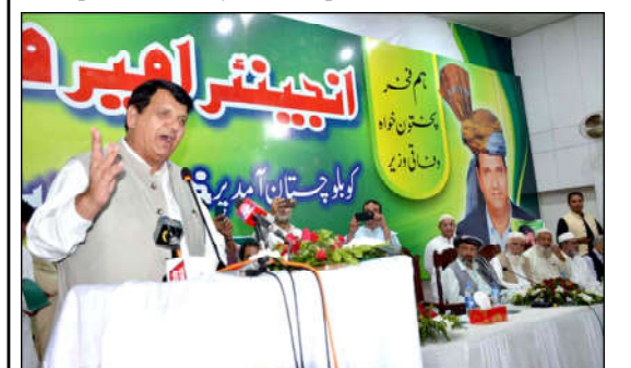
QUETTA: Federal Minister for States and Frontier Regions (SAFRON) Amir Muqam addresses a ceremony in honoring the hard work and dedication of coal mine workers.

sures. Amir Muqam said that no compromise will be made on the protection and rights of the workers working in the coal mine. The government was the key priority to provide all possible facilities to the workers, their all legitimate demands would be addressed. He also announced 2 ambulances for the coal mine workers. Engineer Amir Muqam hailed the approval of 7 billion dollar IMF deal, which will stabilize the economy of the country. "The political rivals of the PML-N and anti-Pakistan elements tried their best to sabotage the financial deal to put the country in the financial crises, however their nefarious designs failed," Amir Muqam remarked. Federal Minister said that those who destroy peace cannot be Pakistanis.