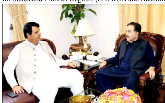
Affairs, Engineer Amir Muqam who called on him here at the Governor's House on Friday. During the course of meeting, the Governor and Federal Minister discussed the regional situation as well as the Kashmir conflict and the political scenario of the country besides the development process and federal government's support in the province.

Independent Report QUETTA: The much awaited reforms have begun in the Education Department, Balochistan as per the vision of Chief Minister, Mir Sarfraz Bugti. Show cause notices were issued to the District Education Officers of five districts on avoiding disciplinary action against the willful and chronic absentee teachers in their respective districts while services of some have also been placed under suspension. The show cause notices were issued to the District Education Officers of Killa Abdullah, Awaran, Usta Muhammad, Ziarat and Kharan. In the notices issued to the DEOs, it was stated that they willfully avoided initiating disciplinary proceedings against chronic absentee teachers reported during the visits by the concerned teams to date without any cogent reasons, which in turn badly affecting the education service delivery at the district level. Meanwhile, the Chief Minister Mir Sarfraz Bugti expressed contentment over the opening of closed schools in different parts of the province saying that Alhamdulillah, the schools closed for decades are functioning in the province. He said that a school of Awaran district closed for last 12 years has been opened. He said that the teachers have been posted in the school while books and stationery have also been made available there.