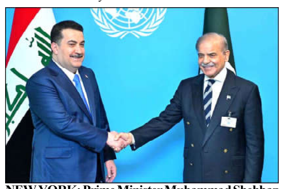
NEW YORK: Prime Minister Muhammad Shehbaz Sharif meets with Prime Minister of Iraq Mr. Mohammed Shia' Al Sudani on the sidelines of 79th session of the United Nations General Assembly.