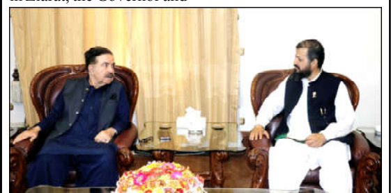
QUETTA: Senator Abdul Shakoor Achakzai meeting with Governor Balochistan Sheikh Jaffar Khan Mandokhail

Federal Minister SAFRON visited the Quaid-e-Azam Residency where they also planted saplings in it's premises. Later, they also met the local leaders and workers of Pakistan Muslim League-Nawaz (PML-N). Earlier, the Deputy Commissioner Ziarat, Liaquat Ali Kakar welcomed the Governor and Federal Minister for SAFRON.