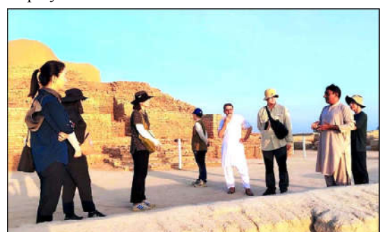
MOHENJO DARO: A tourist delegation from Korea are visiting and expressed keen interest in the historical ruins of the World Heritage Monuments of Mohenjo Daro.

LAHORE (APP): At least thirteen persons were killed and 1400 injured in 1334 Road Traffic Crashes (RTCs) in all 37 districts of Punjab during the last 24 hours. Out of these, 617 people with serious injuries were shifted to different hospitals, while 783 victims with minor injuries were treated at the incident site by Rescue Medical Teams thus reducing the burden of hospitals. Furthermore, the analysis showed those 783 drivers, 64 underage drivers, 140 pedestrians.