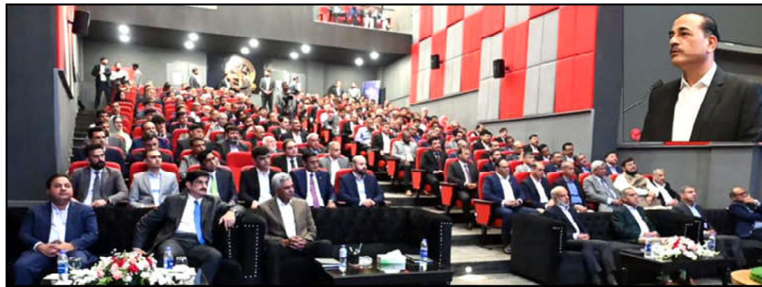
KARACHI: Chief of Army Staff (COAS) General Asim Munir addressing inaugural ceremony of Innovista Indus IT Park, a hub aimed at empowering Pakistan's youth by fostering academia-industry collaboration in the field of Information Technology, particularly Artificial Intelligence

the country. He said a number of projects were started in the country under the banner of China Pakistan Economic Corridor (CPEC). Reflecting on China's remarkable rise over the past few decades, Ahsan Iqbal praised the country's ability to lift 800 million people out of poverty in just three to four decades—an achievement unprecedented in human history. He emphasized that China's success lies not only in its modernization but also in its preservation of a unique cultural identity. "China's success has shown that modernization does not have to come at the cost of losing one's cultural roots," he remarked. China's distinctive approach—what the minister called the "Chinese style of development"—has allowed it to forge its own path, independent of Western models of democracy and capitalism.