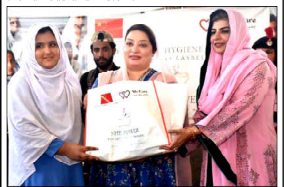
LASBELA: Coordinator to the Prime Minister on Climate Change, Romina Khurshid Alam distributing the Hygiene Kits to students at Hygiene Kits distributing ceremony.

place of Quaid-e-Azam Residency on Friday. The Governor said that different areas of Balochistan can become new attractive and profitable centers for tourism. He referred to the natural scenes, over 700 kilometers long coastal belt, rocks and mountains, fertile land of Mehr Garh and deserts found across Balochistan. It may be mentioned here that World Tourism Day is observed on 27th September every year all over the globe and so in Pakistan.