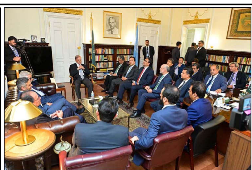
NEW YORK: Prime Minister Muhammad Shehbaz Sharif meets with a delegation of prominent Pakistani-American Bankers on the sidelines of 79th session of the United Nations General Assembly.

Thanking the prime minister for the opportunity to interact with him, the delegation lauded the government's policies that have been instrumental in achieving the macroeconomic stability in Pakistan. The delegation also expressed a deep interest in cooperating with the government for the development of manufacturing sector, especially SMEs to help bolster the exports. The delegation comprised high-ranking representatives from prestigious banks including JP Morgan, Natixis Corps & Investments, Sumitomo Mitsui Banking Corp, Goldman Sachs, Citizens Bank, Lazard, and Audax Group.