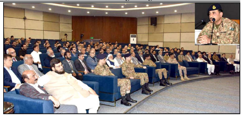
KARACHI: Chief of Army Staff (COAS) General Asim Munnir interacting with the business community of Karachi.

NEW YORK (APP): Pakistan and Iraq on Friday agreed to further deepen and broaden the scope of existing bilateral ties and exploit the potential of enhancing mutually beneficial cooperation between both countries. The bilateral ties were discussed in a meeting between Prime Minister Muhammad Shehbaz Sharif and his Iraqi counterpart Mohammed Shia' Al Sudani on the sidelines of 79th Session of the United Nations General Assembly here. The prime minister lauded the cordial ties between the two brotherly countries, reinforced by strong historical, cultural and religious affinities. He also commended the excellent arrangements made by the Government of Iraq for the Pakistani pilgrims. The two leaders also exchanged views on regional and international issues of mutual interest. They noted with grave concern the ongoing Israeli carnage on Gaza and the ensuing humanitarian catastrophe. Prime Minister Shehbaz Sharif reiterated Pakistan's call for an immediate ceasefire in Gaza and holding Israel accountable for the Gaza genocide. Underscoring the commonality of views on international issues, both the leaders resolved to reinforce the international efforts both at the UN and OIC platforms for immediate ceasefire in Gaza, unimpeded supply of humanitarian assistance to Palestinian brethren.