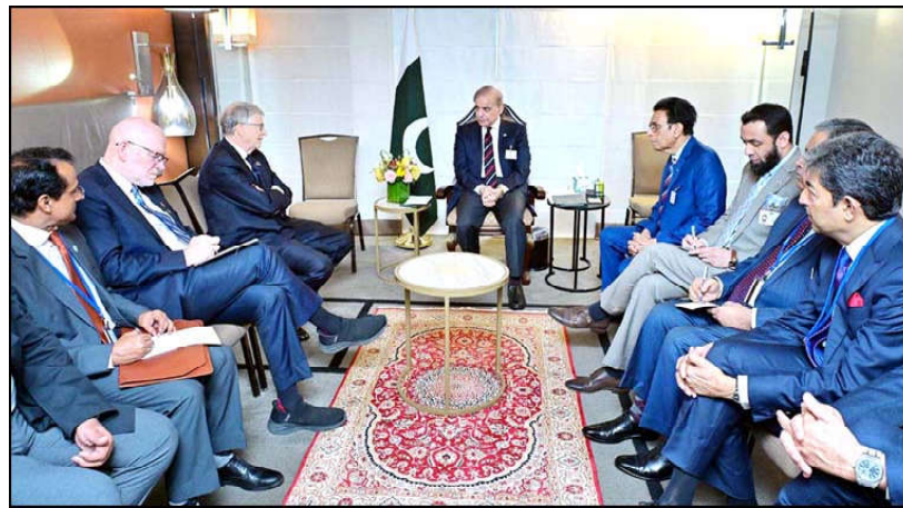
NEW YORK: Prime Minister Muhammad Shehbaz Sharif meets Mr. Bill Gates, founder and co-chair of the Bill & Melinda Gates Foundation (BMGF) on the sidelines of the 79th Session of the United Nations General Assembly.

PM Shehbaz also informed Sir Keir Starmer about the challenges Pakistan faced due to the adverse effects of climate change. He highlighted Pakistan's sacrifices in the fight against terrorism, which, he said, was a global issue that required collective action from the international community. The prime minister noted that the United Kingdom (UK) was the third-largest investor in Pakistan, and discussed the investment opportunities and projects available in the country. While mentioning the significant role of Pakistanis residing in the UK in the development of both countries, the prime minister expressed a desire to utilize their contributions effectively to achieve mutual development goals.