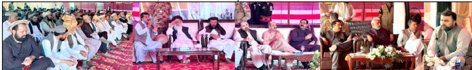
ZHOB: Chief Minister Balochistan Mir Sarfaraz Ahmed Bugti addressing elites during tribal jirga. Provincial Ministers, Parliamentary Secretaries, MPs and high officials are also present

The arrival of record remittances from overseas Pakistanis was also a good omen, he remarked.