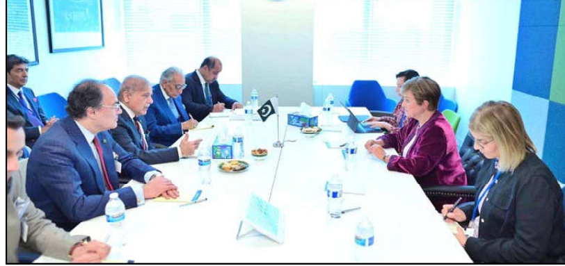
NEW YORK: Prime Minister Muhammad Shehbaz Sharif meets Ms. Kristalina Georgieva, the Managing Director of the International Monetary Fund (IMF) on the sidelines of the UNGA.

Likewise, he said the Council must extend active support to the African Union to defeat terrorism and foreign interventions. "UN peacekeeping must become more robust and effective."