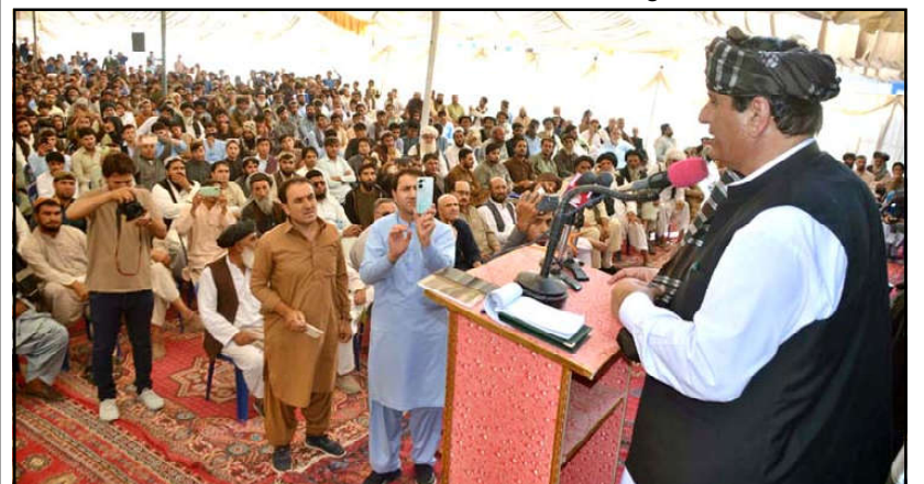
QUETTA: Federal Minister for State and Frontier Regions (SFRON) and Kashmir Affairs Engineer Amir Muqam addressing at Afghan Refugees Camp in Saranan area of Pishin district during his visit.

Chief Minister Mir Sarfaraz Bugti, parliamentarians, military leadership, district administration, political, tribal and religious personalities participated. The Jirgah stressed the need to expedite speed of development work on the ongoing projects. He said that peace and development are compulsory for one another. He said the sustainable peace and public security is the basis for development of the civilized society. He said that a peaceful and economically prosperous society enable the people to lead life with dignity and freedom. He said that the circumstances have reached such an extent that we are getting affected due to the terrorism and fundamentalism directly or indirectly. Therefore, we have to find out the solution to the prevailing lawlessness sitting together.