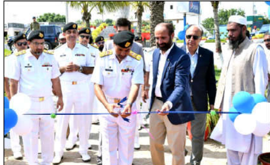
KARACHI: Commandant PNS BAHADUR inaugurating World Maritime Day Gala 2024 at Pakistan Maritime Museum.

On the proposal of legal team of EC, decision was taken to file miscellaneous petition in SC.