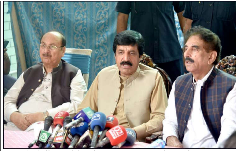
LARKANA: Sindh Minister for Health and Population Welfare Department Dr. Azra Fazal Pechuho addressing during the first SMBBMU International Conference on Family Planning "Way Forward For A Sustainable World" at Chandka Medical College auditorium Hall.

PESHAWAR (APP): Khyber Pakhtunkhwa Chief Minister Ali Amin Gandapur has appointed former KP governor Shah Farman as his Senior Advisor on Political Affairs. The CM Secretariat in a letter to the Chief Secretary on Thursday said that the services of Shah Farman would be utilized on honorary basis without any remuneration or compensation. The CM further directed that the Advisor Shah Farman should be officially invited in all cabinet meetings.