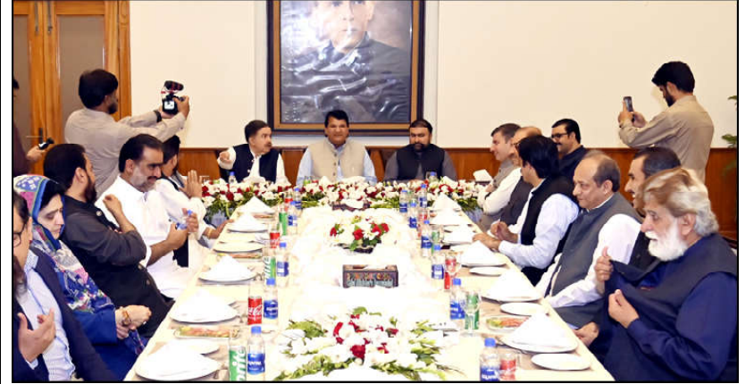
QUETTA: Chief Minister Mir Sarfraz Bugti hosted dinner in honour of the Federal Minister for SAFRON, Amir Muqam, Governor, Jaffar Khan Mandokhail, Speaker of Provincial Assembly, Abdul Khaliq Achakzai and Provincial Ministers

He said that federal government would extend every possible cooperation to resolve issues of the province and cope with the challenges.