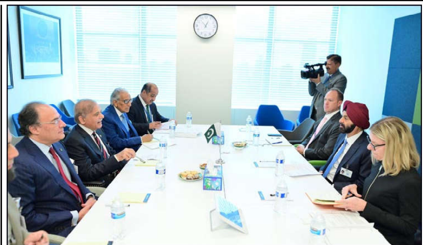
Prime Minister Muhammad Shehbaz Sharif meets Mr. Ajaypal Singh Banga, President of the World Bank on the sidelines of the UNGA in New York. Finance Minister, Muhammad Aurangzeb was also present in the meeting.

During the session, Minister Jam Kamal Khan asked council members to submit proposals for further review by the Executive Committee of Commerce, chaired by the Commerce Minister himself.