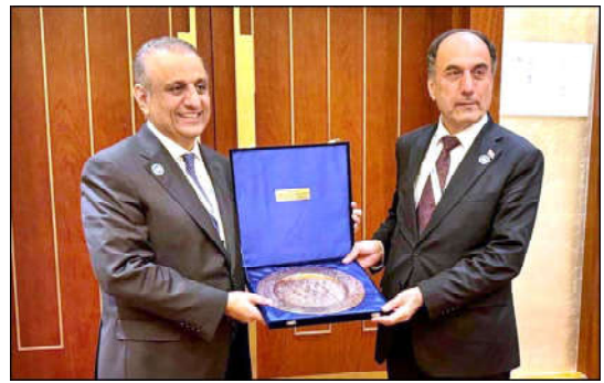
BEIJING: Transport Minister of Tajikistan, Azim Ibrahim & Federal Minister for Communications, Abdul Aleem Khan during a meeting.