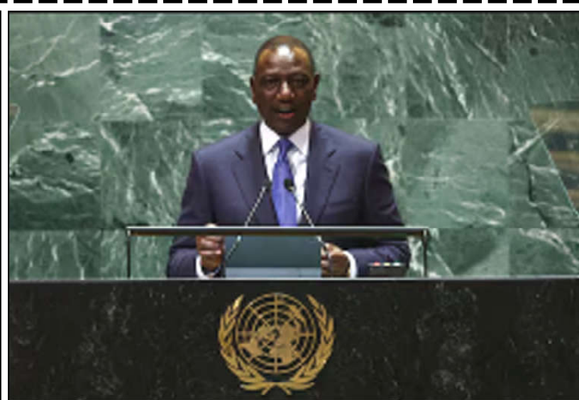
Kenya's President William Ruto addresses the 79th United Nations General Assembly at United Nations headquarters in New York, U.S.