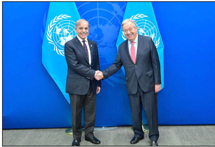
NEW YORK: Prime Minister Muhammad Shehbaz Sharif meets with Secretary General of the United Nations Antonio Guterres on the sidelines of 79th session of United Nations General Assembly.

Prime Minister Shehbaz also underscored the need for stemming the rising tide of Islamophobia, and discrimination against Muslims worldwide.