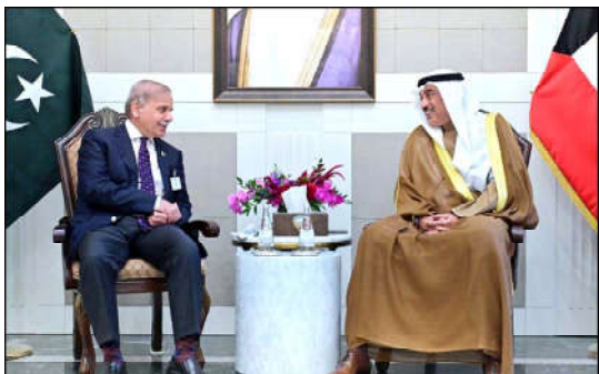
NEW YORK: Prime Minister Muhammad Shehbaz Sharif held a meeting with the Crown Prince of Kuwait His Highness Sheikh Sabah Al-Khaleed Al-Hamad Al-Mubarak Al-Sabah on the sidelines of the 79th United Nations General Assembly Session.

The arrested female suicide bomber Adeela Baloch was working as a nurse at Turbat Teaching Hospital at the time of her arrest. The arrest of Adeela Baloch by security forces has been hailed as a significant achievement, showcasing the authorities' relentless efforts and effective intelligence operations to purge the country from the menace of terrorism.