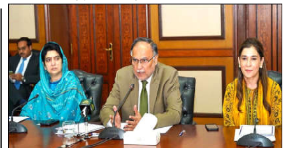
ISLAMABAD: Federal Minister for Planning, Development, and Special Initiatives, Ahsan Iqbal chaired the inaugural meeting of the Education Task Force.