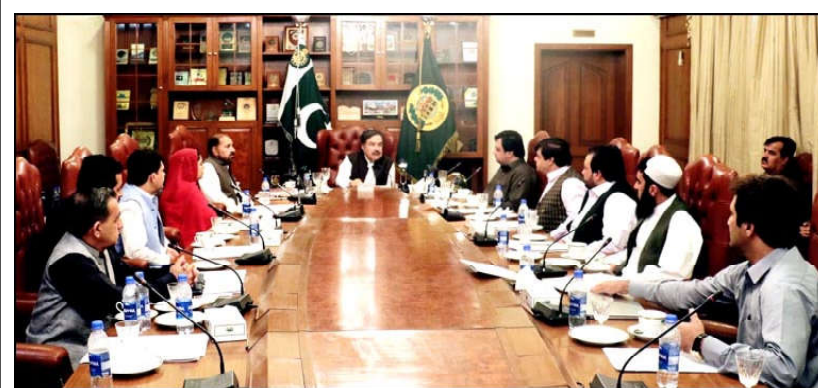
QUETTA: Governor Balochistan Sheikh Jaffar Khan Mandokhail presiding over annual meeting of Pakistan Red Crescent Society Balochistan

He stressed that the amendments in constitution should be made with consensus according to the requirements of the country and people.