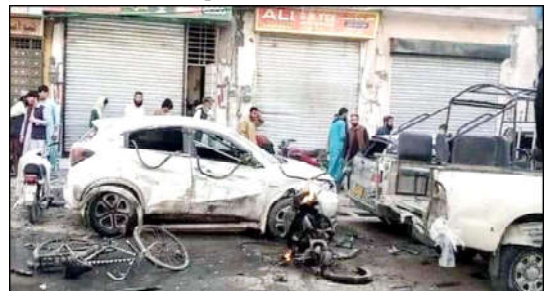
QUETTA: A view of destroyed vehicle seen on blast site. Twelve people were injured in a blast that targeted a police van near Eastern Bypass in Quetta, hospital and government officials said.

Meanwhile the Government of Balochistan has issued orders for investigation into the terrorists' attack on the police mobile in Quetta. According to the spokesman of provincial government, the police mobile was targeted in the terrorism attack in eastern bypass area of Quetta.