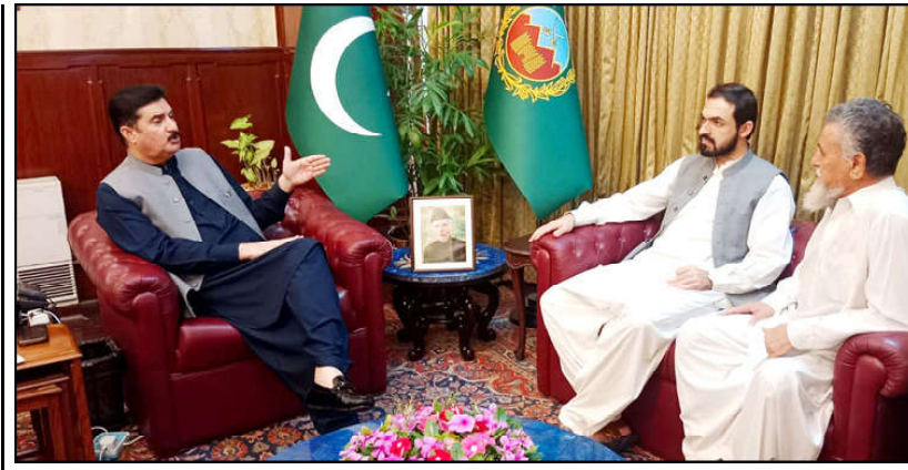
PESHAWAR: Governor Khyber Pakhtunkhwa Faisal Karim Kundi called on by MPA Sardar Ehsan Ullah Khan Mainkhel at Governor House.

Out of them, 578 people with serious injuries were shifted to different hospitals, while 825 victims with minor injuries were treated on the spot by Rescue Medical Teams.