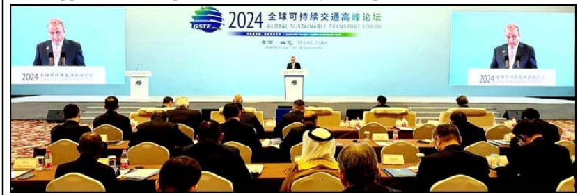
BEIJING: Federal Minister for Communications, Abdul Aleem Khan addressing during the opening session of Global Transport Forum 2024, in Beijing.

In this regard, he profusely thanked China, Saudi Arabia and the UAE, saying without their support this would not have been possible. The premier said his government had accepted the economic challenge to the country and now, with collective efforts of the government and all institutions.